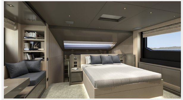
Master cabin 1