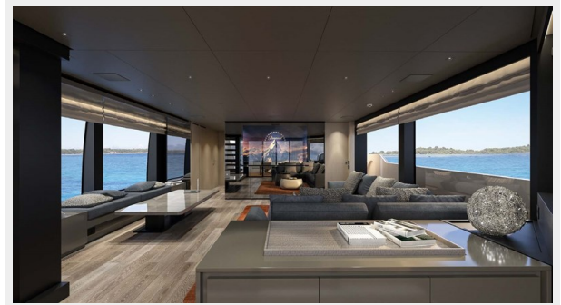
Main Salon 1