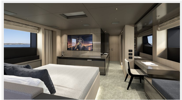
Master cabin 3