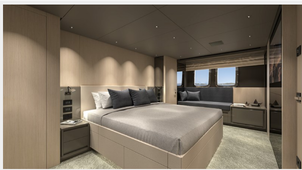
VIP cabin 1