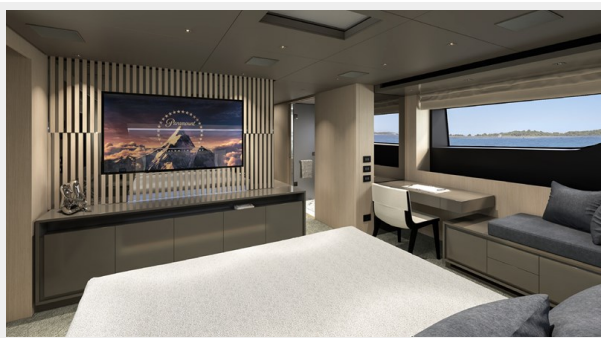
Master cabin 2