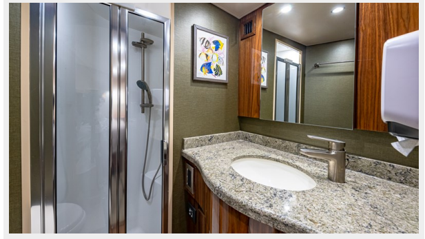
Owner's Stateroom Ensuite