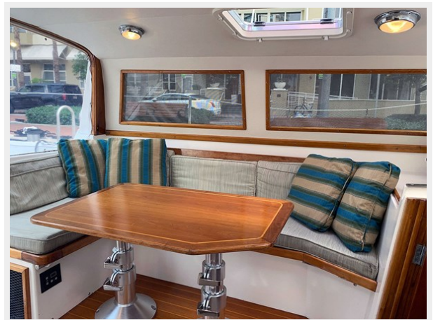
Pilothouse, Port Aft