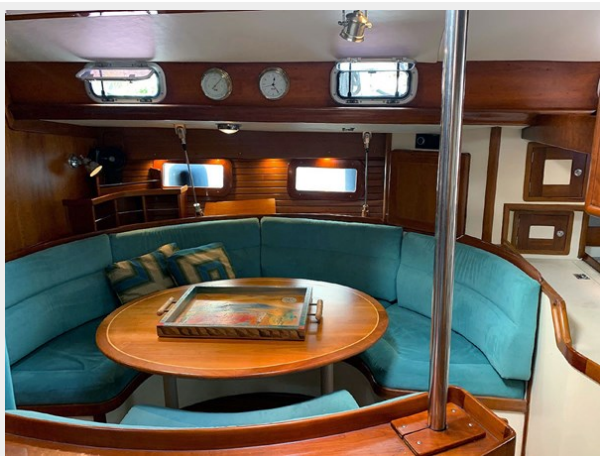
Main Salon, Stbd.