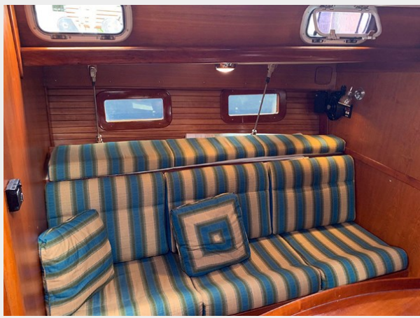
Main Salon, Port