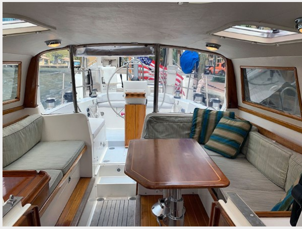
Pilothouse, Looking Aft