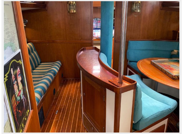
Main Salon Fwd.