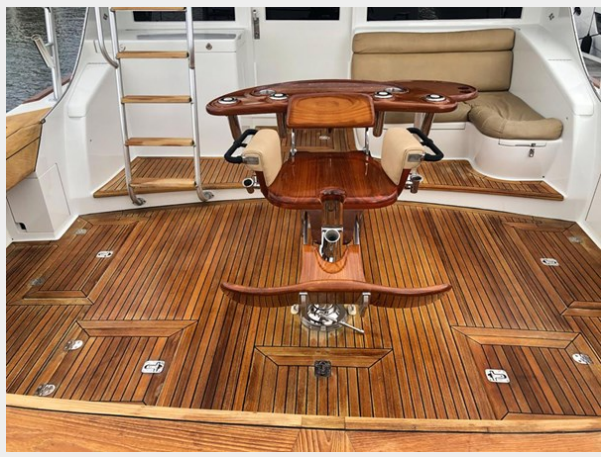
Release Fighting Chair