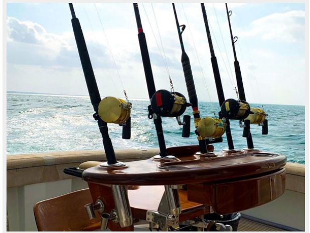
Release Stand Alone Rocket Launcher