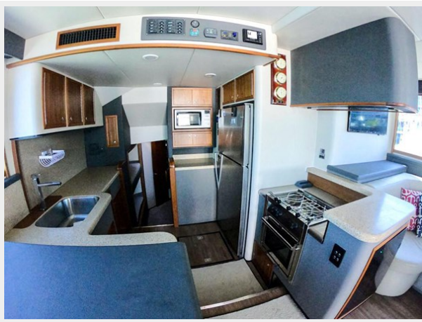
Full Galley - Teak Cabinets