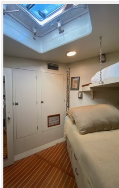
34 _1983 90ft Defever 90 Ocean Trawler KAMAHELE