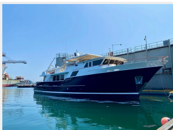
4 _1983 90ft Defever 90 Ocean Trawler КАМАХЕДЕ