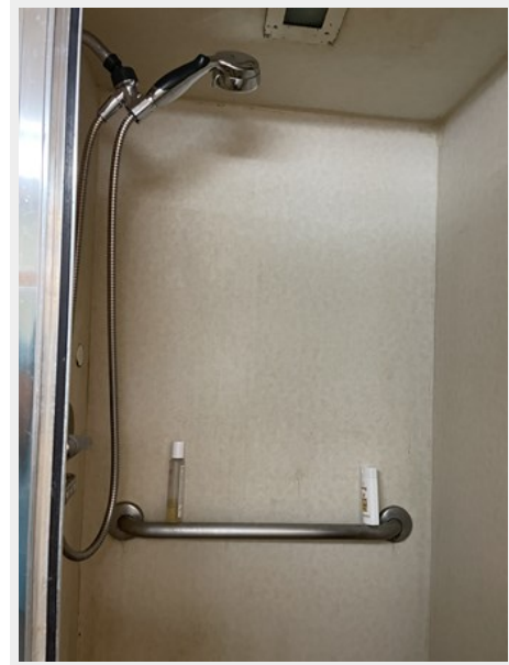
39 _1983 90ft Defever 90 Ocean Trawler KAMAHELE