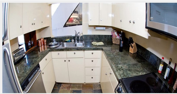
26 _1983 90ft Defever 90 Ocean Trawler KAMAHELE