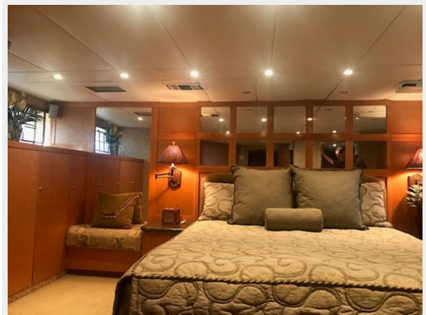
27 _1983 90ft Defever 90 Ocean Trawler KAMAHELE