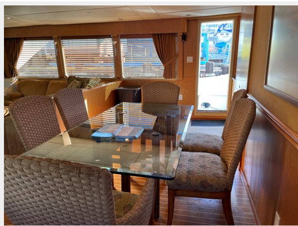
22 _1983 90ft Defever 90 Ocean Trawler KAMAHELE