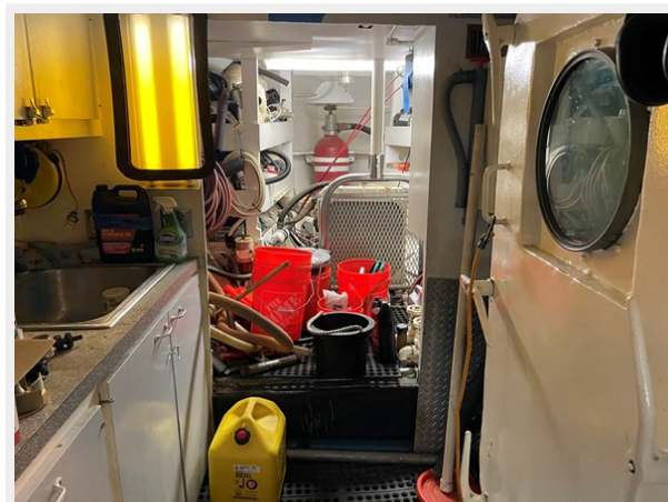
46 _1983 90ft Defever 90 Ocean Trawler KAMAHELE