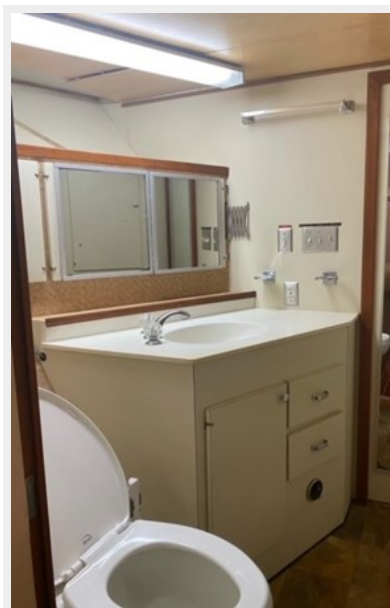
36 _1983 90ft Defever 90 Ocean Trawler KAMAHELE