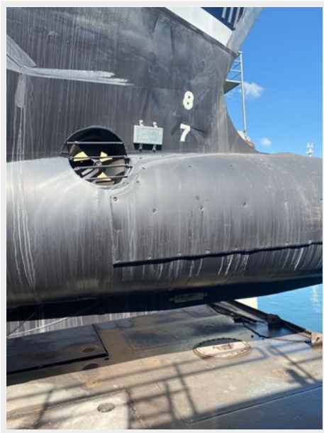
49 _1983 90ft Defever 90 Ocean Trawler KAMAHELE