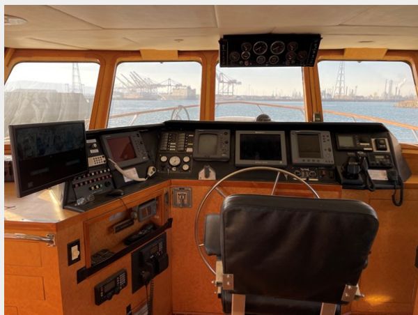
10 _1983 90ft Defever 90 Ocean Trawler KAMAHELE