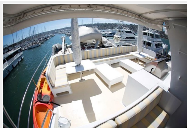
7 _1983 90ft Defever 90 Ocean Trawler KAMAHELE