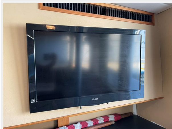
18 _1983 90ft Defever 90 Ocean Trawler KAMAHELE