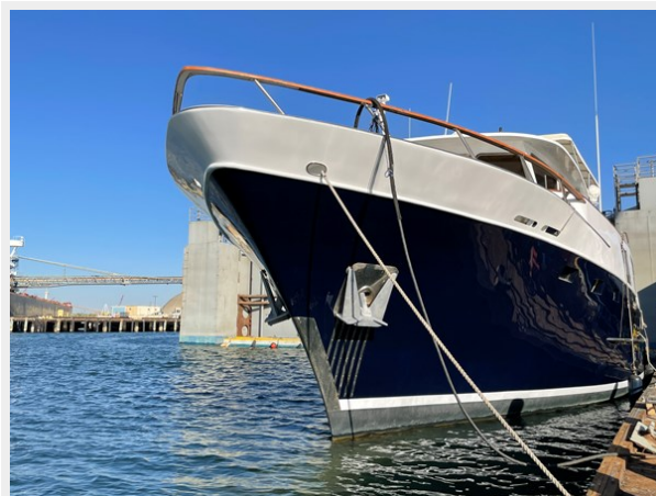
3 _1983 90ft Defever 90 Ocean Trawler КАМАХЕДЕ