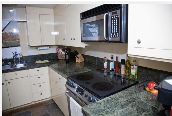
24 _1983 90ft Defever 90 Ocean Trawler KAMAHELE