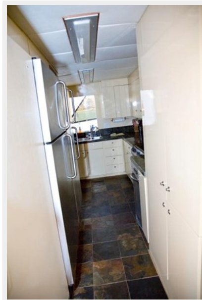
23 _1983 90ft Defever 90 Ocean Trawler KAMAHELE