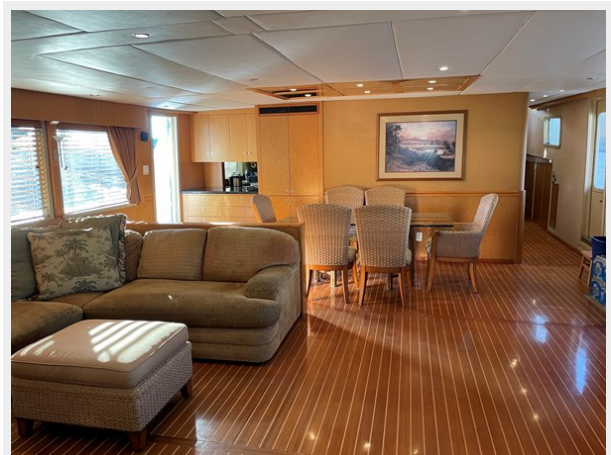
19 _1983 90ft Defever 90 Ocean Trawler KAMAHELE