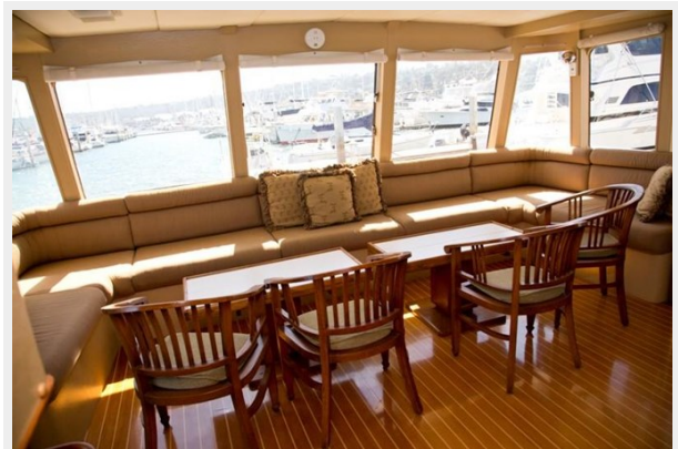
15 _1983 90ft Defever 90 Ocean Trawler KAMAHELE