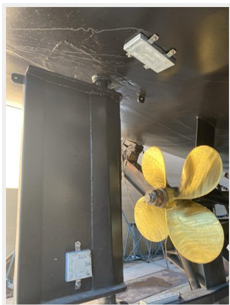
47 _1983 90ft Defever 90 Ocean Trawler KAMAHELE