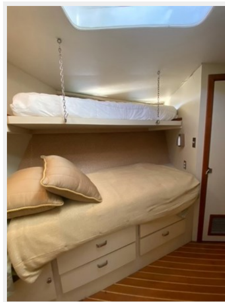
35 _1983 90ft Defever 90 Ocean Trawler KAMAHELE