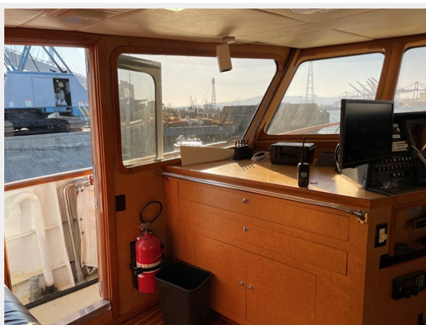
12 _1983 90ft Defever 90 Ocean Trawler KAMAHELE