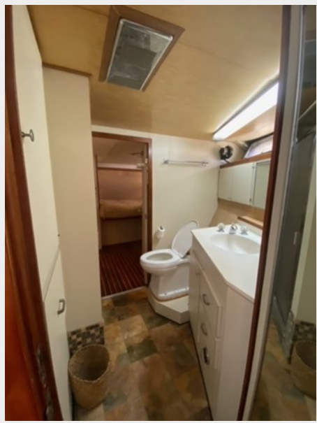
38 _1983 90ft Defever 90 Ocean Trawler KAMAHELE