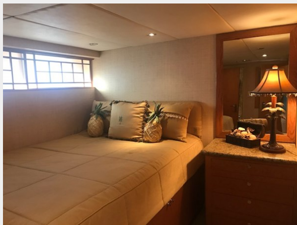
30 _1983 90ft Defever 90 Ocean Trawler KAMAHELE