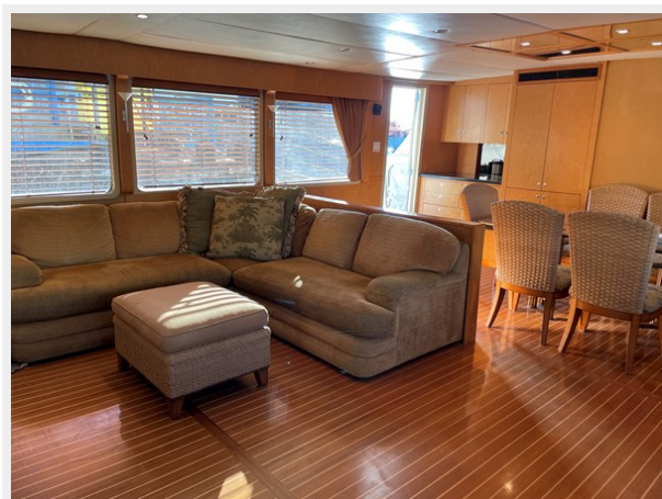
20 _1983 90ft Defever 90 Ocean Trawler KAMAHELE