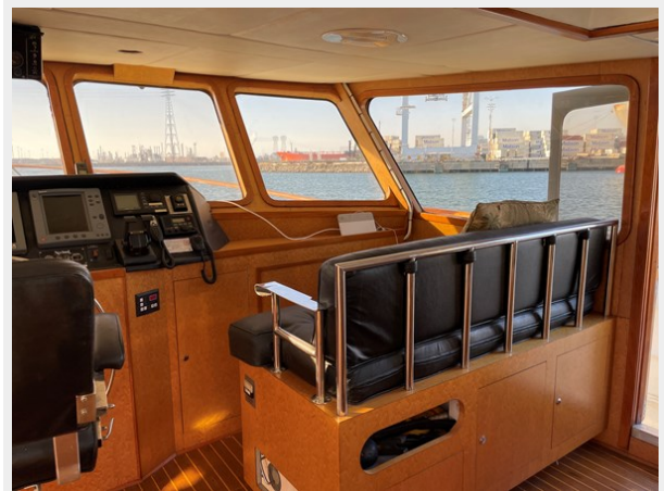
11 _1983 90ft Defever 90 Ocean Trawler KAMAHELE