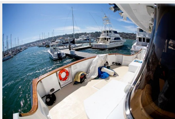
6 _1983 90ft Defever 90 Ocean Trawler KAMAHELE