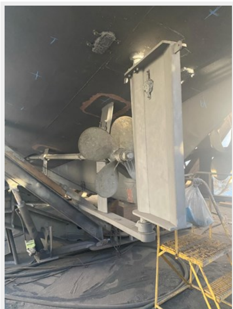
51 _1983 90ft Defever 90 Ocean Trawler KAMAHELE