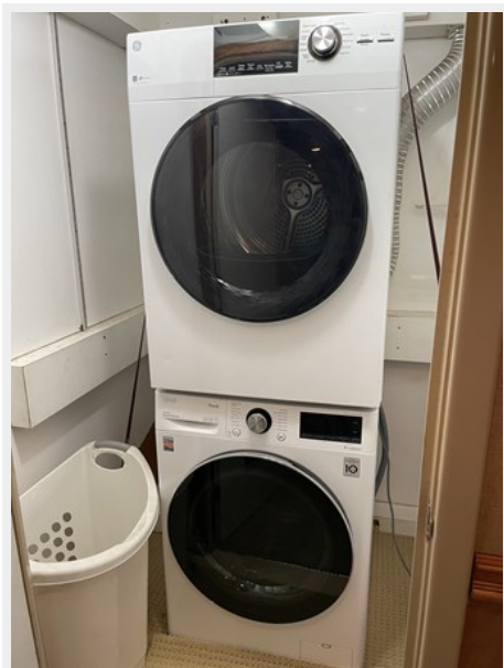
40 _1983 90ft Defever 90 Ocean Trawler KAMAHELE