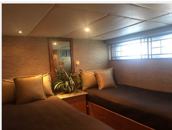
32 _1983 90ft Defever 90 Ocean Trawler KAMAHELE