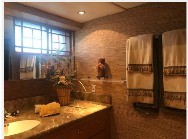
31 _1983 90ft Defever 90 Ocean Trawler KAMAHELE