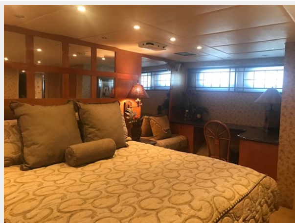
28 _1983 90ft Defever 90 Ocean Trawler KAMAHELE