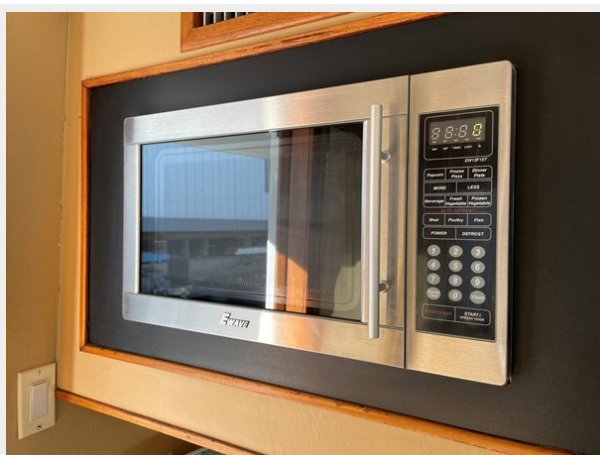
16 _1983 90ft Defever 90 Ocean Trawler KAMAHELE