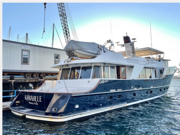
2 _1983 90ft Defever 90 Ocean Trawler КАМАХЕДЕ