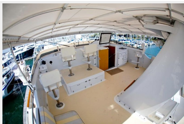
8 _1983 90ft Defever 90 Ocean Trawler KAMAHELE