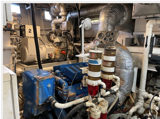
42 _1983 90ft Defever 90 Ocean Trawler KAMAHELE