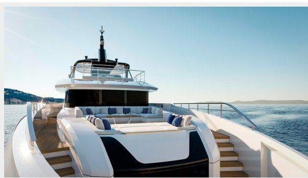
BAGLIETTO DOM133 Forward Lounge