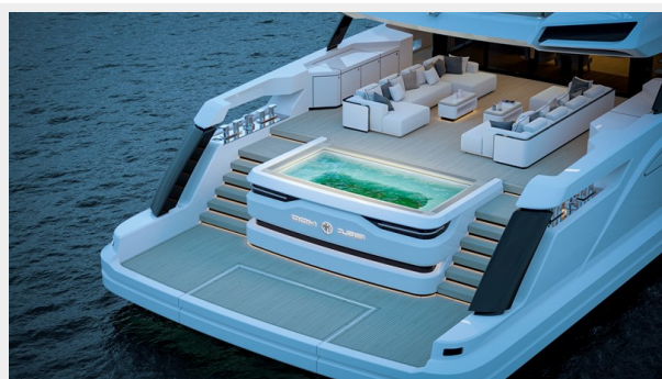
BAGLIETTO DOM133 Aft Pool