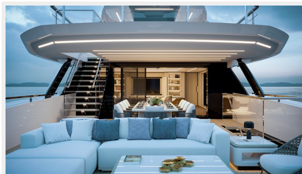
BAGLIETTO DOM133 Upper Deck Exterior Lounge