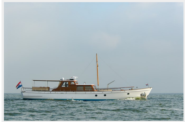
dsc_0970 - version 2