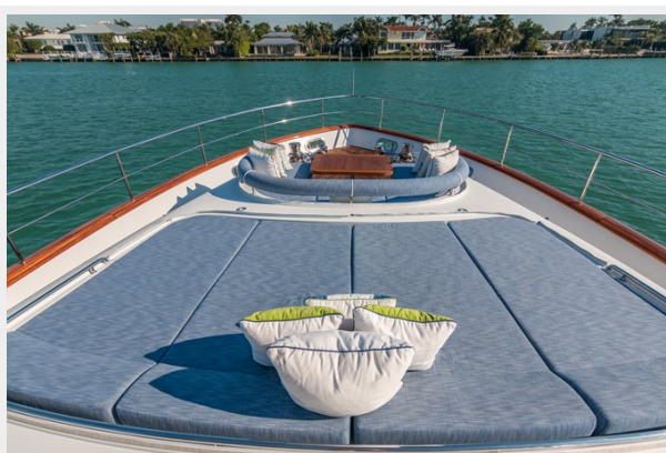
PRIMA MEA 107'/32.61m Vicem 2013/2021: Bow Seating