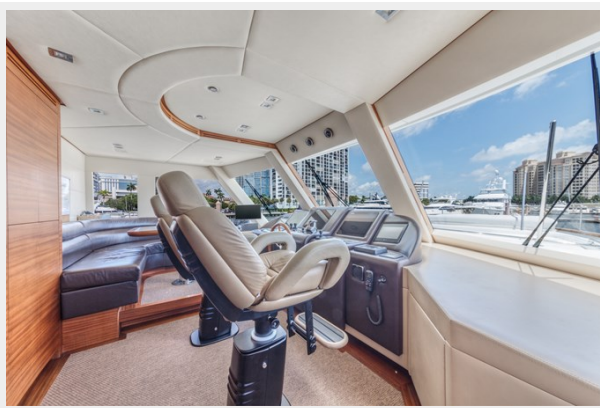
PRIMA MEA 107'/32.61m Vicem 2013/2021: Wheelhouse