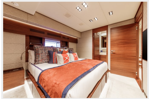
PRIMA MEA 107'/32.61m Vicem 2013/2021: Guest Stateroom