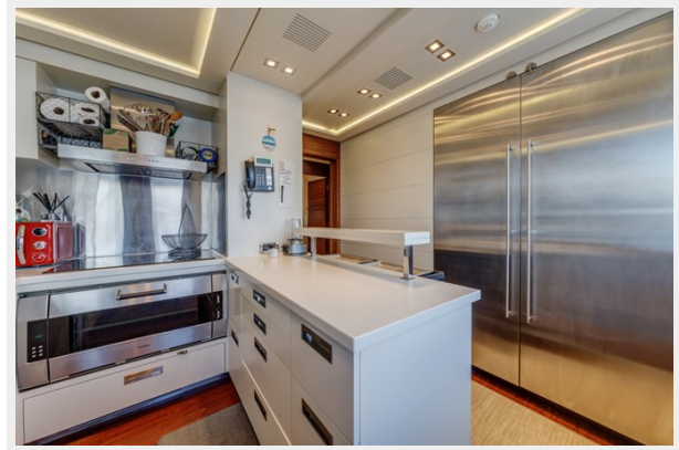
PRIMA MEA 107'/32.61m Vicem 2013/2021: Galley