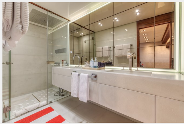
PRIMA MEA 107'/32.61m Vicem 2013/2021: Master Ensuite