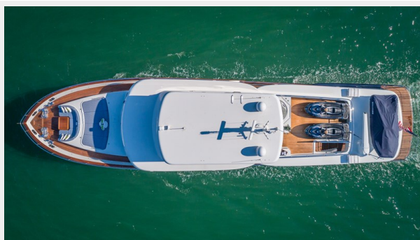
PRIMA MEA 107'/32.61m Vicem 2013/2021