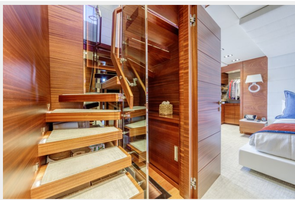
PRIMA MEA 107'/32.61m Vicem 2013/2021: Staircase to Guest Staterooms