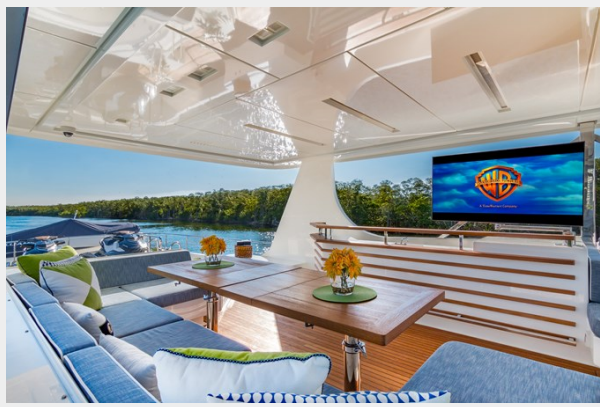
PRIMA MEA 107'/32.61m Vicem 2013/2021: Top Deck Dining