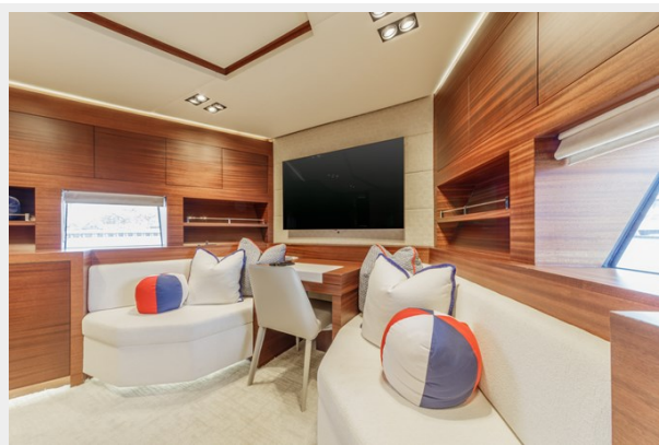
PRIMA MEA 107'/32.61m Vicem 2013/2021: Forward Guest Stateroom