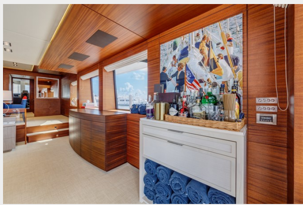
PRIMA MEA 107'/32.61m Vicem 2013/2021: Main Salon