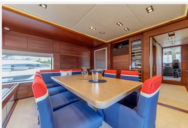
PRIMA MEA 107'/32.61m Vicem 2013/2021: Main Salon Dining Area