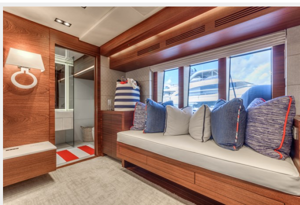
PRIMA MEA 107'/32.61m Vicem 2013/2021: Master Stateroom