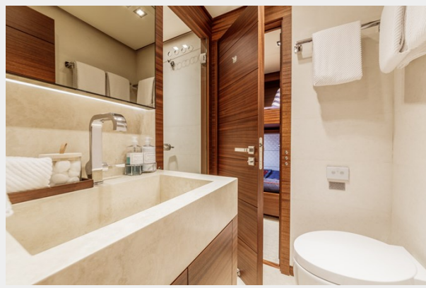
PRIMA MEA 107'/32.61m Vicem 2013/2021: Guest Ensuite