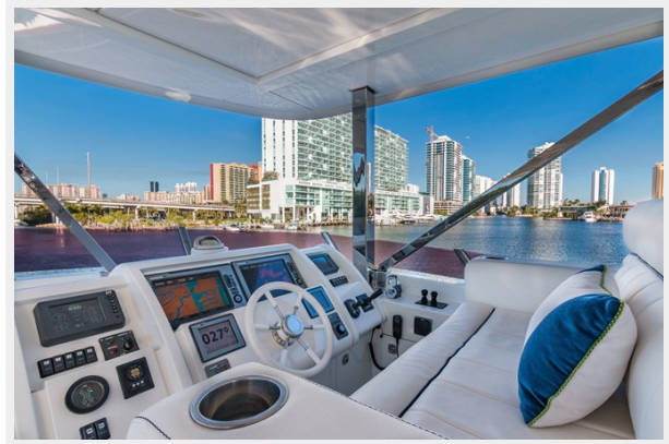
PRIMA MEA 107'/32.61m Vicem 2013/2021: Top Deck Driving Station