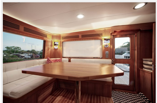
CB Settee and Table