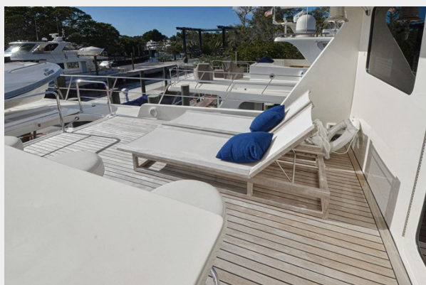
Upper deck lounge