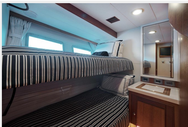
Starboard Guest Bunks