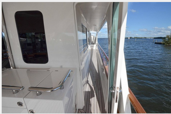
Aft Docking Station