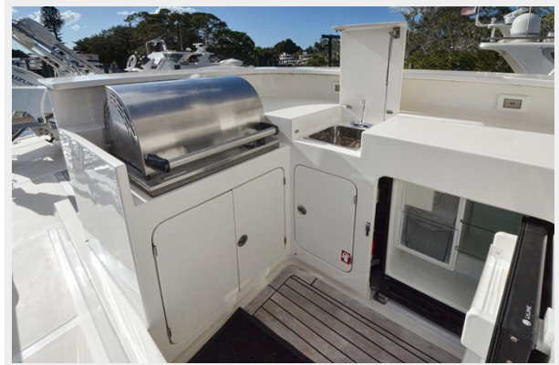
Upper Deck Grill & Refrigeration