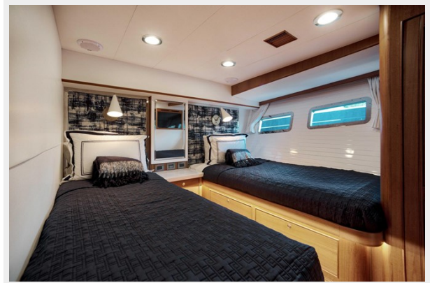
Port Guest Bunks