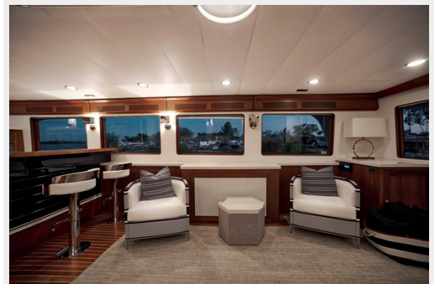
Salon Port Side Chairs and TV