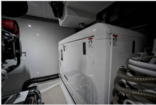
Generator 1 and 2