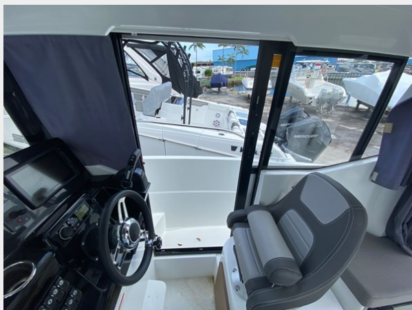
09-STARBOARD ENTRY DOOR