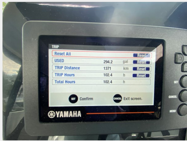
19- YAMAHA GAUGE 102.4HRS