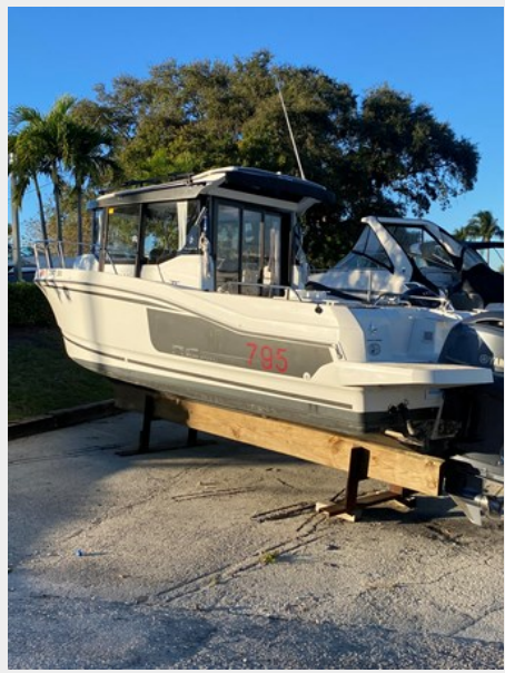
01-PORT SIDE VIEW