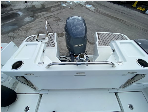
06-STERN TOP VIEW