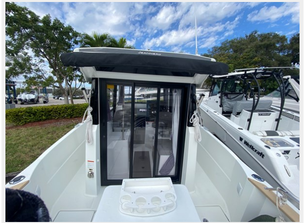
08-SALON BACK ENTRY