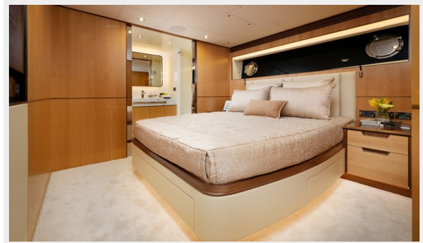
Guest Stateroom 1