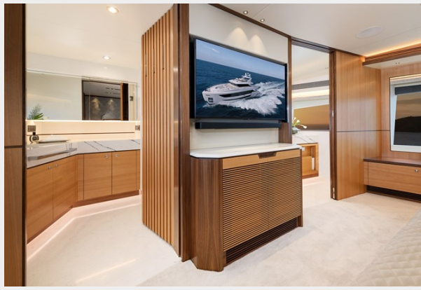
Master Suite Heads