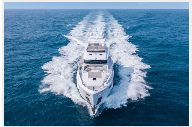
FD92 Aerial 2