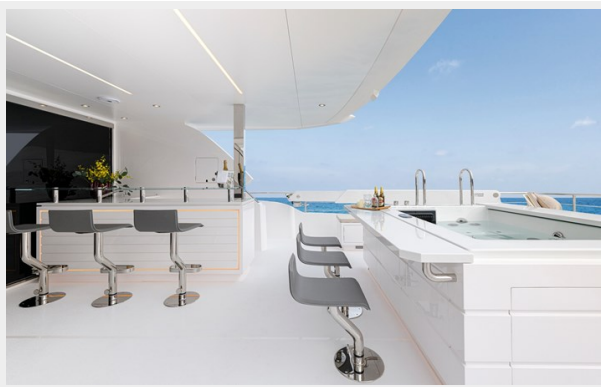
Aft of Enclosed Pilothouse Bar and Hot Tub