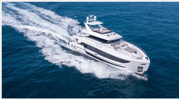
FD92 Aerial 1