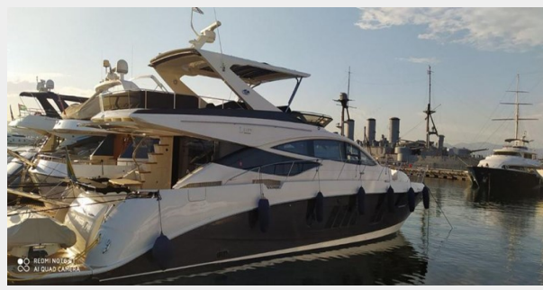
2016 Sea Ray L650 Fly - July 2021 phtos2