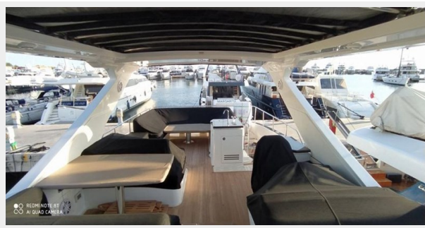
2016 Sea Ray L650 Fly - July 2021 phtos1