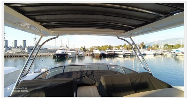
2016 Sea Ray L650 Fly - July 2021 phtos13