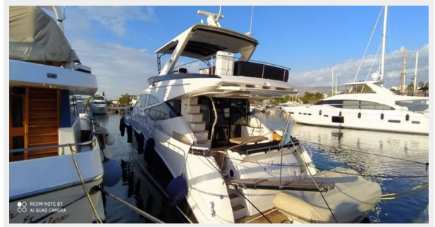
2016 Sea Ray L650 Fly - July 2021 phtos4