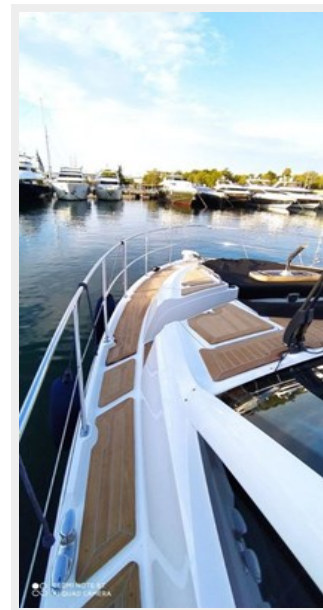
2016 Sea Ray L650 Fly - July 2021 phtos13