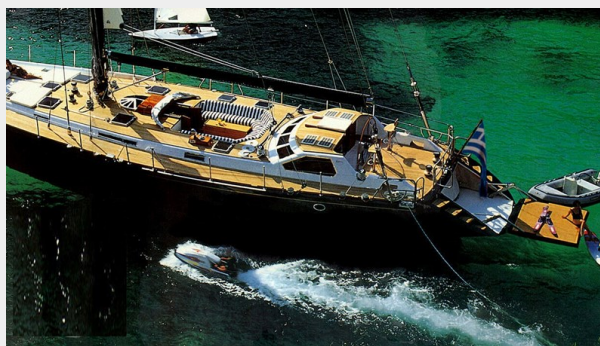
Custom Beach Club