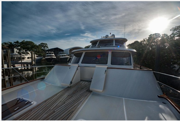
Foredeck looking aft