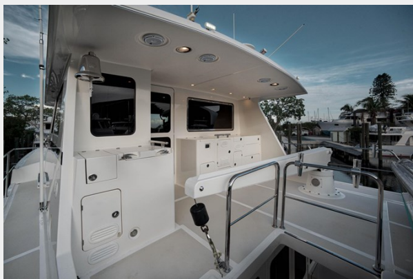
Upper aft deck