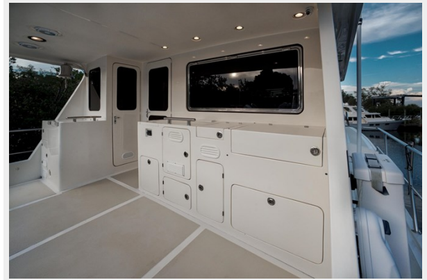
Upper aft deck storage