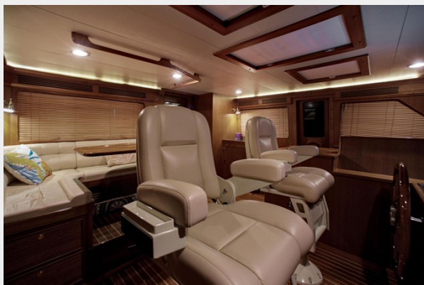
COMmand Bridge looking aft