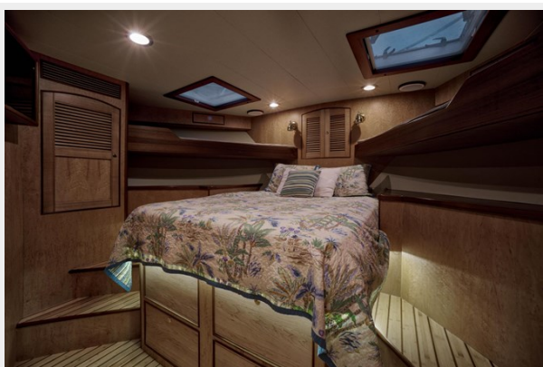
VIP looking to Port