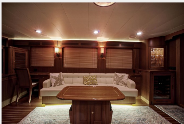
Salon looking to starboard