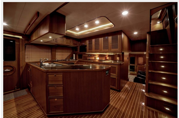
Galley-Steps to Command Bridge