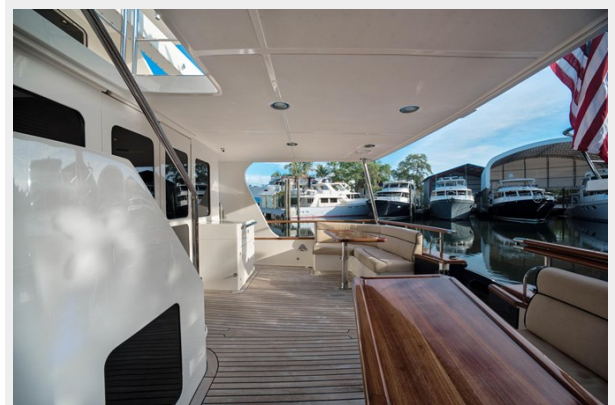
Cockpit looking to starboard