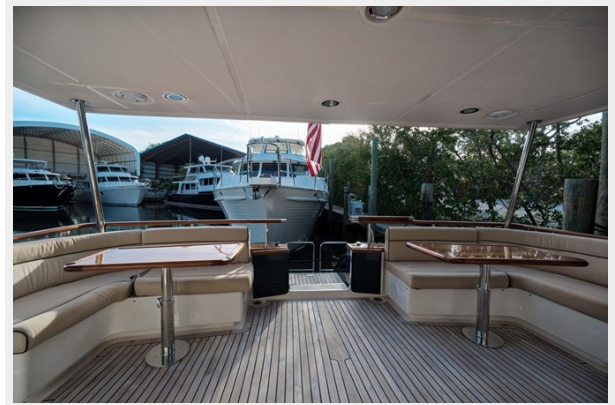
Cockpit looking aft