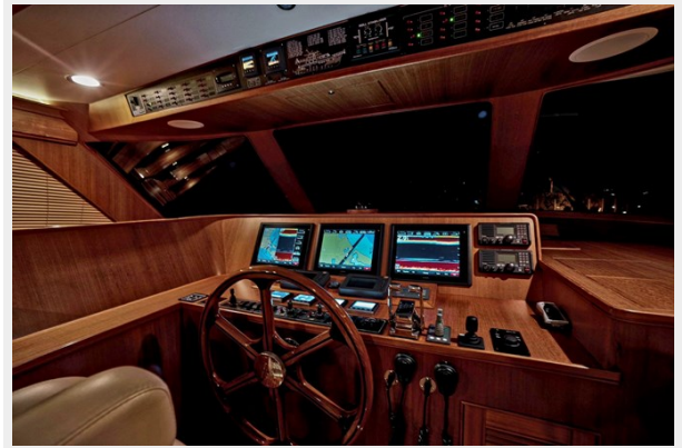
Command Bridge Helm