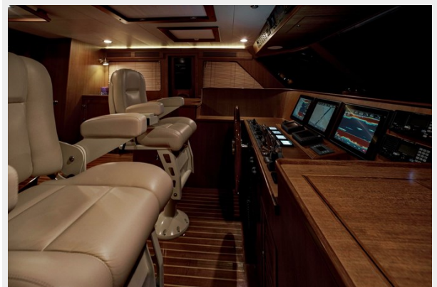
Helm looking to port