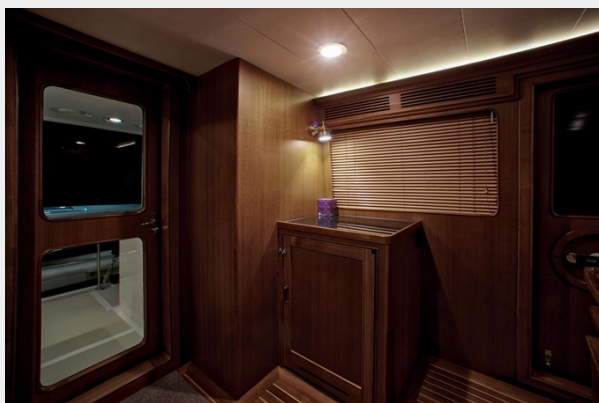
Command Bridge refrigerator