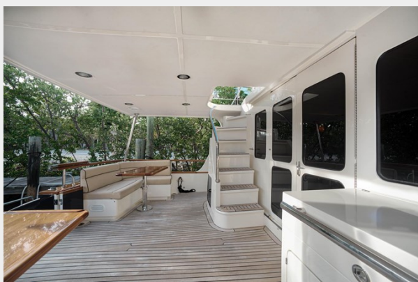
Cockpit looking to port