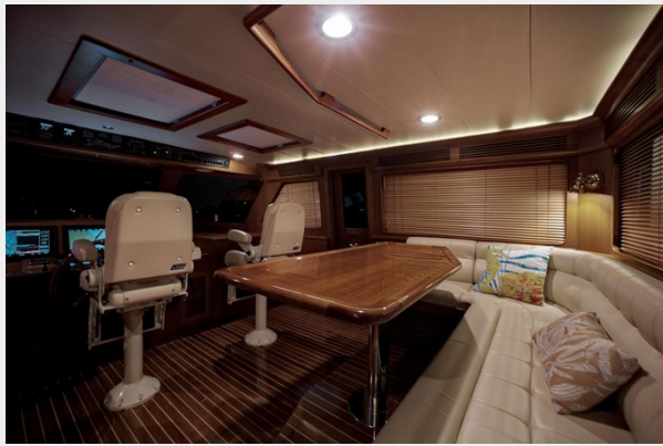
Command Bridge seating area