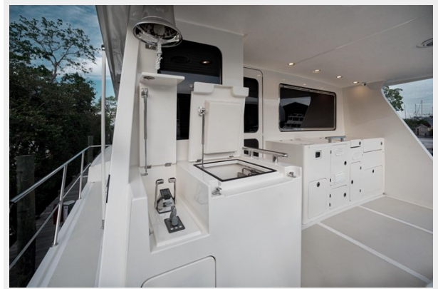
Upper aft deck docking station