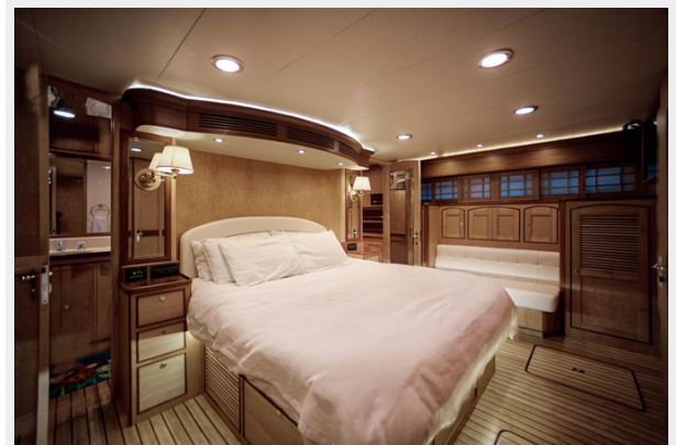
Master stateroom looking to port