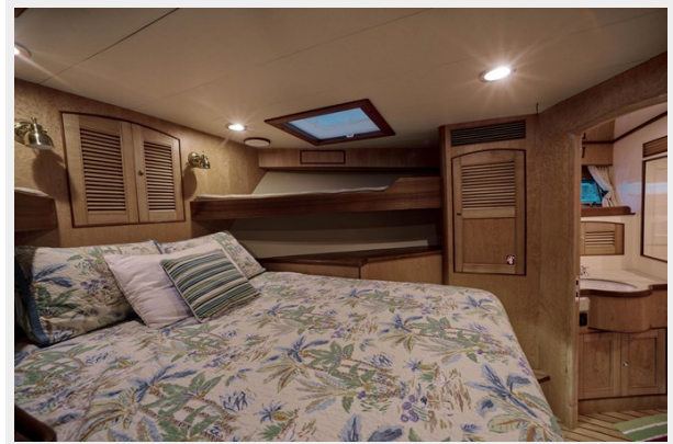
VIP looking to starboard