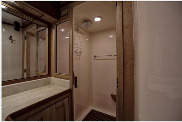
Master Stateroom shower