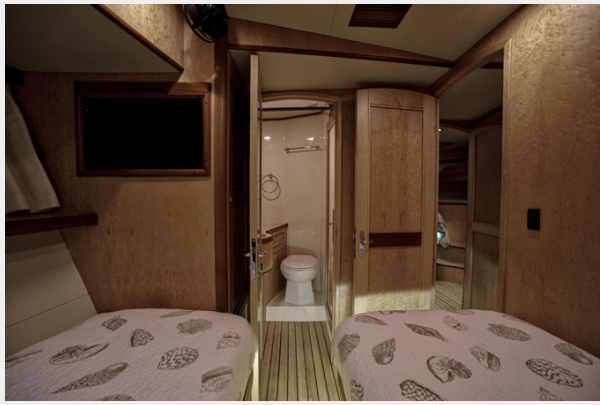
Port guest stateroom looking forward