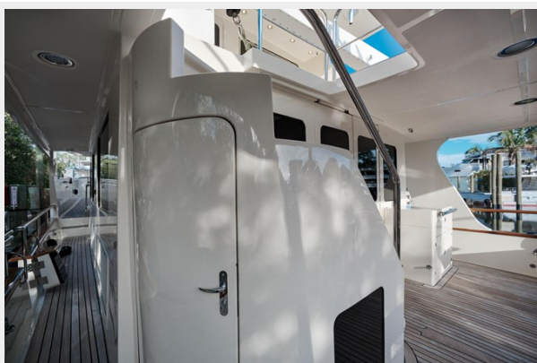
Engine Room-Crew Quarter entrance