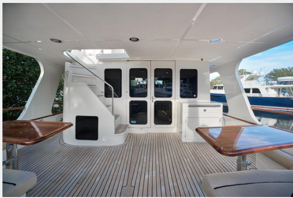
Cocopit looking forward