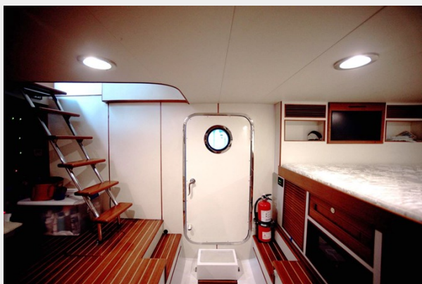
Crew Quarters looking forward