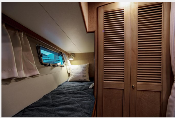
Stbd guest stateroom-Laundry