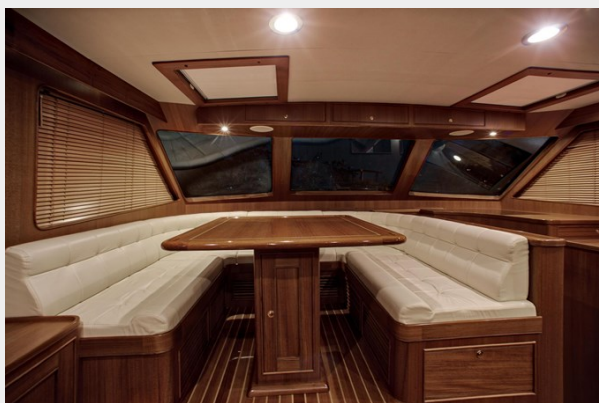
Dining table looking forward