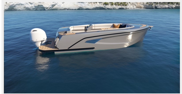
AS 18 - OUTBOARD MOTOR 02