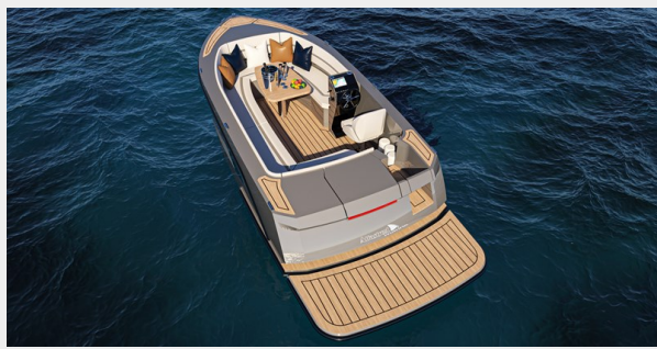
AS 18 - LATERAL CONSOLE