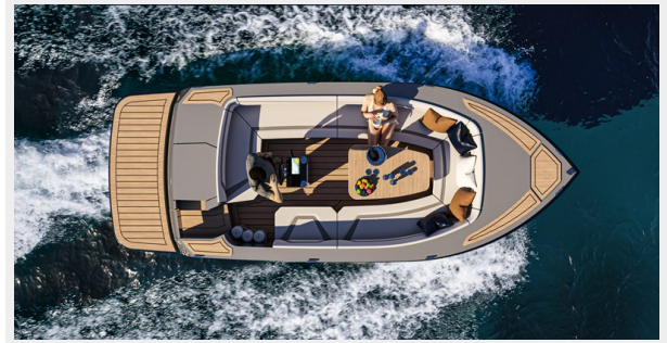
AS 18 - BIRD VIEW - TABLE