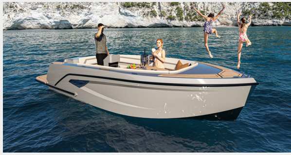
AS 18 - HALF SIDE BOW VIEW