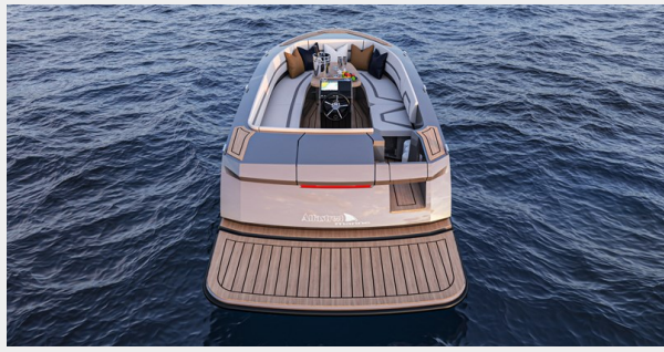
AS 18 - STERN VIEW