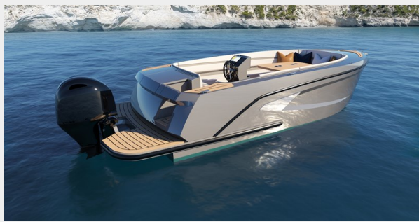
AS 18 - OUTBOARD MOTOR