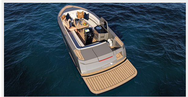
AS 18 - GALLEY VIEW