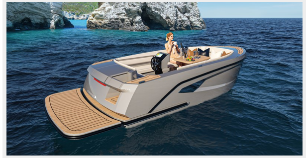
AS 18 - HALF SIDE STERN VIEW