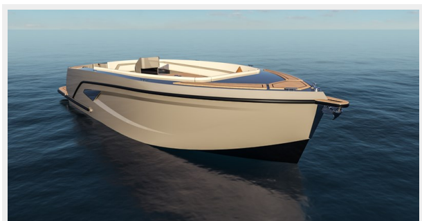
AS 18 - ANCHOR 03