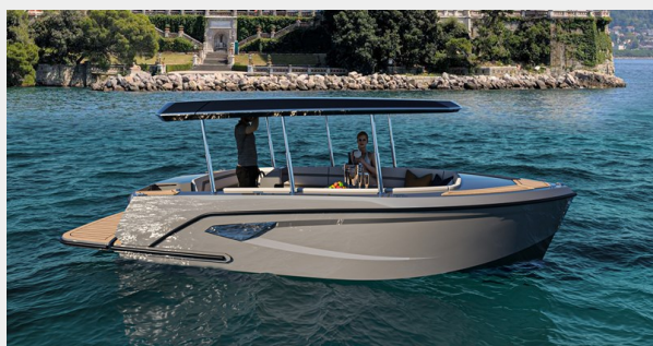
AS 18 - SIDE VIEW 02 NEW BACKGROUND