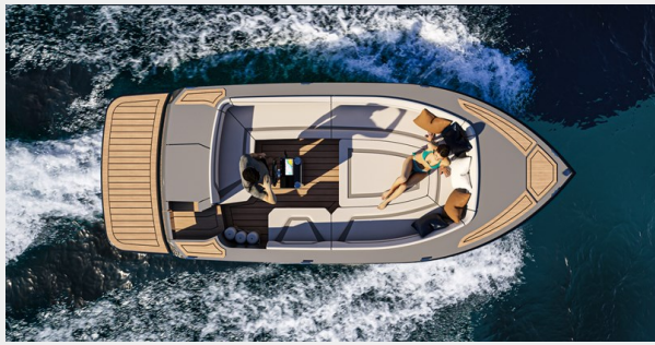
AS 18 - BIRD VIEW - SUNBED