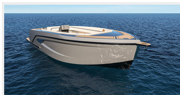
AS 18 - ANCHOR 02