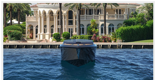
AS 18 - BOW LOWER VIEW