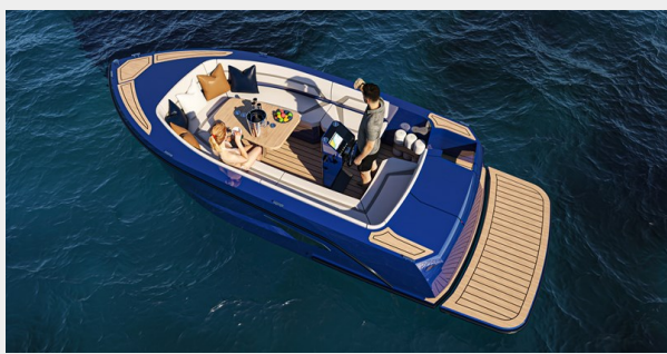
AS 18 - CABIN VIEW