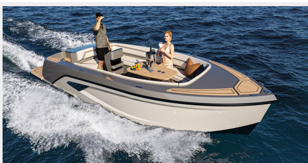
AS 18 - HALF AREAL BOW VIEW