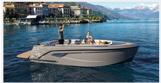
AS 18 - SIDE VIEW 01