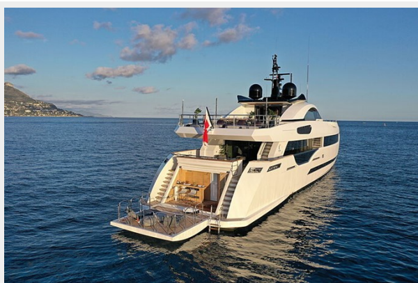
Stern View Beach Club