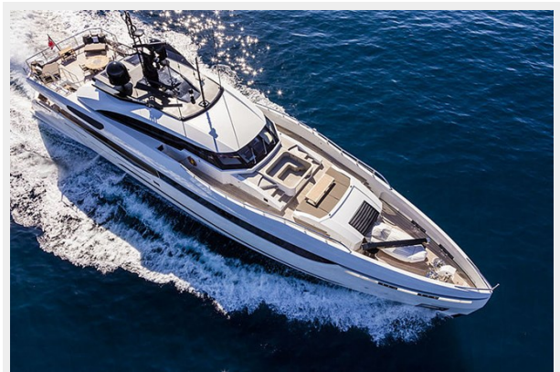
Aerial Shot Running