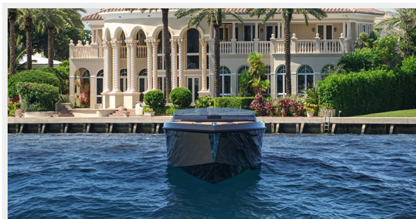
AS 18 - BOW LOWER VIEW