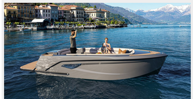
AS 18 - SIDE VIEW 01