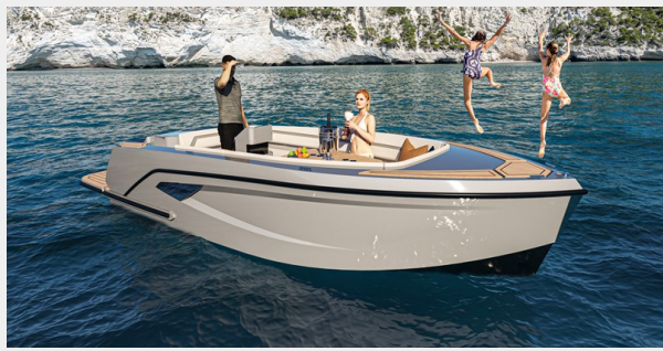
AS 18 - HALF SIDE BOW VIEW