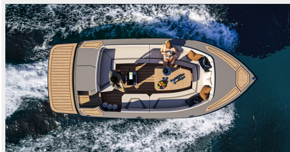
AS 18 - BIRD VIEW - TABLE