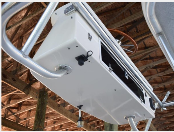
Tower control box