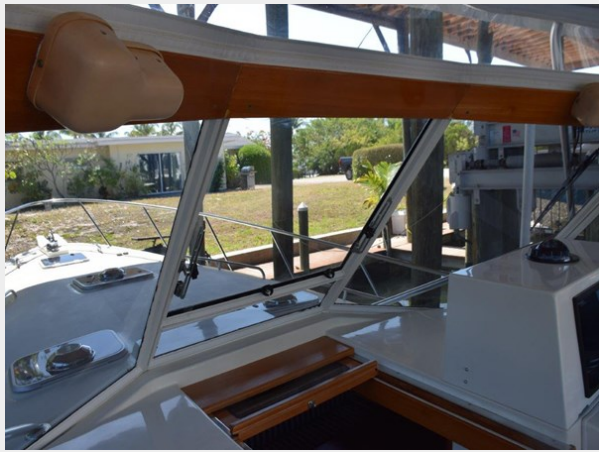
Wood trimmed windshield