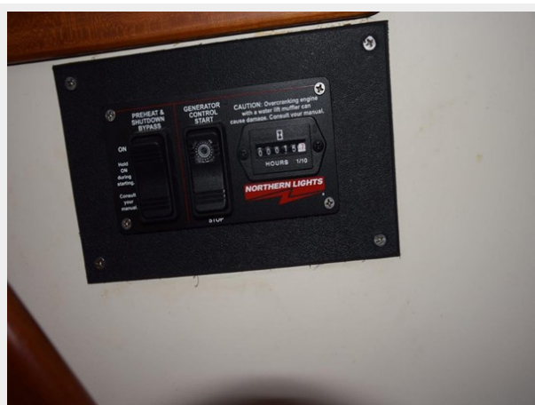
Near new Northern Lights generator