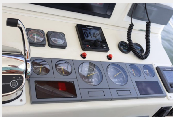
Gauges at WOT