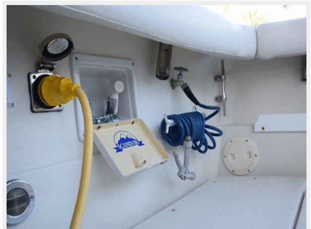
Freshwater shower, washdown hose, shore power inlet, under gunwale