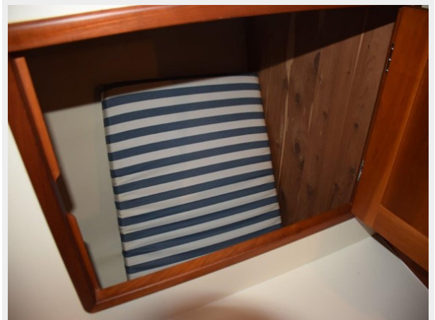
Closet with cedar wall