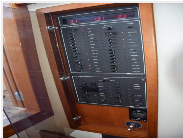
Main electrical panel