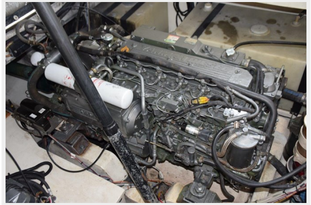
Portside 420hp Yanmar