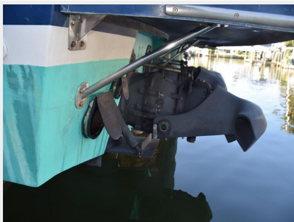
Hamilton WaterJet drive, port