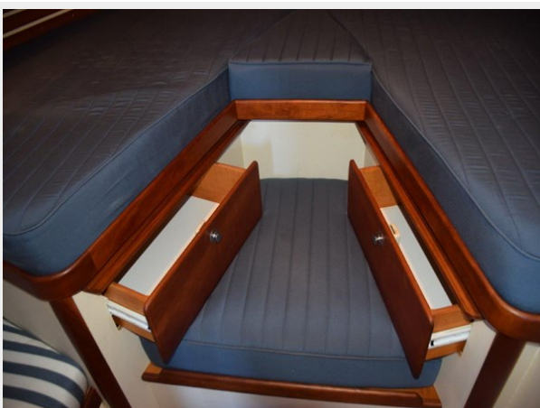
Drawers below the V-berth