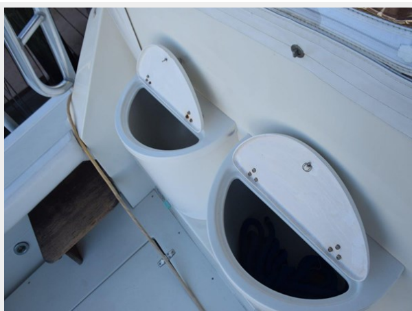
With open covers in cockpit