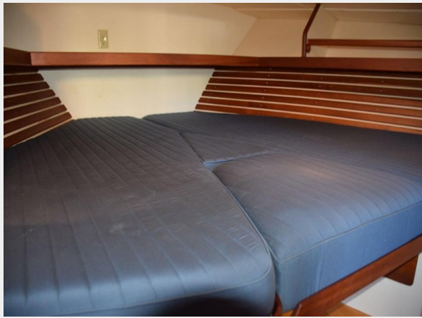
Beautiful wood hull lining