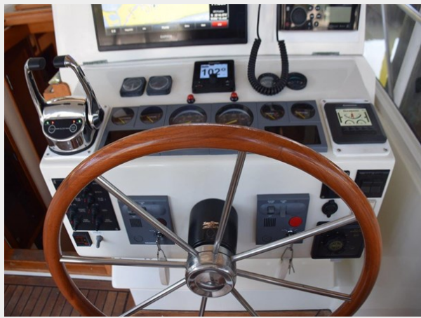
Classic wood rim helm wheel