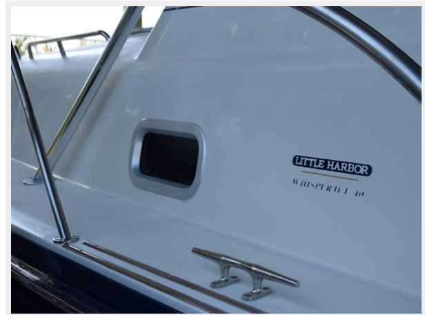
Bow rail back to deckhouse railing