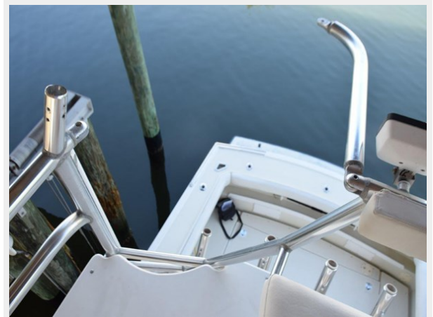
Walk-through tower entry