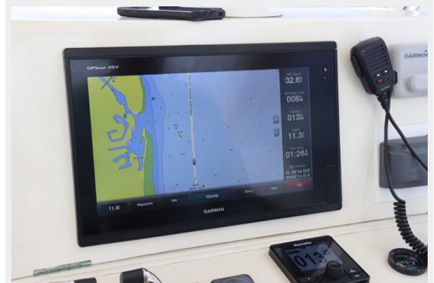
GPS at WOT