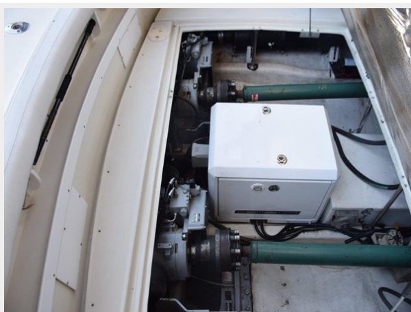
Under cockpit deck, shafts to WaterJets