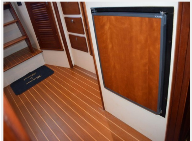
Stylish yacht decor