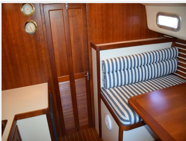
Stateroom door closed