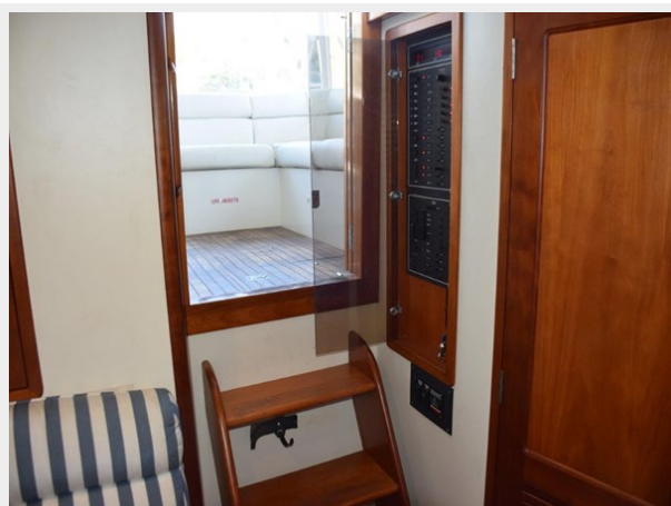
Door to head and cabin entryway