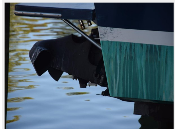
WaterJet drive, starboard