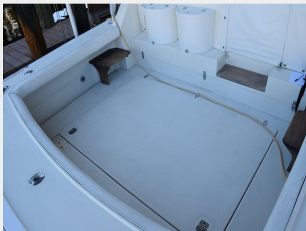
Cockpit with padded coaming, non-skid finish