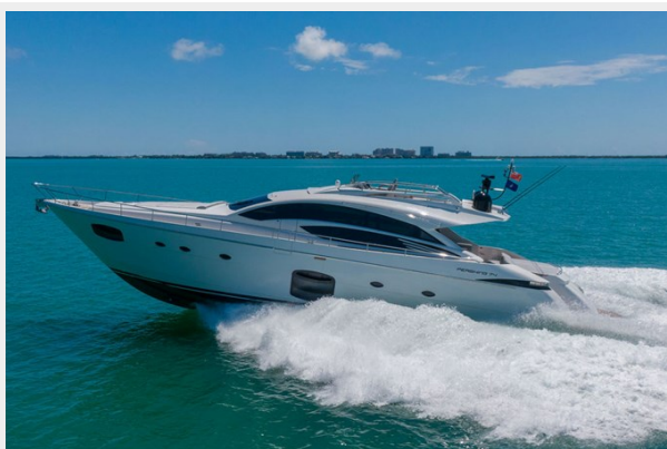
74 Pershing 2018 Exterior Running 5