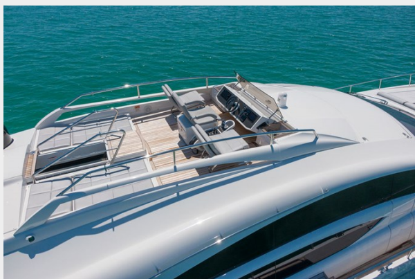
74 Pershing 2018 Exterior Upper Deck