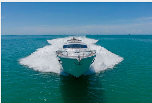
74 Pershing 2018 Exterior Running 3