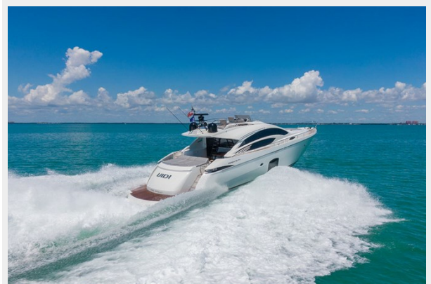
74 Pershing 2018 Exterior Running 4