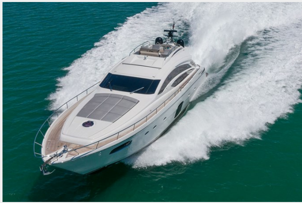
74 Pershing 2018 Exterior Running 7