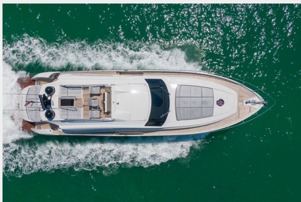
74 Pershing 2018 Exterior Overhead