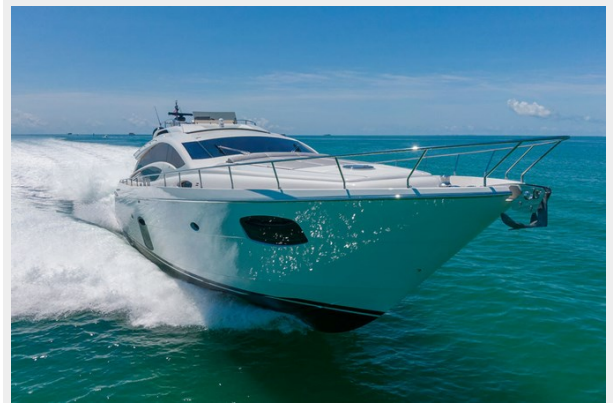
74 Pershing 2018 Exterior Running 2