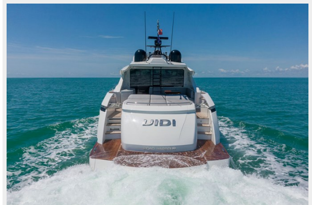
74 Pershing 2018 Exterior Stern