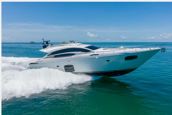
74 Pershing 2018 Exterior Running