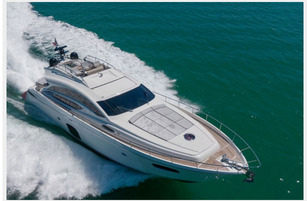
74 Pershing 2018 Exterior Running 8