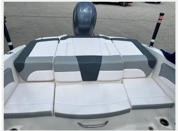
10-STERN BENCH SEAT