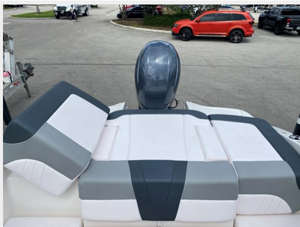
11-STERN SUN PAD