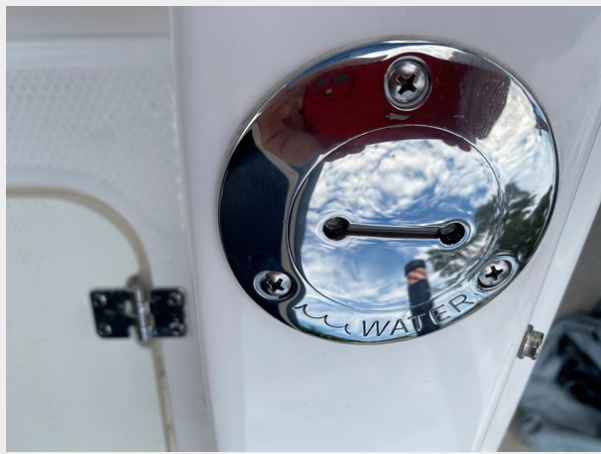
16-WATER TANK FILL