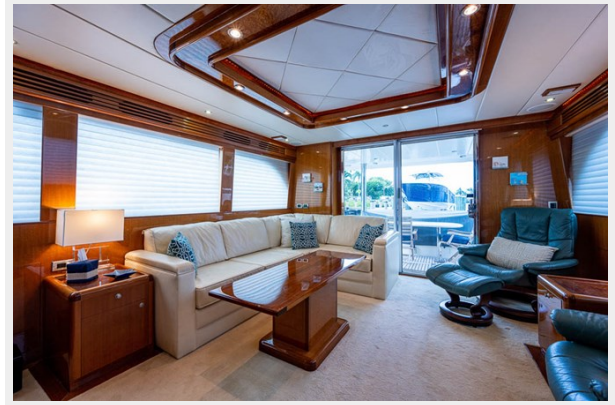
_salon_2 - Copy