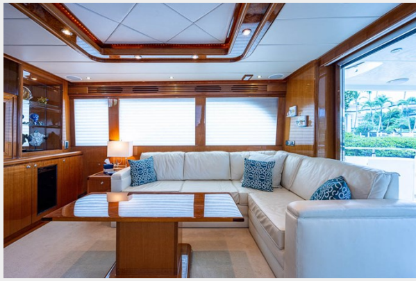
_salon_8 - Copy