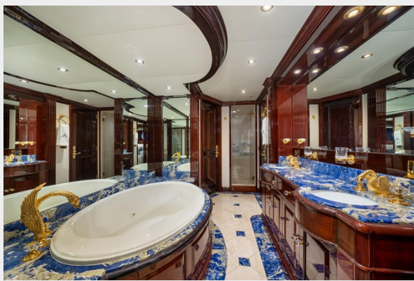
IONIAN PRINCESS 150'/45.73m Christensen 2005/2022 - Guest Ensuite