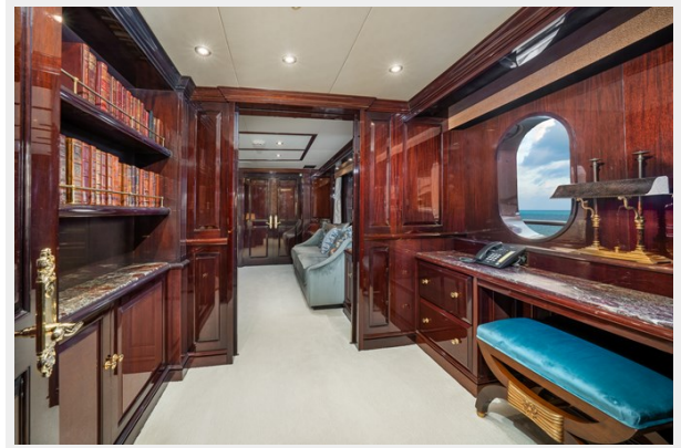
IONIAN PRINCESS 150'/45.73m Christensen 2005/2022 - Master Stateroom IONIAN PRINCESS 150'/45.73m Christensen 2005/2022 - Master Ensuite