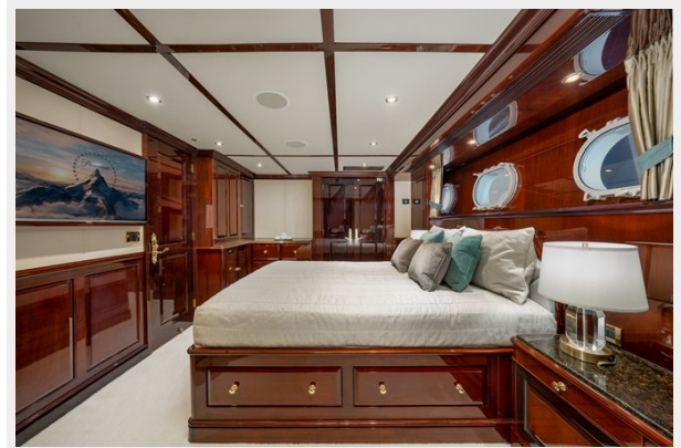
IONIAN PRINCESS 150'/45.73m Christensen 2005/2022 - Guest Stateroom 2