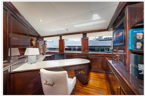
IONIAN PRINCESS 150'/45.73m Christensen 2005/2022 - Wheelhouse IONIAN PRINCESS 150'/45.73m Christensen 2005/2022 - Wheelhouse