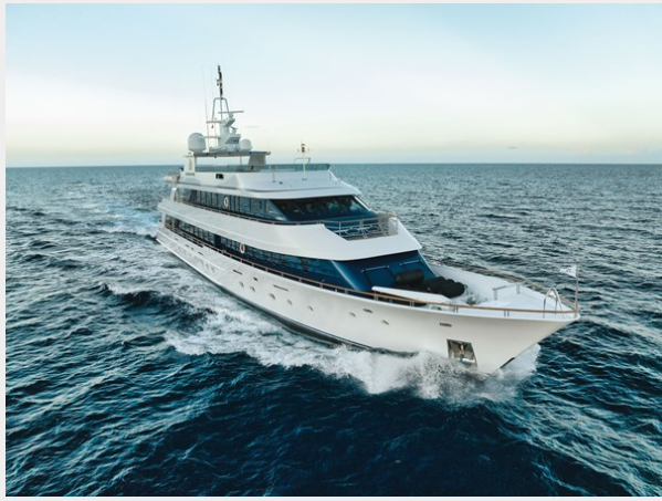
IONIAN PRINCESS 150'/45.73m Christensen 2005/2022