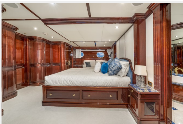
IONIAN PRINCESS 150'/45.73m Christensen 2005/2022 - Guest Stateroom 3