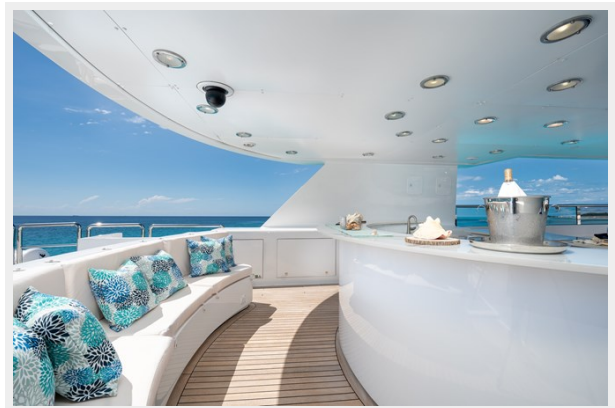
IONIAN PRINCESS 150'/45.73m Christensen IONIAN PRINCESS 150'/45.73m Christensen 2005/2022 - Bridge Aft Dining 2005/2022 - Skylounge Bar