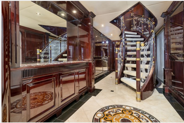
IONIAN PRINCESS 150'/45.73m Christensen 2005/2022 - Staircase to Guest Staterooms/Foyer