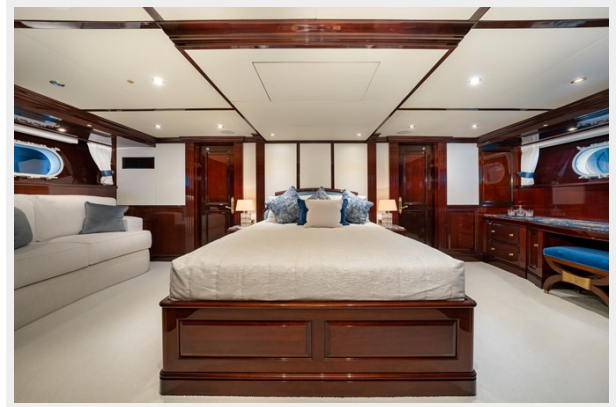
IONIAN PRINCESS 150'/45.73m Christensen 2005/2022 - Guest Stateroom 1