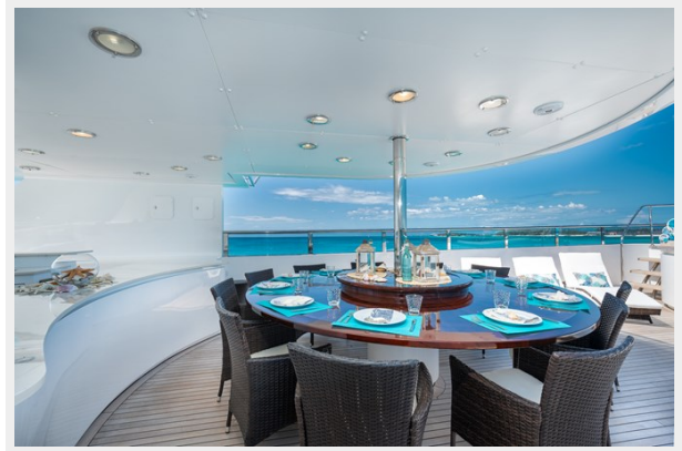
IONIAN PRINCESS 150'/45.73m Christensen IONIAN PRINCESS 150'/45.73m Christensen 2005/2022 - Sun Deck Bar Area 2005/2022 - Sun Deck Bar Area