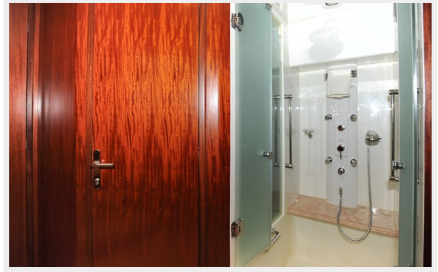
Owner's Stateroom Head