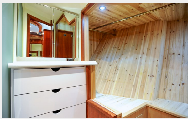
Owner's Stateroom Closet