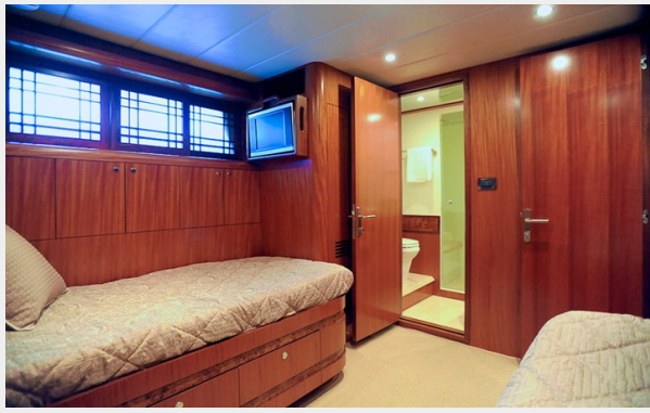
Guest Twin Stateroom