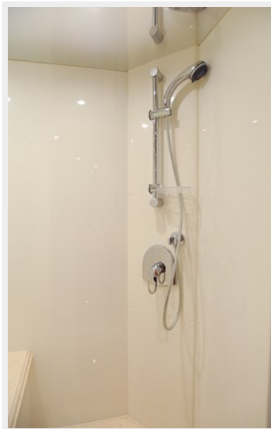
Guest Stateroom Shower