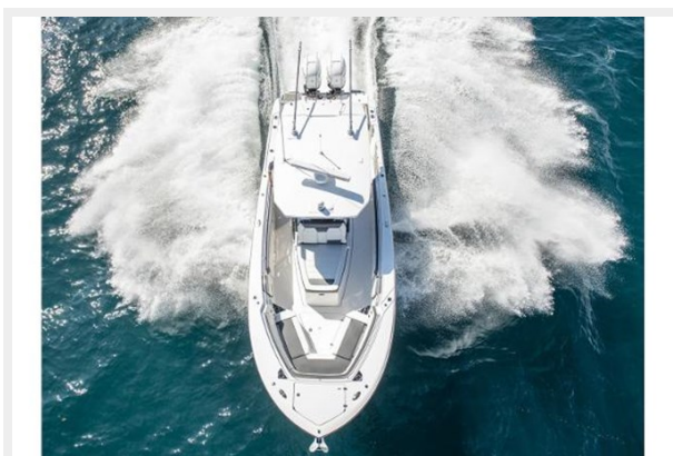
4_2019 33ft Blackfin 332 CC FLOSS'D AT SEA