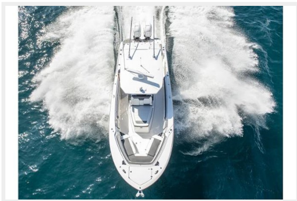
4_2019 33ft Blackfin 332 CC FLOSS'D AT SEA