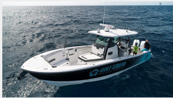
2_2019 33ft Blackfin 332 CC FLOSS'D AT SEA