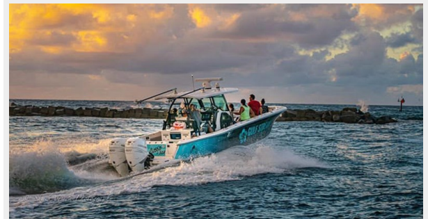
3_2019 33ft Blackfin 332 CC FLOSS'D AT SEA