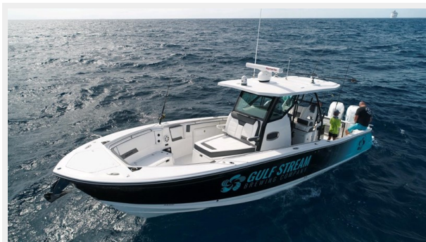
2_2019 33ft Blackfin 332 CC FLOSS'D AT SEA