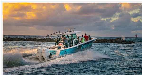
3_2019 33ft Blackfin 332 CC FLOSS'D AT SEA