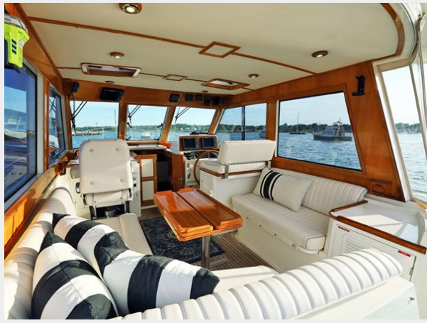
Bridge Deck Settees