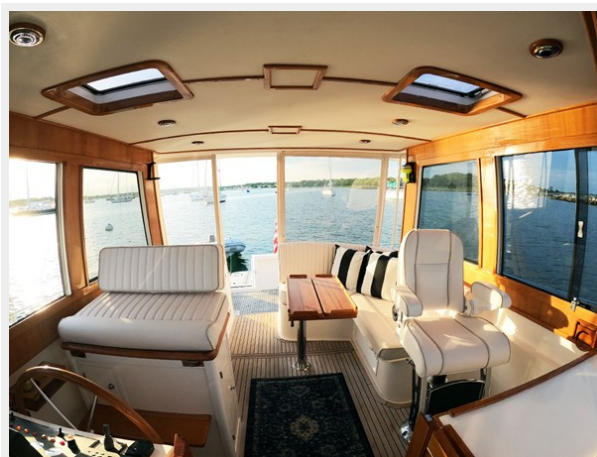
Companionway, Looking Aft