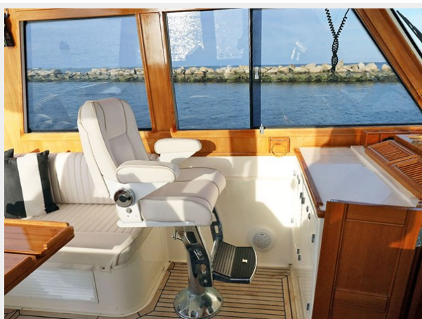
Companion Stbd Pedestal Chair