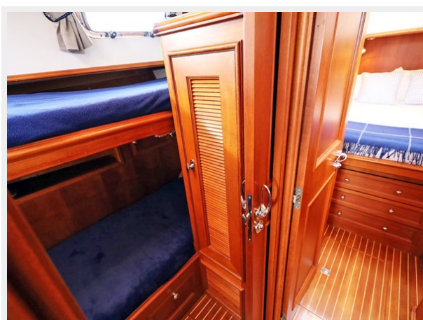
Guest and Owner's Cabins