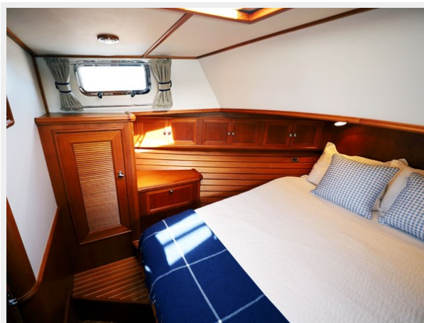
Owner's Cabin to Port