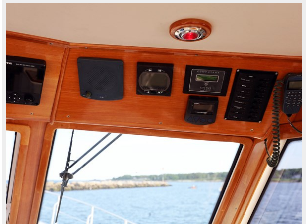
Helm Instruments, Mounted Above