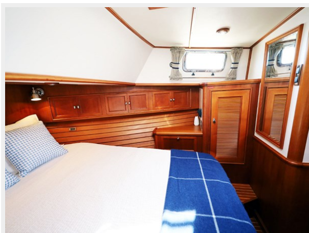
Owner's Cabin to Stbd