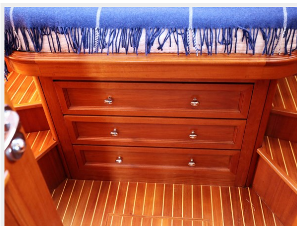
Drawer Storage, Owner's Berth