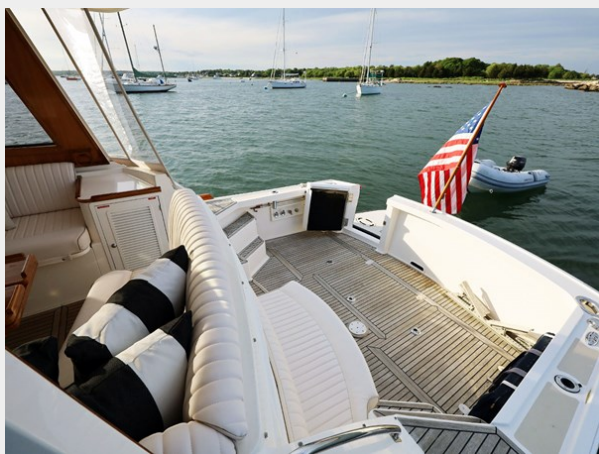
Cockpit from Port Side Deck