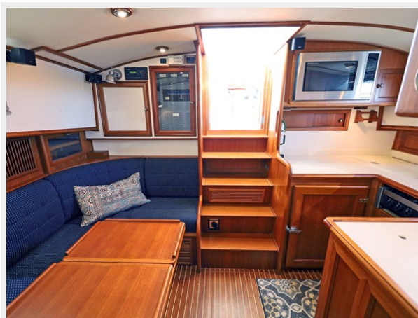
Salon, Looking Aft