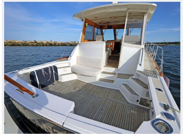
Cockpit, Looking Fwd