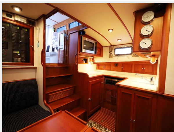
Galley, Port Aft