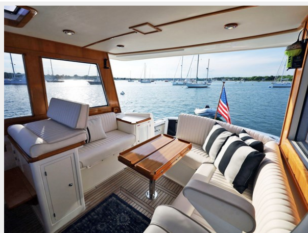
Bridge Deck, Curtains Removed