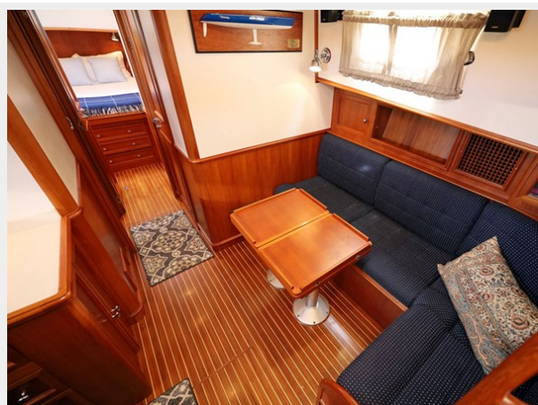
Lower Salon from Above