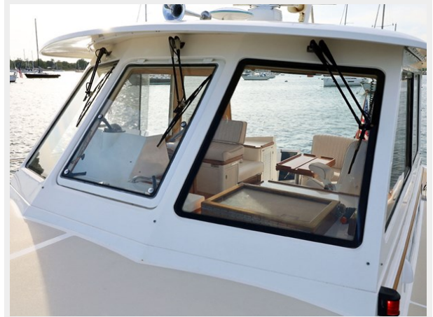
Center-Opening Windshield Panel