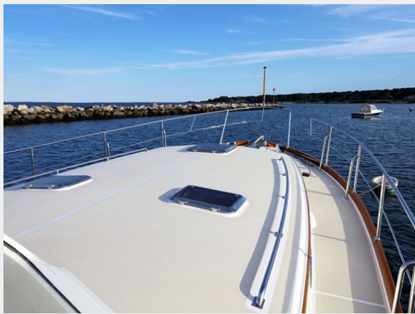
Cabin Trunk, Looking Fwd to Bow