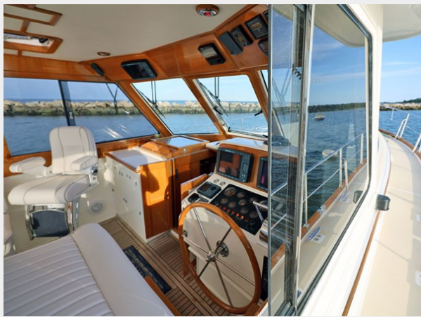
Bridge Deck Looking In from Helm Window