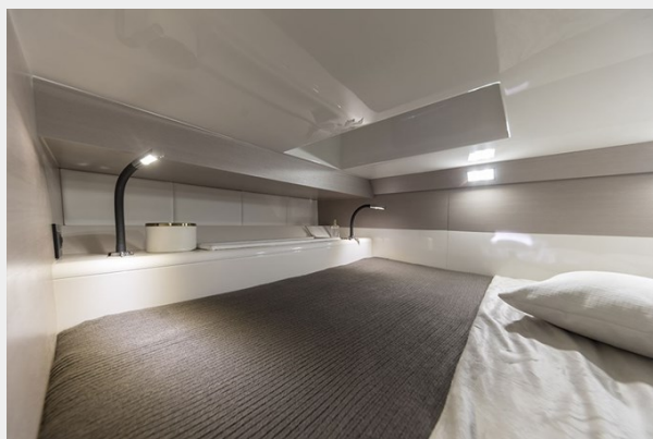
WhatsApp Image 2022-06-09 at 18.45.32 (1)