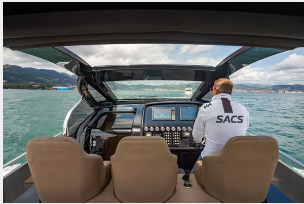
WhatsApp Image 2022-06-09 at 18.45.31 (1)