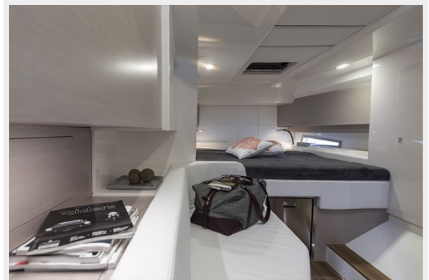
WhatsApp Image 2022-06-09 at 18.45.31 (5)