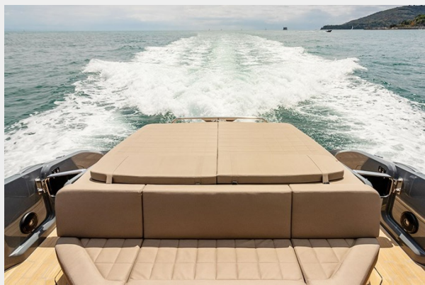
WhatsApp Image 2022-06-09 at 18.45.31 (4)