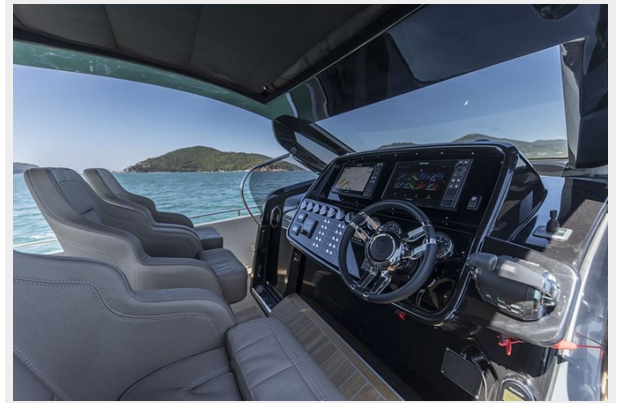
WhatsApp Image 2022-06-09 at 18.45.31 (2)