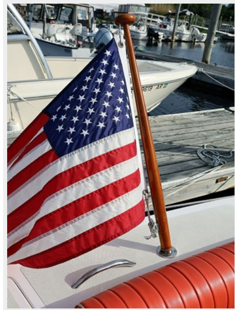
Ensign Staff Detail