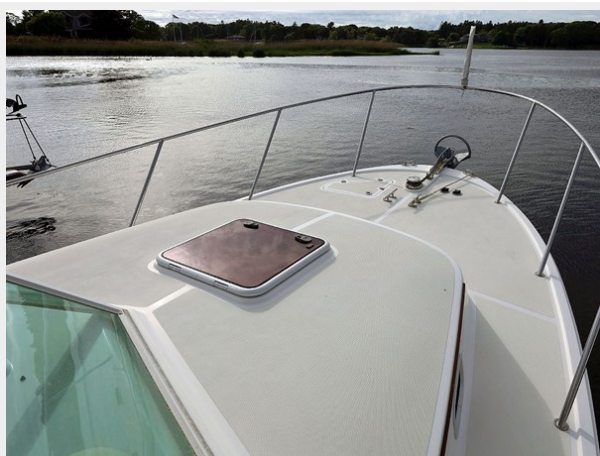
Cabin Trunk and Foredeck