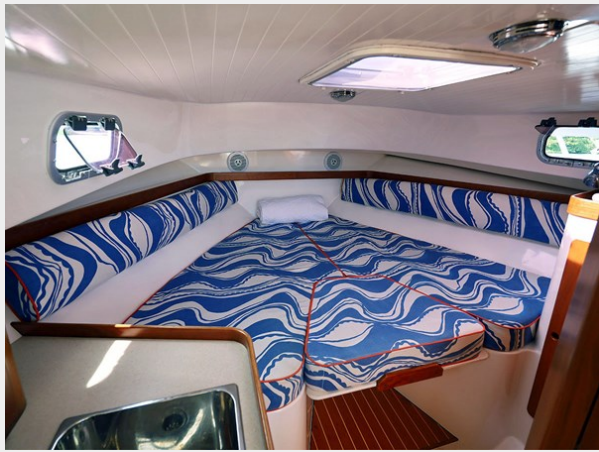
V-Berth with Filler, Looking Forward