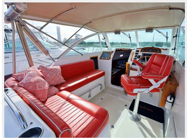
L-Settee from Starboard