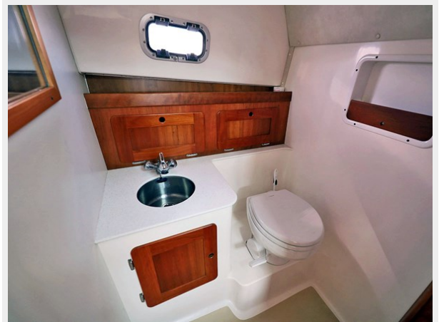
Head and Ensuite Shower