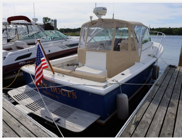
Stern at Dock