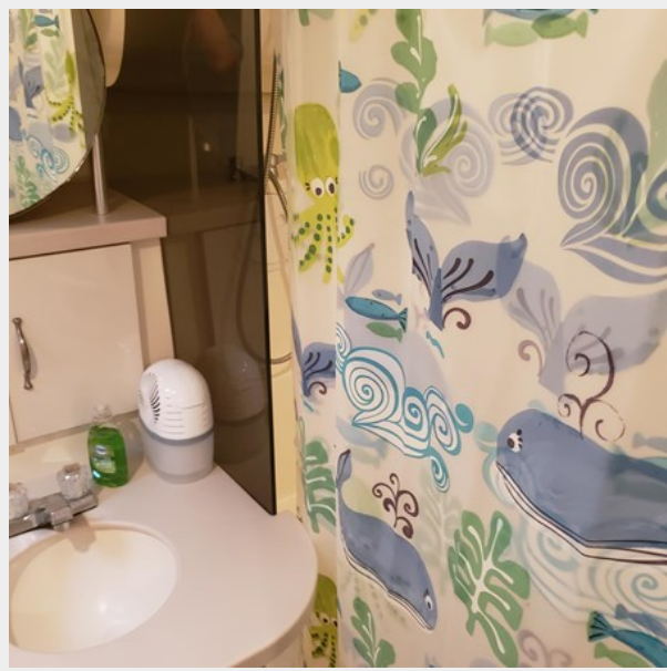
17) Head 2