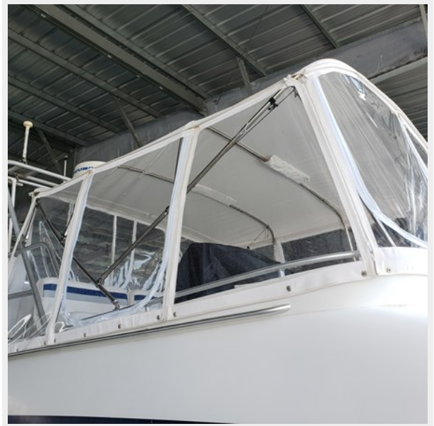
2a) New Bimini