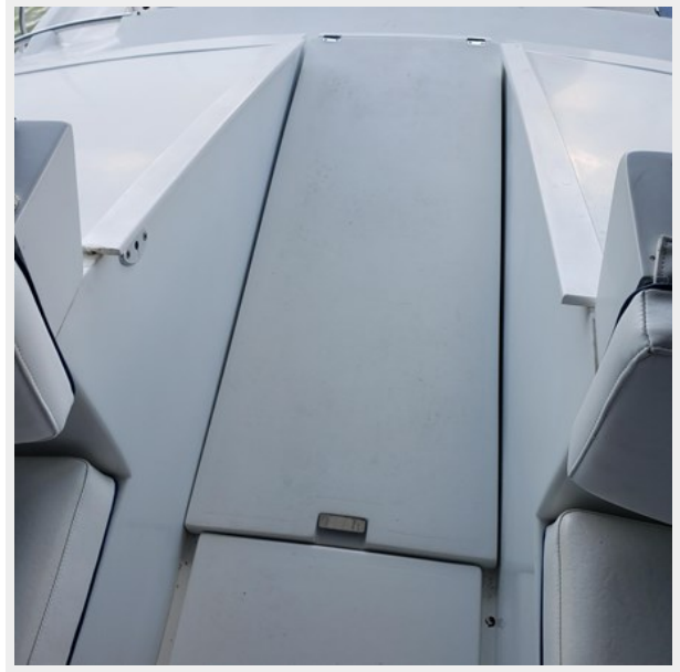
24) Flybridge Coaming Door 2