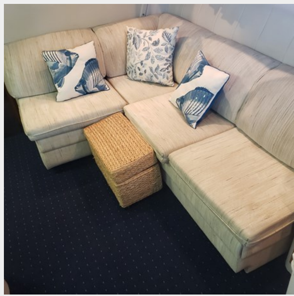
8) Stb Settee