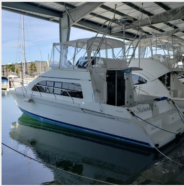
1) New Main