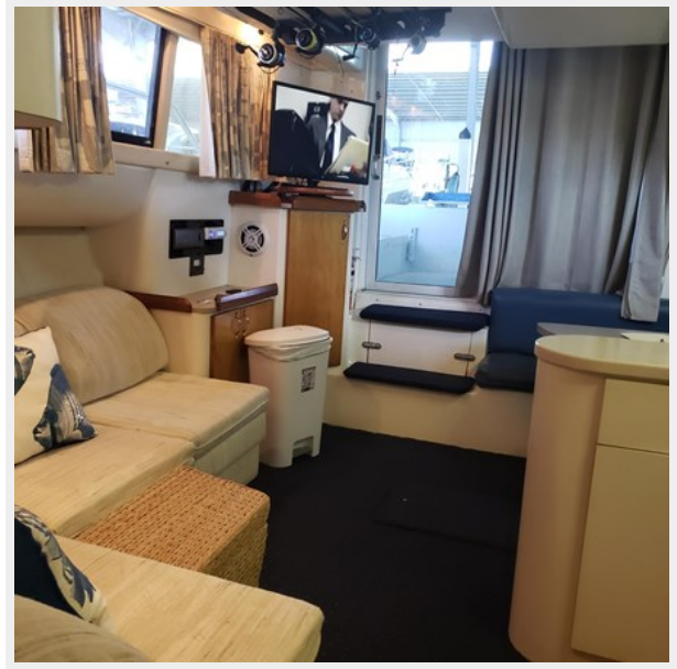
7) Stb Salon