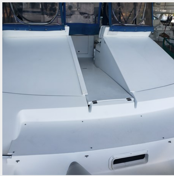
25) Flybridge Coaming Door