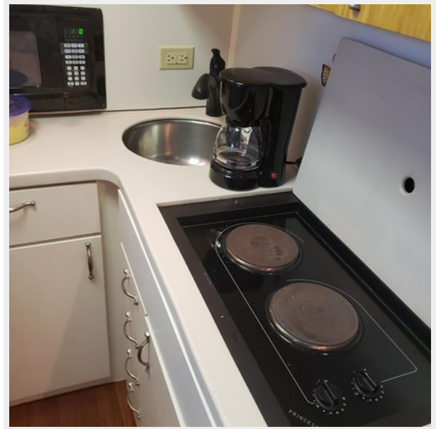
11) Kenyon Cooktop