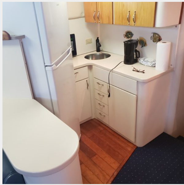
10) Port Galley