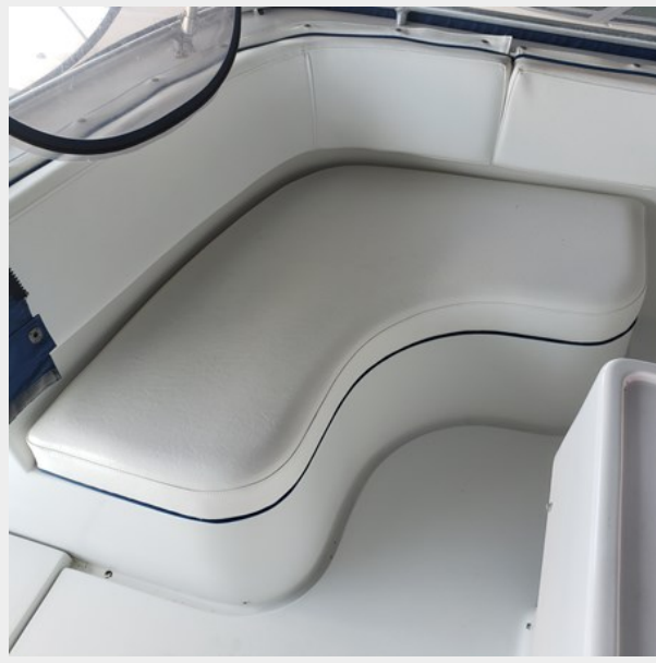
23) Stb Flybridge Seating