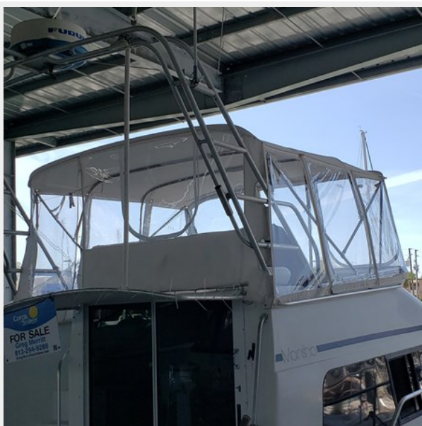
2b new bimini