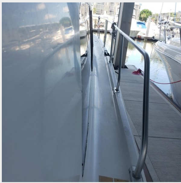
4) Stb Sidedecks