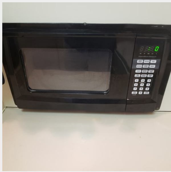
13) Panasonic Microwave