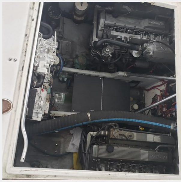
6) Yanmar 260hp 6LP-DTE