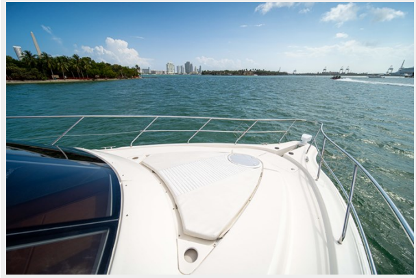
Don't Worry Be Happy-30