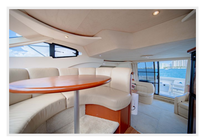
Don't Worry Be Happy-39