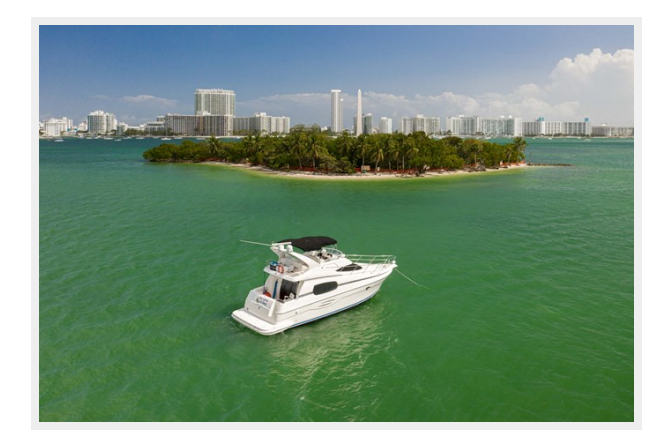
Don't Worry Be Happy-8