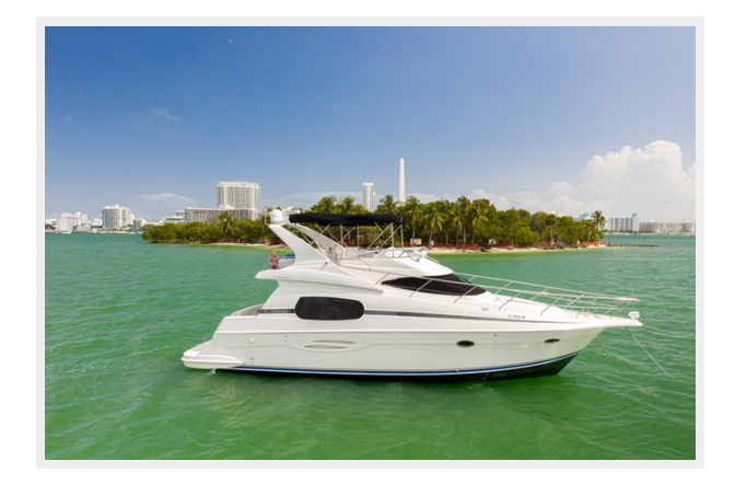
Don't Worry Be Happy-10