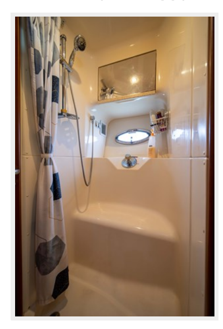
Don't Worry Be Happy-20