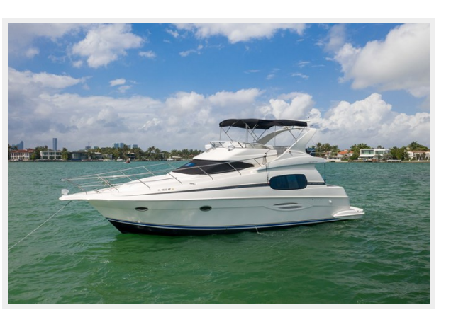
Don't Worry Be Happy-5