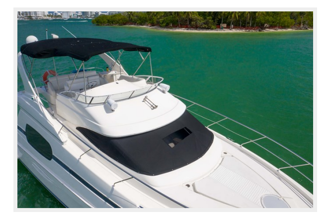
Don't Worry Be Happy-11