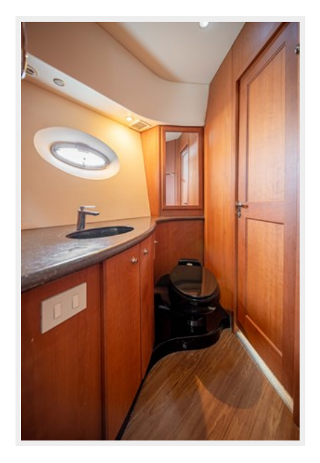
Don't Worry Be Happy-21