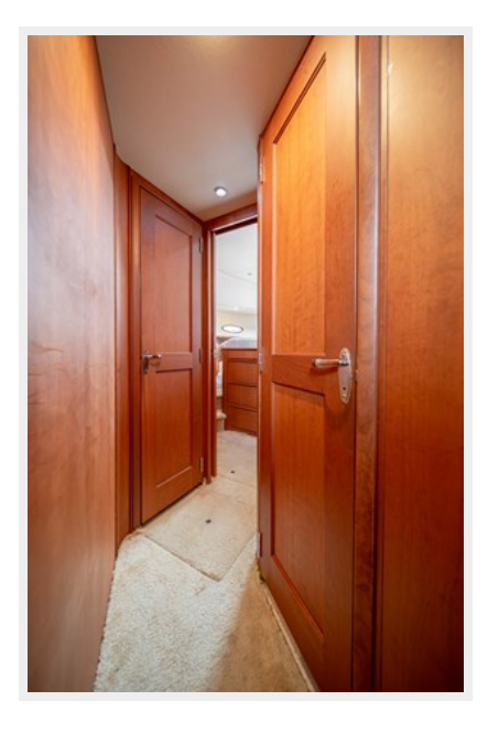
Don't Worry Be Happy-25