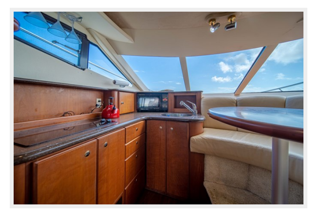
Don't Worry Be Happy-29