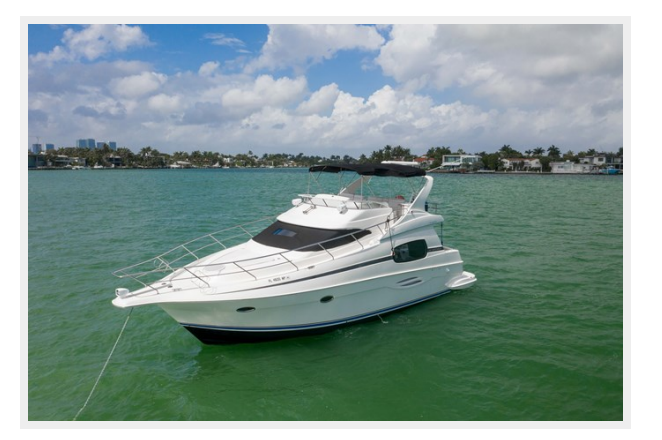
Don't Worry Be Happy-1