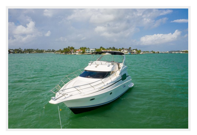
Don't Worry Be Happy-17