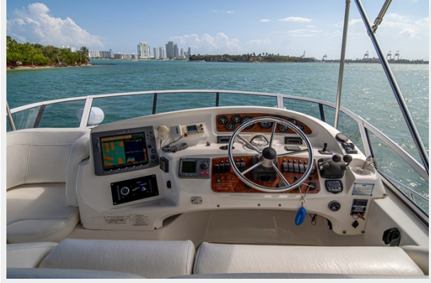
Don't Worry Be Happy-34