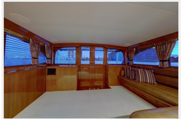
3 Salon Aft