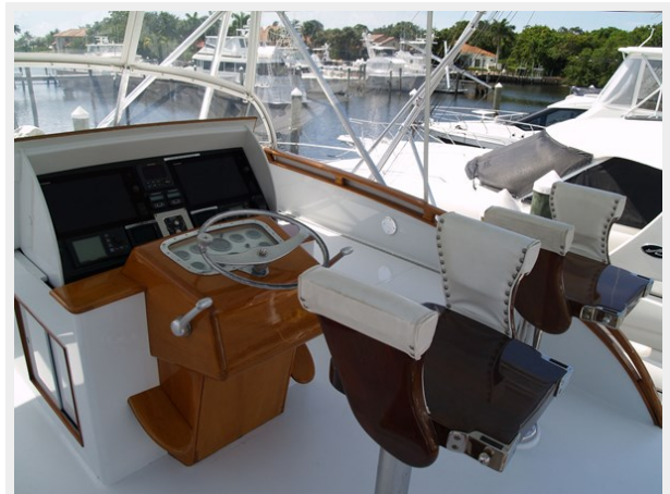
27 Bridge Seating