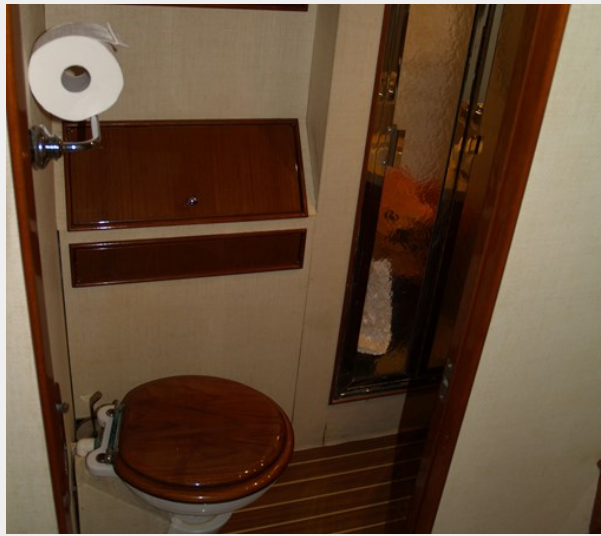
19 Guest Head