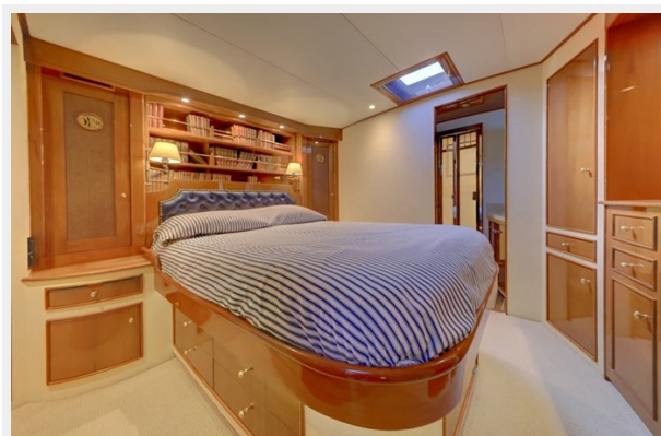
11 Master stateroom 2