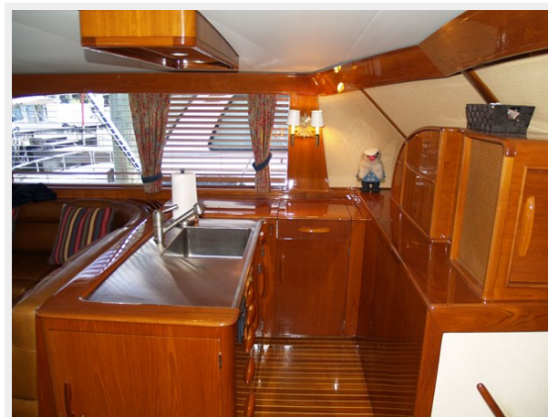
8 Port Side Galley