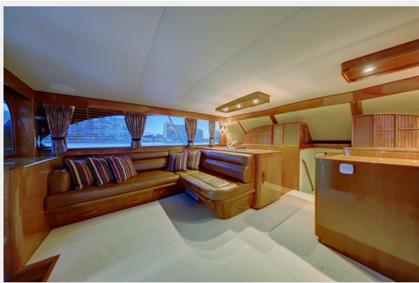
4a Salon Settee