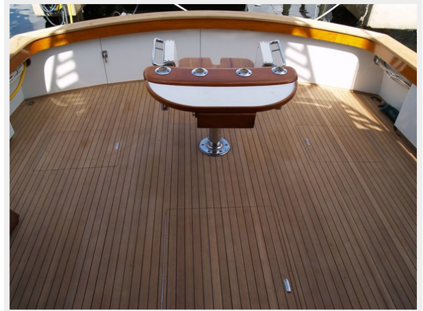
31 Cockpit Aft