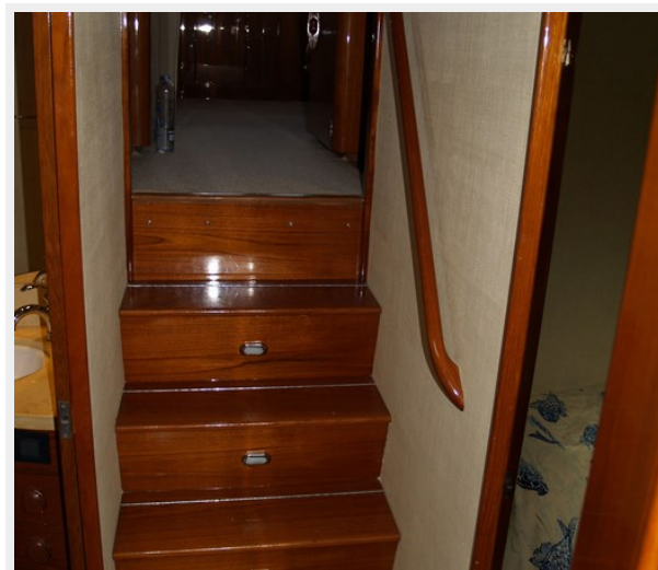
10 Companionway Steps