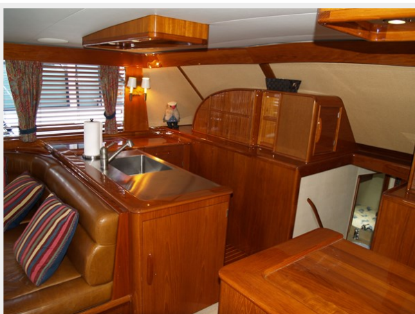
5 Galley Port