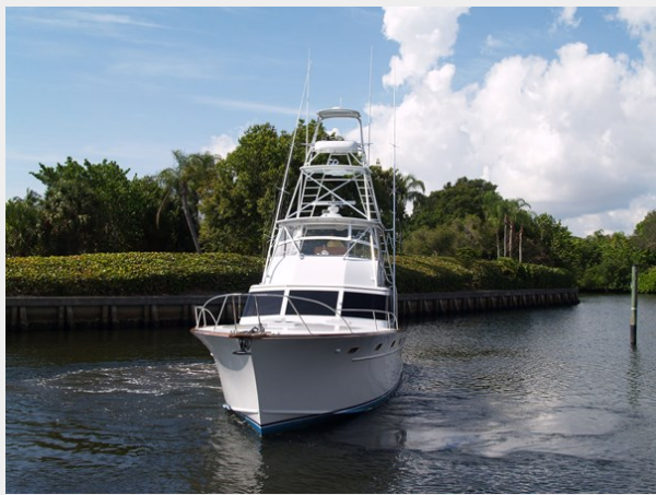
2 Bow View