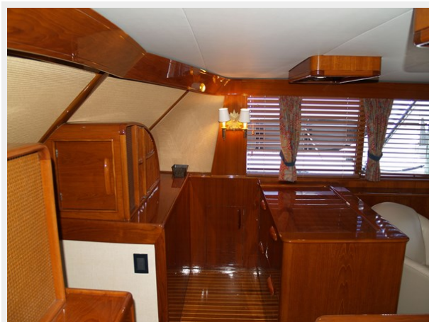
9 Starboard Side Galley