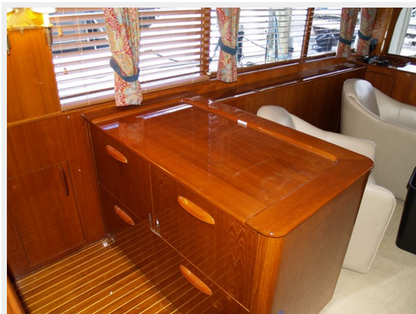
7 Galley Drawer Refrigeration