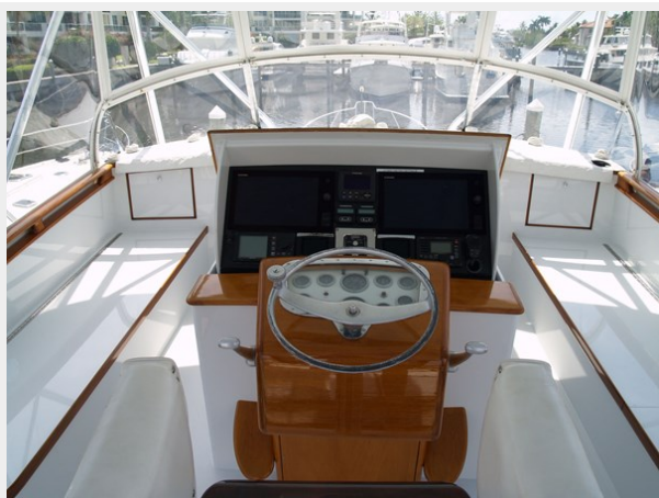
26 Bridge Helm