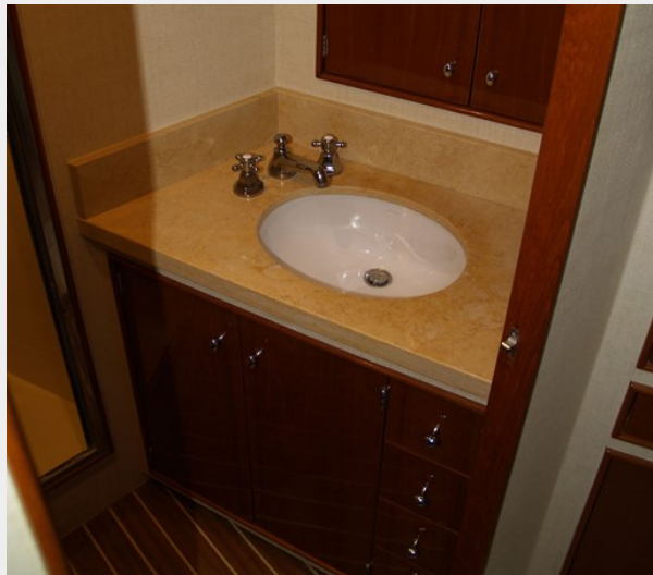
14 Master Head Sink