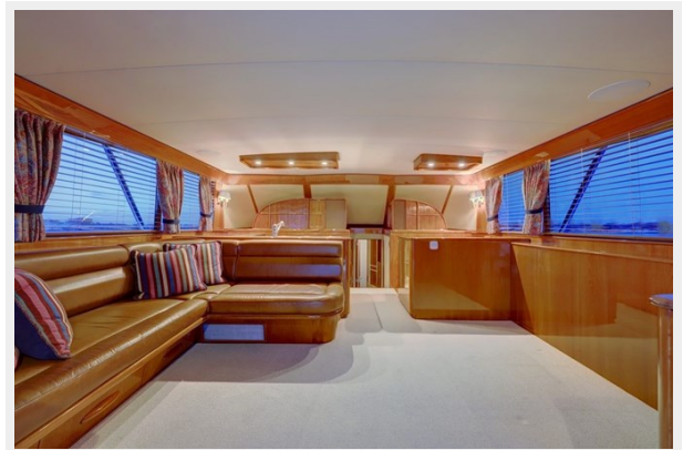
4b Salon Forward