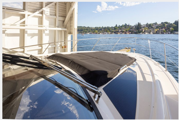
Island Time 23L