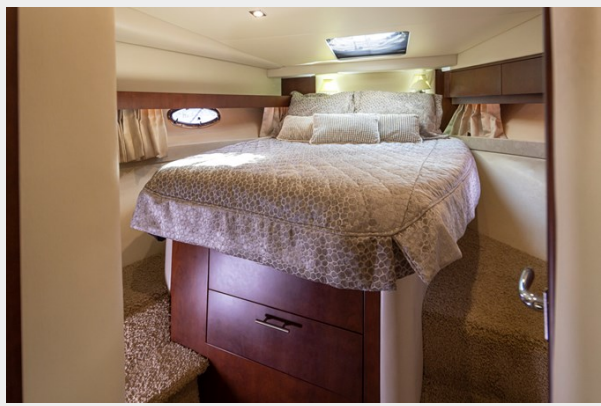
Island Time 04L