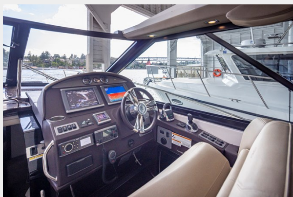
Island Time 18L