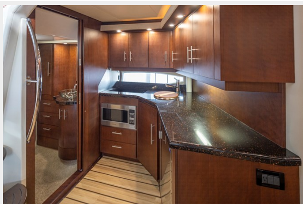
Island Time 11L