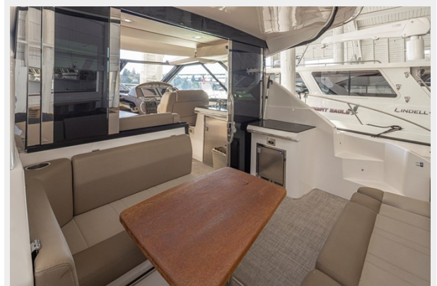
Island Time 34L