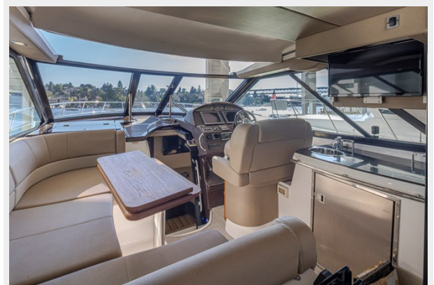
Island Time 25L