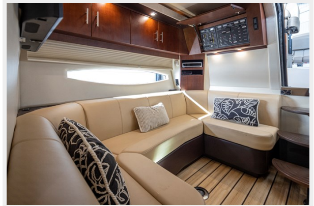
Island Time 16L