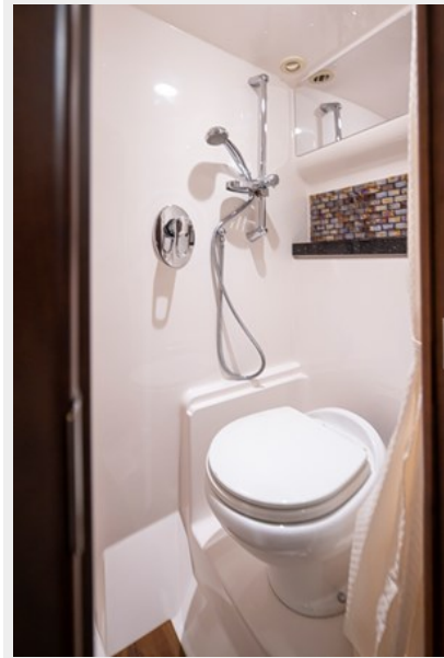
Island Time 03L