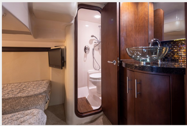
Island Time 01L