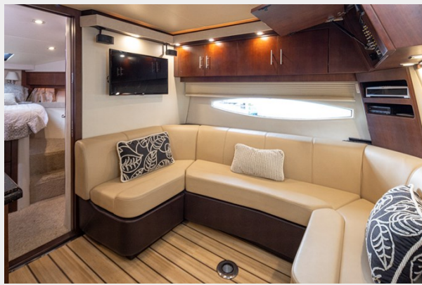
Island Time 15L