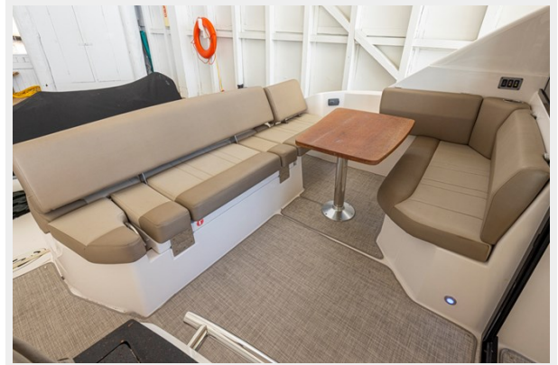
Island Time 35L