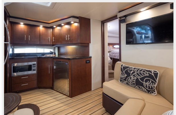
Island Time 10L