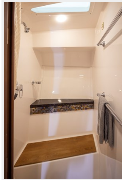
Island Time 07L