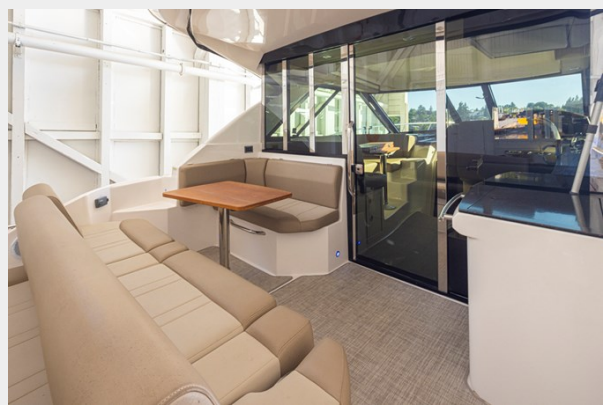
Island Time 39