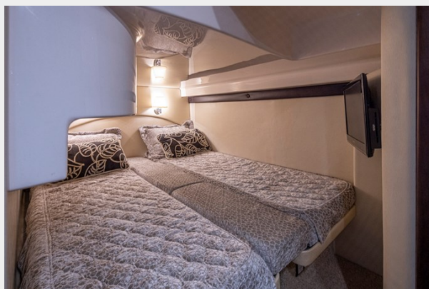
Island Time 02L