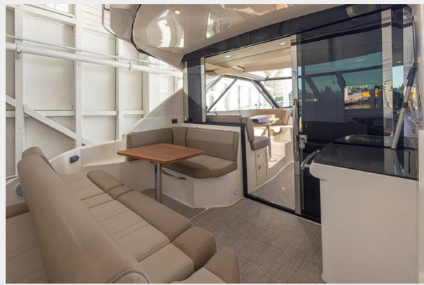
Island Time 33L