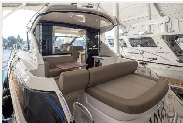
Island Time 36L