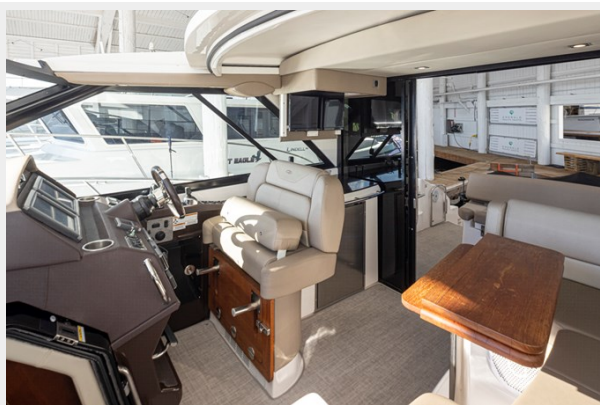
Island Time 27L