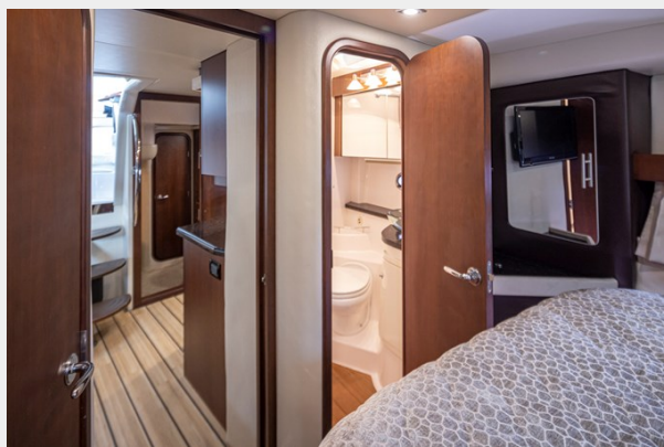
Island Time 08L