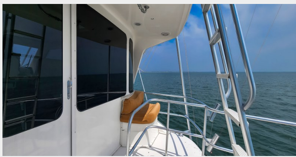
Flybridge Aft Deck