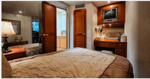
Walk Around Queen Size Bed