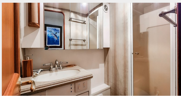
Guest Head and Shower