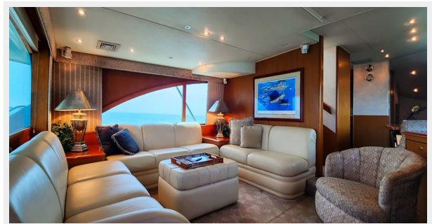
Spacious Main Salon