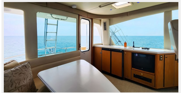
Flybridge TV and Wet Bar