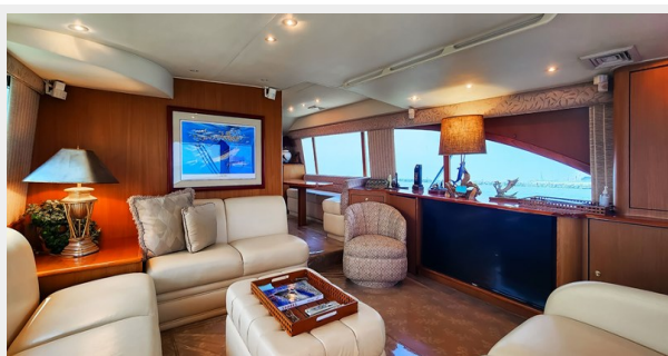
Main Salon and TV