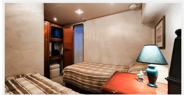
Two Lower Berths and Storage Cabinet in Between