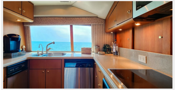
Teak Cabinetry with Corian Countertops