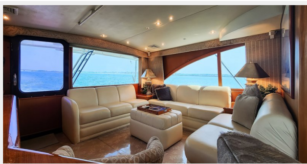
U-Shaped Salon Settee