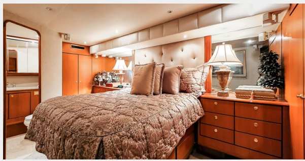
Full Beam with Walkaround King Size Bed Aft with 2 Hanging Closets