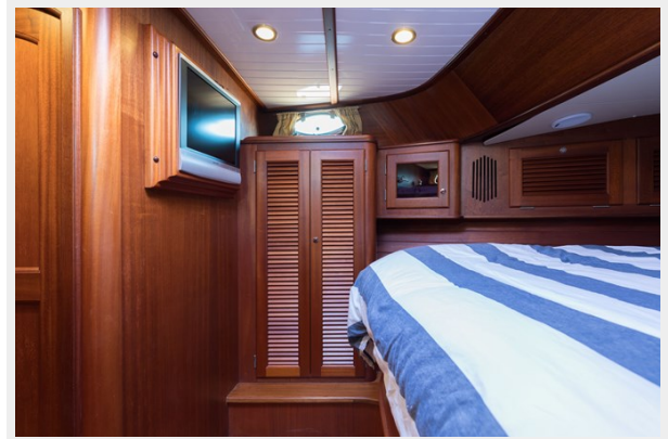
Owner Stateroom Head