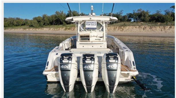
2020 38' BOSTON WHALER 380 OUTRAGE ENGINES