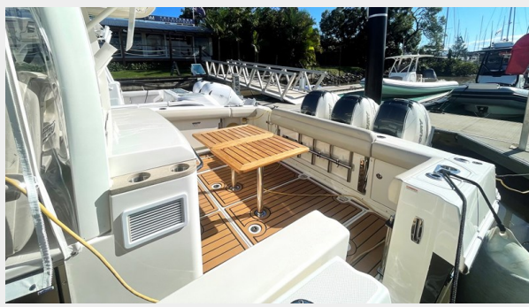
2020 38' BOSTON WHALER 380 OUTRAGE AFT 2