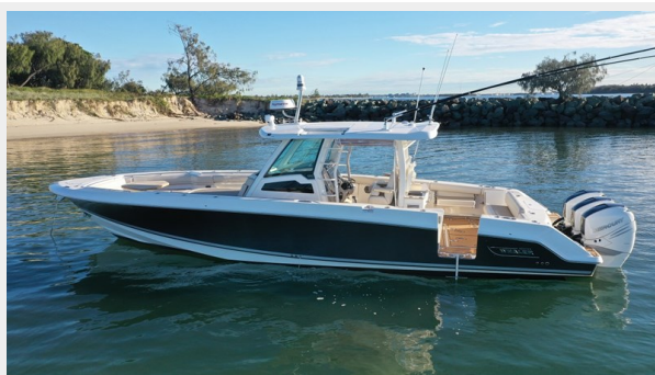
2020 38' BOSTON WHALER 380 OUTRAGE SIDE PROFILE