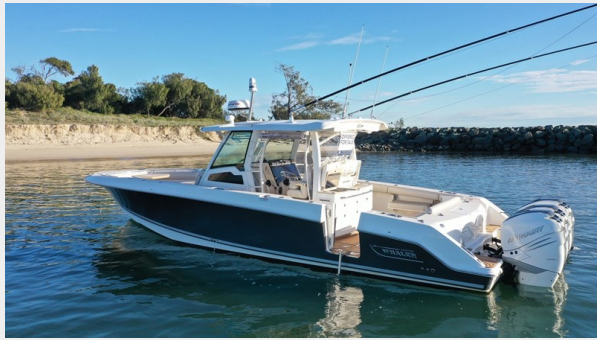
2020 38' BOSTON WHALER 380 OUTRAGE HERO