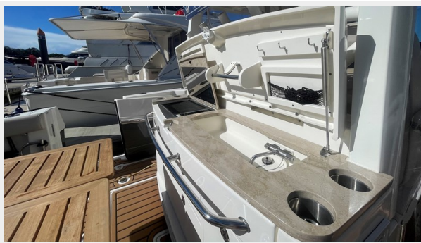
2020 38' BOSTON WHALER 380 OUTRAGE SUMMER KITCHEN