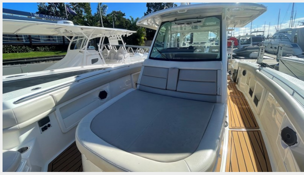
2020 38' BOSTON WHALER 380 OUTRAGE BOW 3