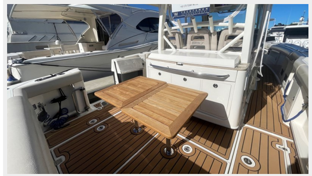
2020 38' BOSTON WHALER 380 OUTRAGE AFT 3