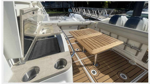
2020 38' BOSTON WHALER 380 OUTRAGE AFT