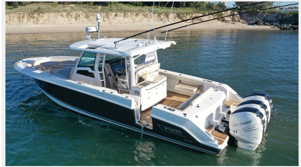
2020 38' BOSTON WHALER 380 OUTRAGE HERO 2