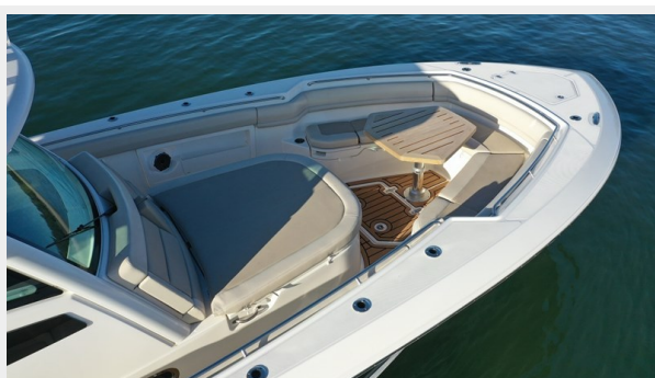
2020 38' BOSTON WHALER 380 OUTRAGE BOW