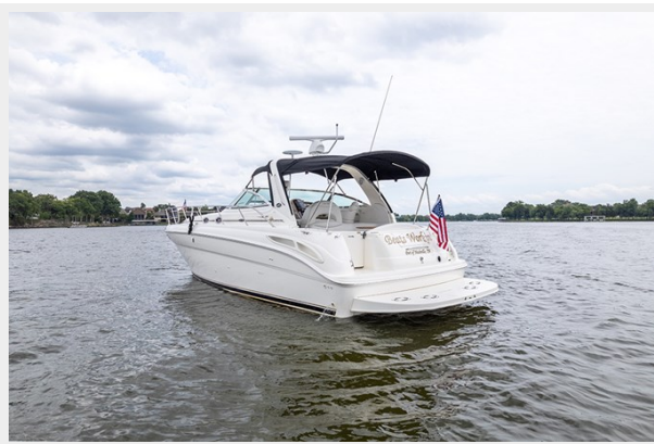
Port quarter profile