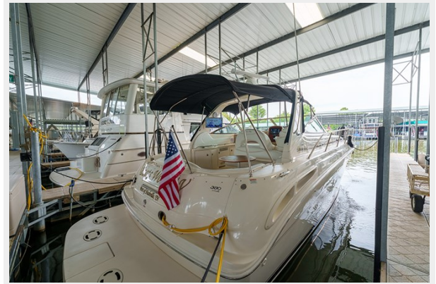
Stbd quarter profile (in slip)