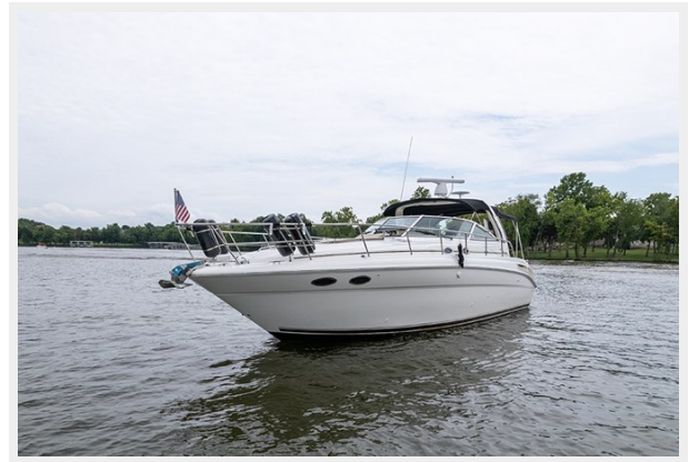
Port bow profile