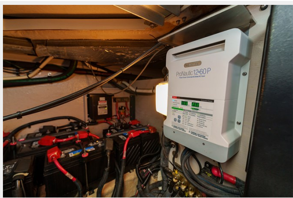
ProNautic 1260P charger