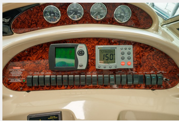
Helm electronics 2