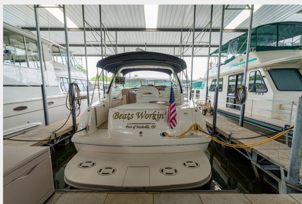
Stern profile (in slip)