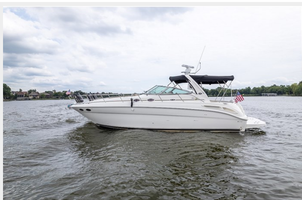
Port profile 2