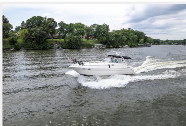
Port profile 5