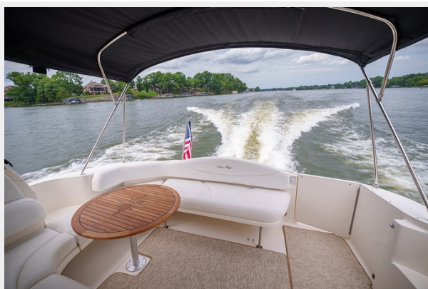
Cockpit view 2