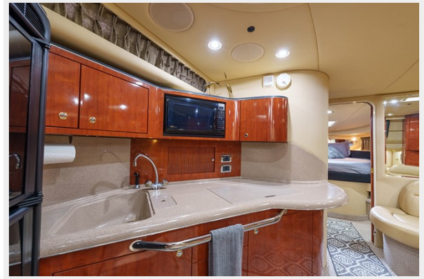
Galley view 2