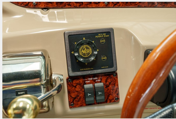
ACR/trim tabs control