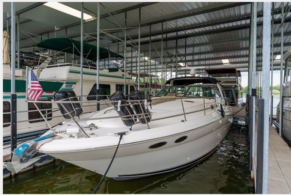
Port bow profile (in slip)