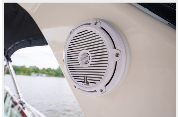
JL Audio speaker