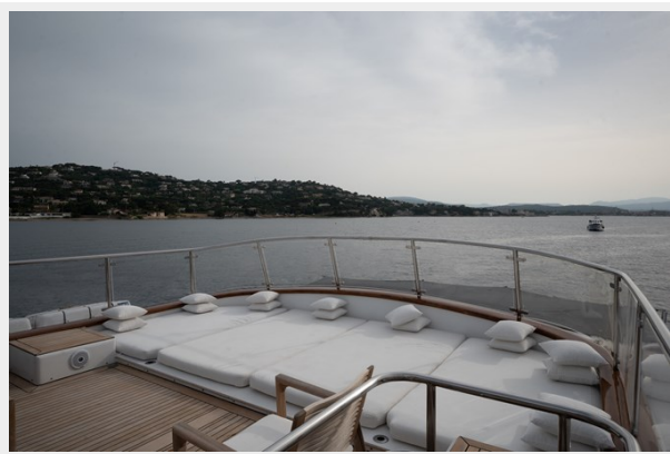
Shooting Yacht Amoha (168 sur 291)