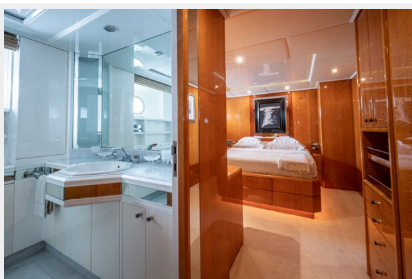
Shooting Yacht Amoha (30 sur 291)