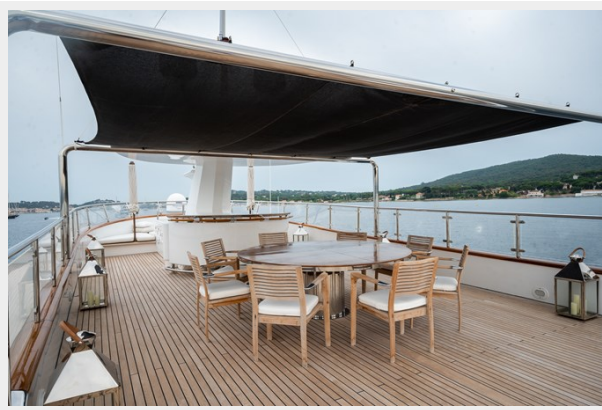
Shooting Yacht Amoha (158 sur 291)