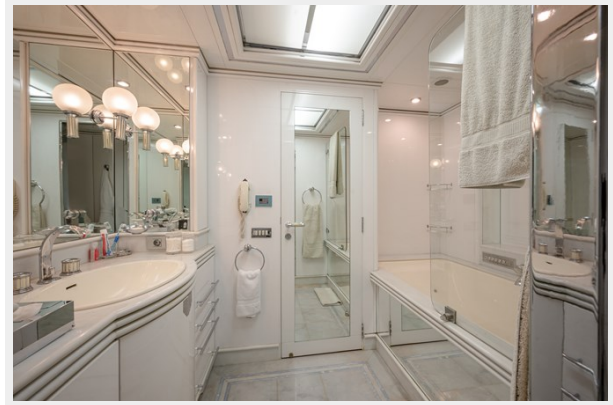
Amoha 2022 (5 sur 6)