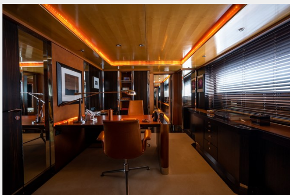
Shooting Yacht Amoha (45 sur 291)