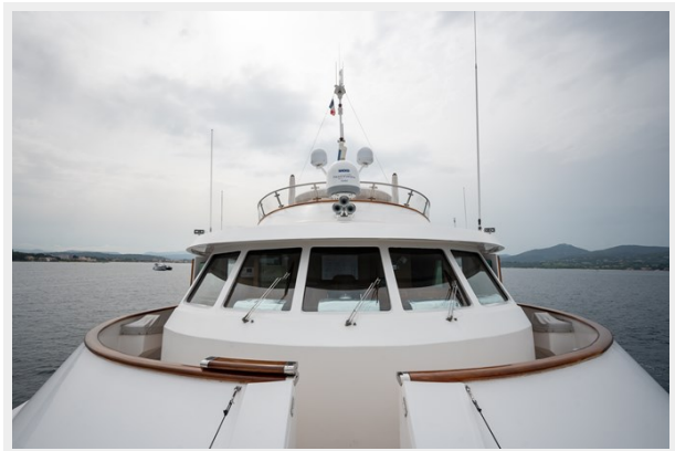
Shooting Yacht Amoha (176 sur 291)