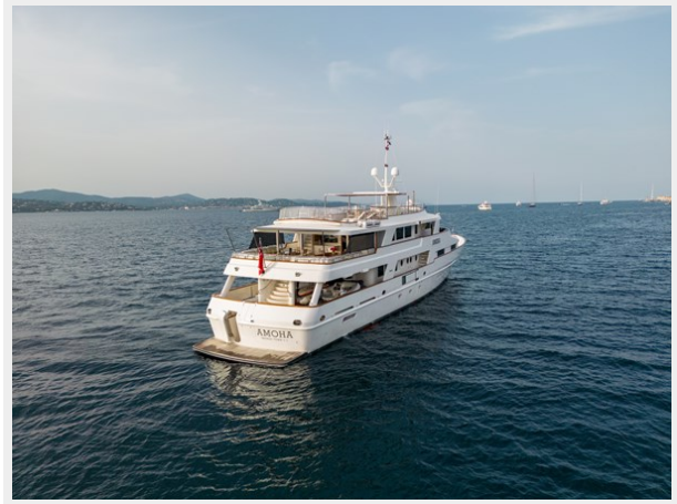
Shooting Yacht Amoha by Arsi Sebastien Photographe (243 sur 291)