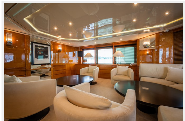
Shooting Yacht Amoha (82 sur 291)