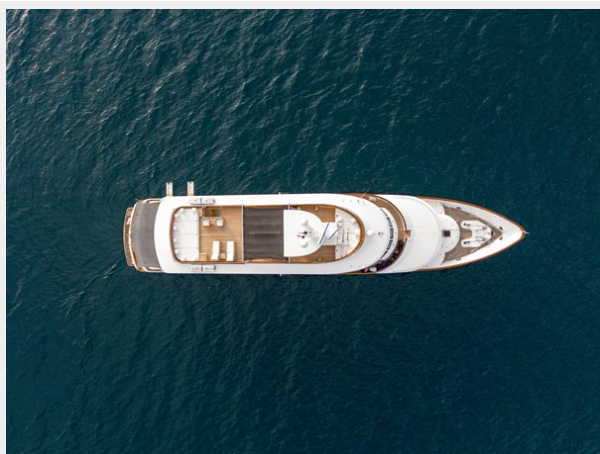
Shooting Yacht Amoha (246 sur 291)