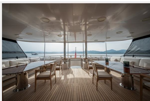
Shooting Yacht Amoha (210 sur 291)