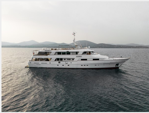
Shooting Yacht Amoha (242 sur 291)