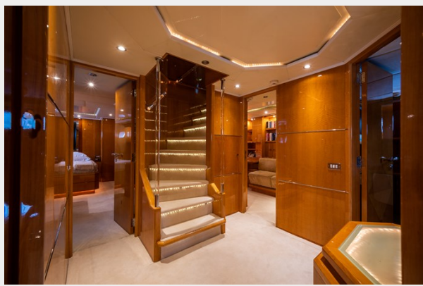
Shooting Yacht Amoha by Arsi Sebastien Photographe (3 sur 291)