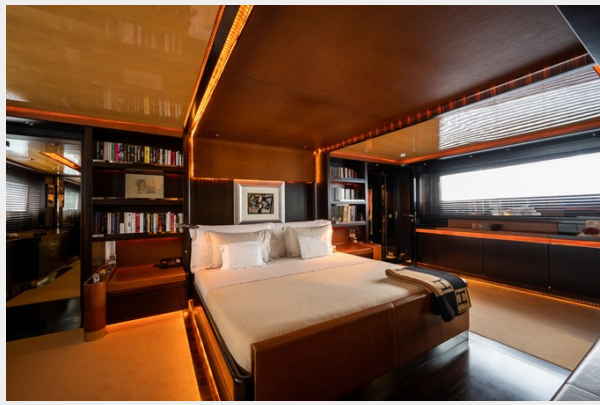
Shooting Yacht Amoha (70 sur 291)