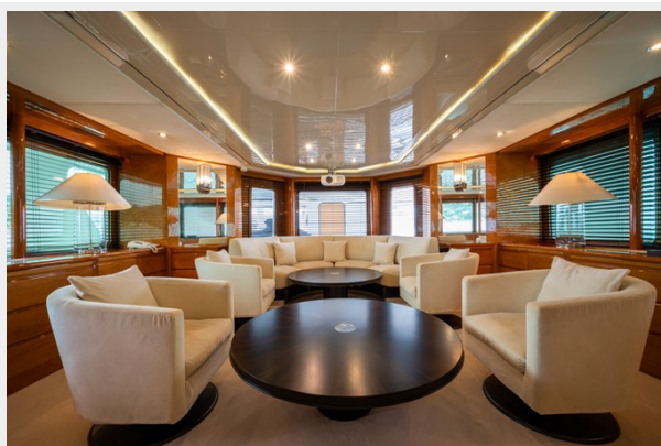
Shooting Yacht Amoha (81 sur 291)