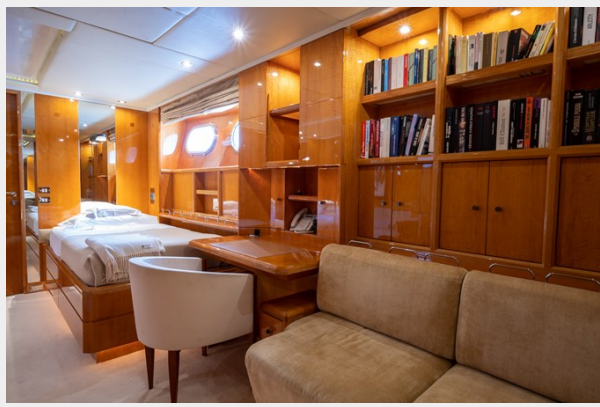
Shooting Yacht Amoha by Arsi Sebastien Photographe (18 sur 291)