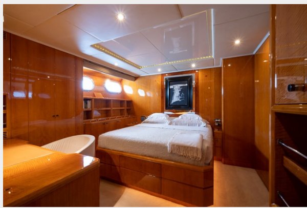
Shooting Yacht Amoha (32 sur 291)