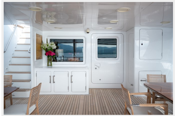
Shooting Yacht Amoha (216 sur 291)