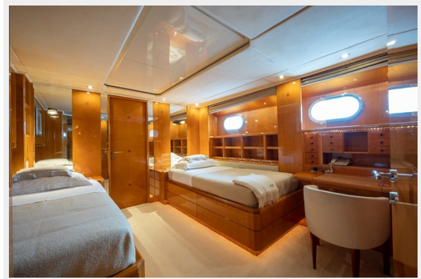
Amoha 2022 (1 sur 6)