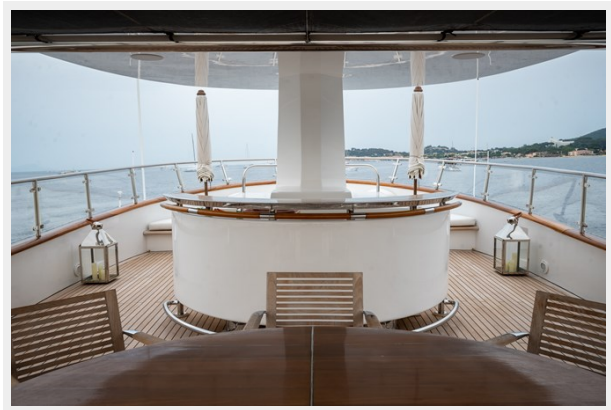
Shooting Yacht Amoha (160 sur 291)