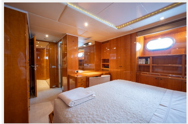
Shooting Yacht Amoha (33 sur 291)