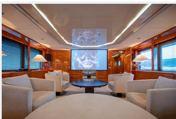
Shooting Yacht Amoha (88 sur 291)