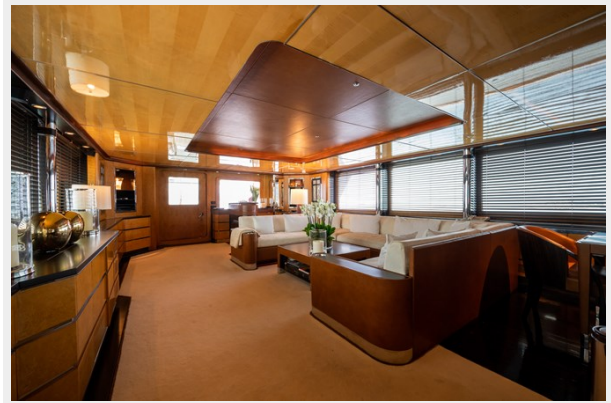
Shooting Yacht Amoha (94 sur 291)