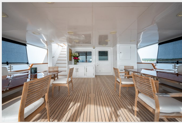
Shooting Yacht Amoha (214 sur 291)