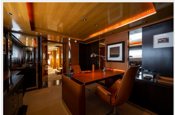
Shooting Yacht Amoha (49 sur 291)