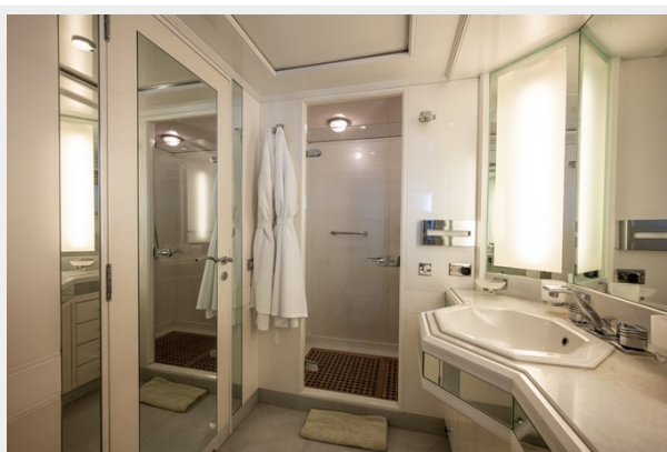
Shooting Yacht Amoha (11 sur 291)