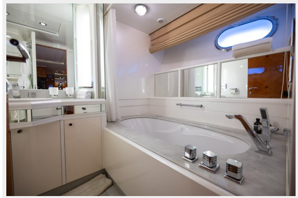
Shooting Yacht Amoha by Arsi Sebastien Photographe (26 sur 291)