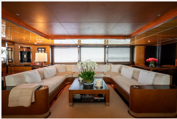
Shooting Yacht Amoha (93 sur 291)