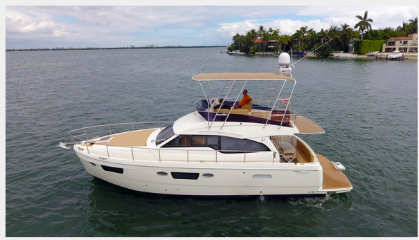
Main pic 2