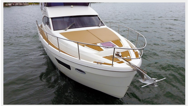
Main pic 3