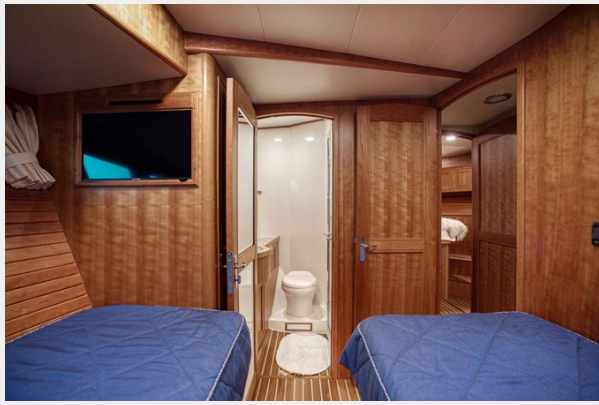
Port Guest Private Head and Shower