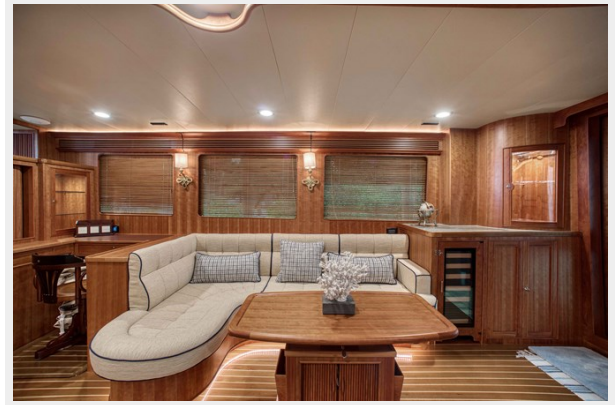
Salon Stbd. Side