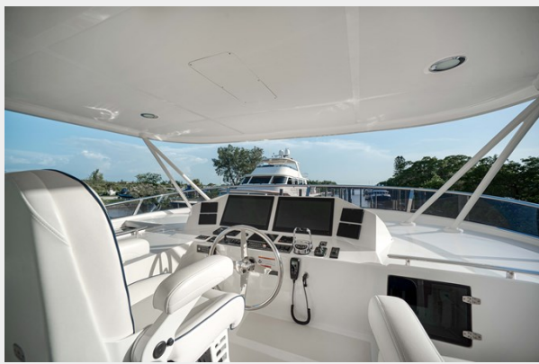
Upper Helm 1