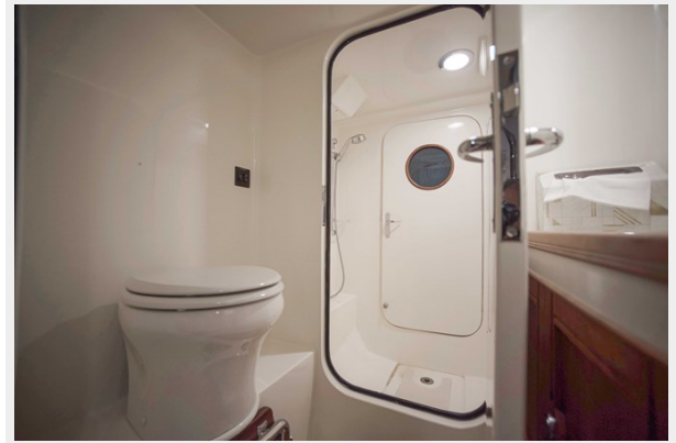
Crew Toilet and Stall Shower