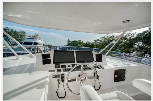
Upper Helm 2