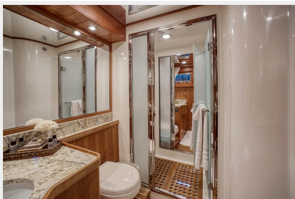
Master Head 1 of 2