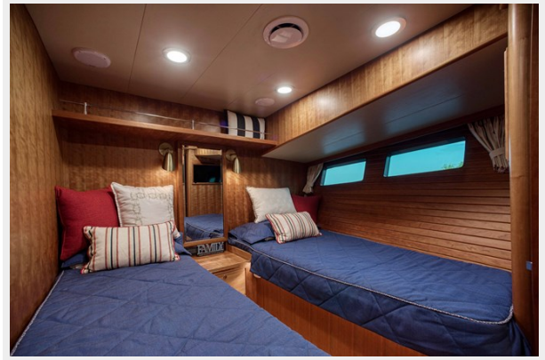
Port Guest Berths