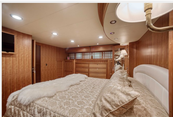
Master Looking Stbd