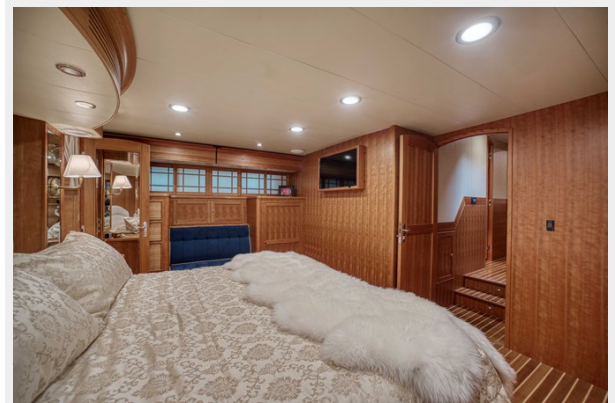
Master Looking Port