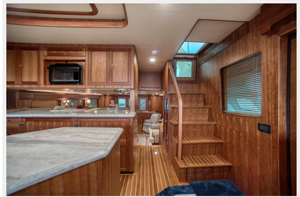
Stairs to Flybridge