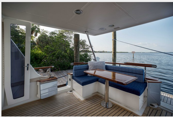
Stbd Cockpit Seat