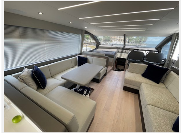
JPEG image 9