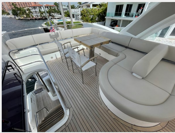
JPEG image 39