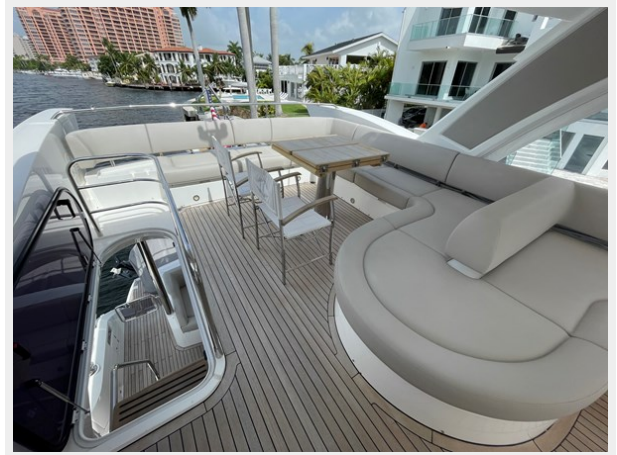
JPEG image 40