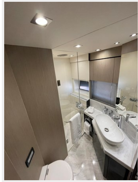
JPEG image 2