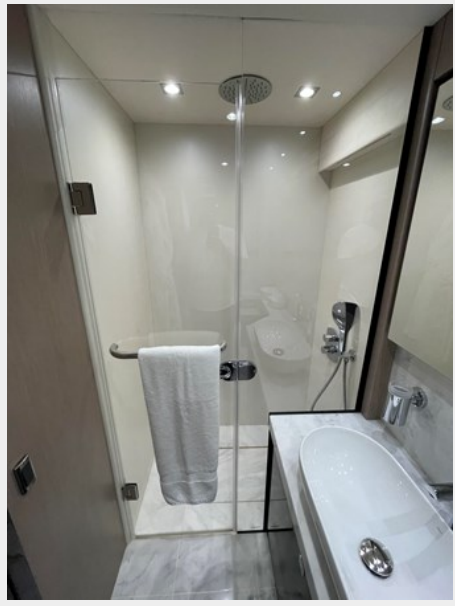
JPEG image 16