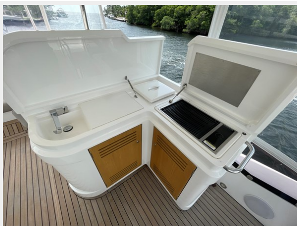
JPEG image 41