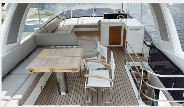
JPEG image 21