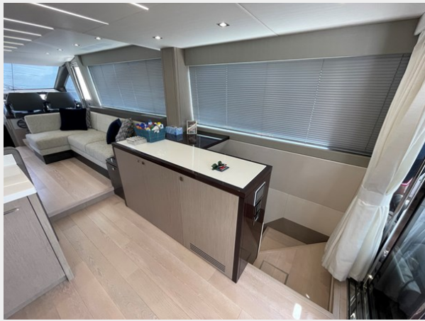
JPEG image 13