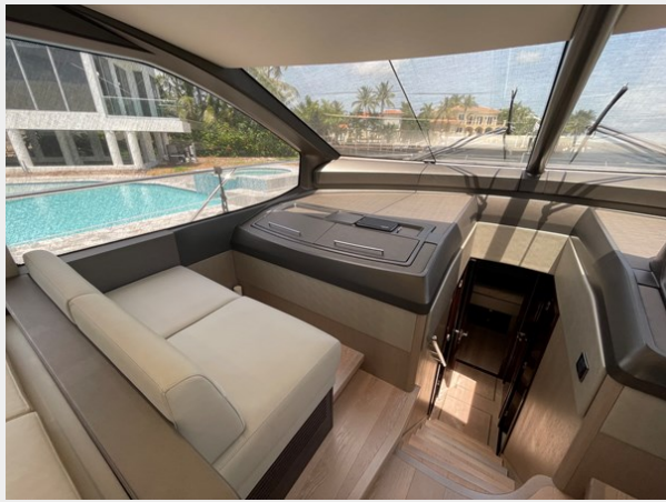
JPEG image 8