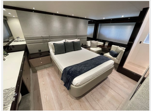
JPEG image 17