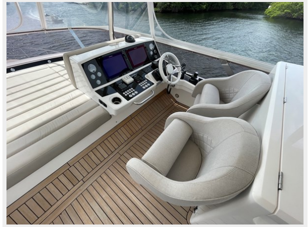
JPEG image 37