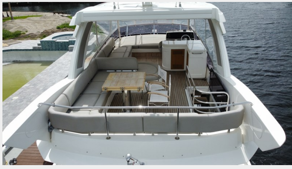
JPEG image 20