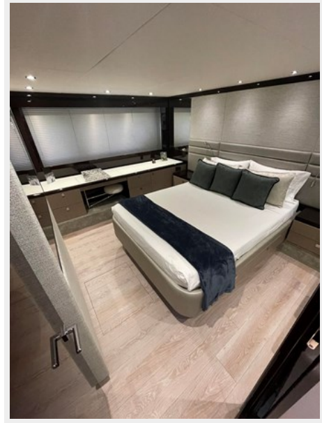
JPEG image 14