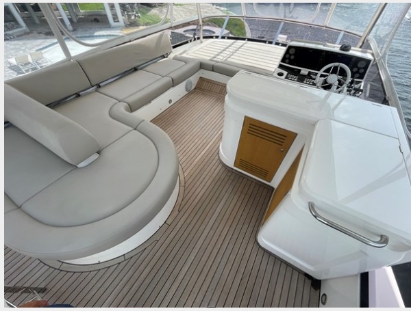
JPEG image 36