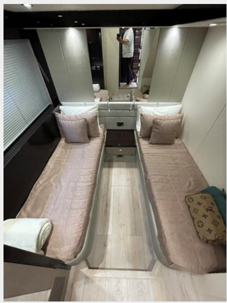
JPEG image 3