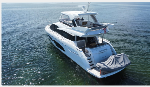
JPEG image 27