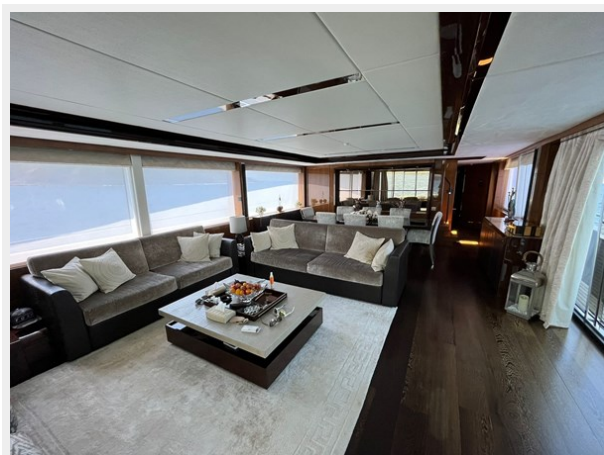
WhatsApp Image 2022-08-18 at 11.19.23 (1)