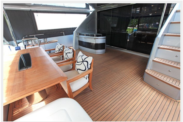
WhatsApp Image 2022-08-18 at 11.19.22