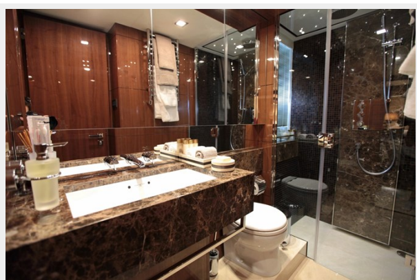
WhatsApp Image 2022-08-18 at 11.19.03 (1)