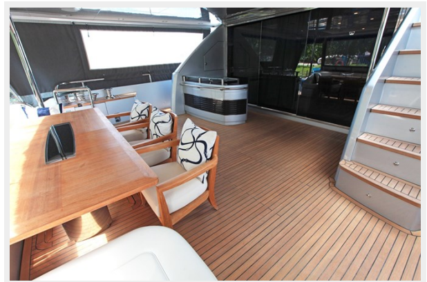
WhatsApp Image 2022-08-18 at 11.19.22