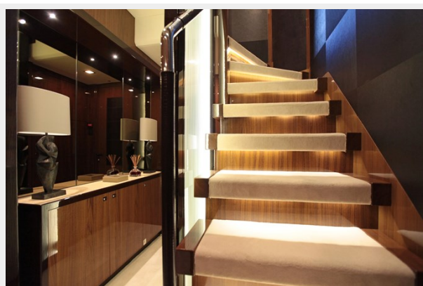
WhatsApp Image 2022-08-18 at 11.19.07