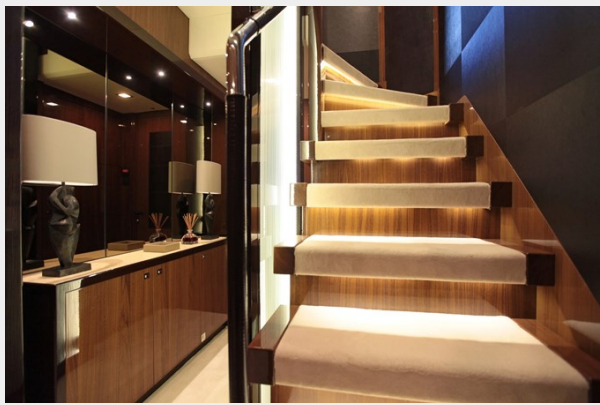
WhatsApp Image 2022-08-18 at 11.19.07