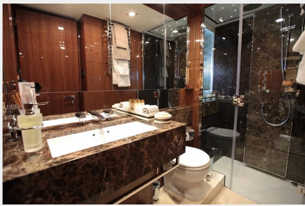
WhatsApp Image 2022-08-18 at 11.19.03 (1)