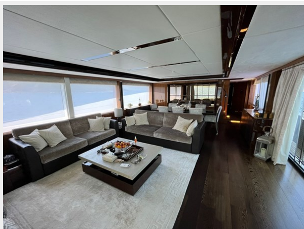
WhatsApp Image 2022-08-18 at 11.19.23 (1)