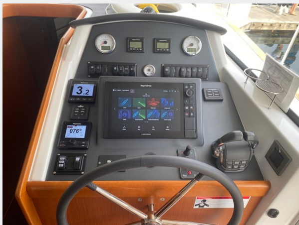
2019 ST 44 - 31