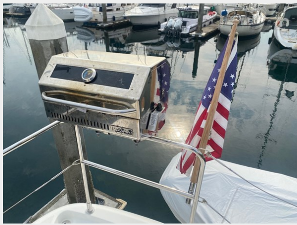
2019 ST 44 - 24