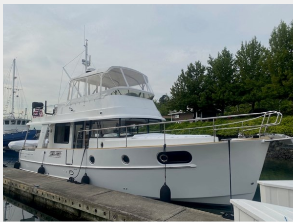
2019 ST 44 - 1