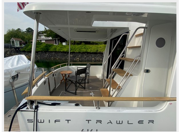
2019 ST 44 - 11