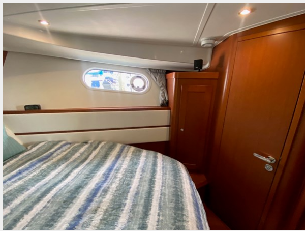
2019 ST 44 - 35