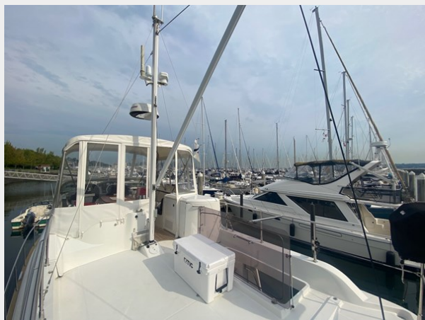
2019 ST 44 - 17