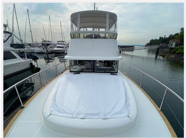
2019 ST 44 - 6