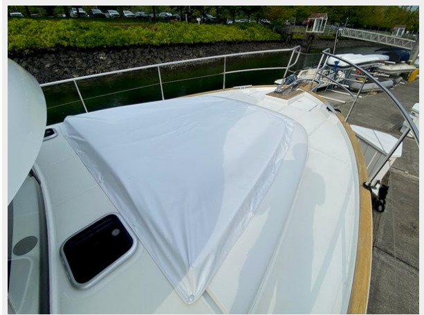
2019 ST 44 - 4