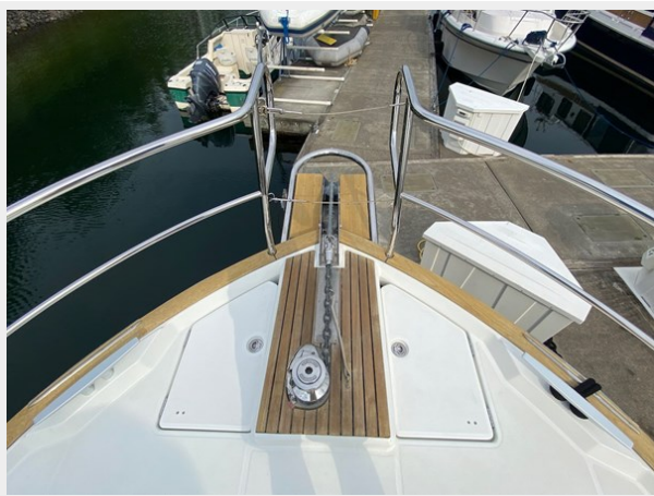
2019 ST 44 - 5