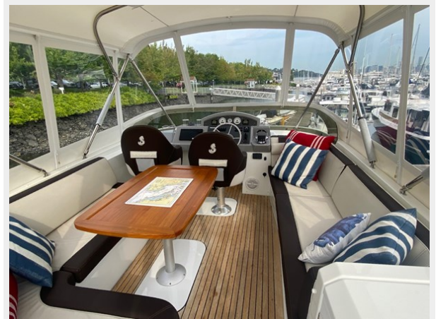
2019 ST 44 - 18