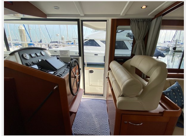
2019 ST 44 - 30