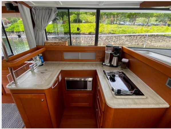
2019 ST 44 - 29