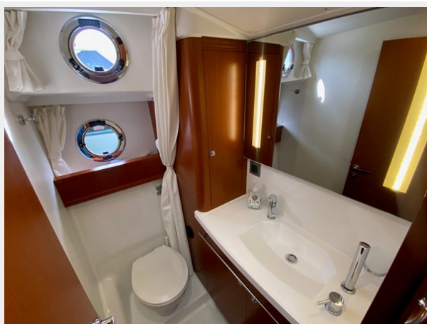
2019 ST 44 - 39