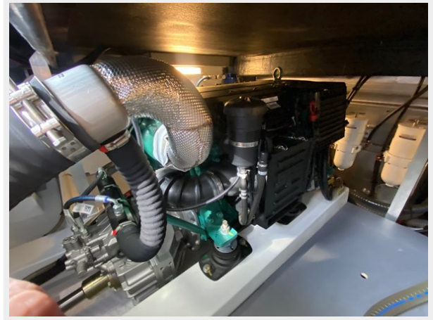
2019 ST 44 - 42