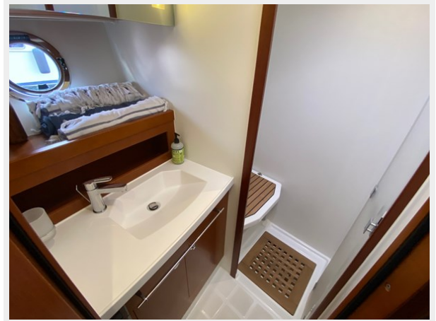
2019 ST 44 - 36