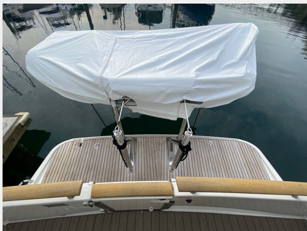
2019 ST 44 - 43