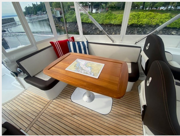
2019 ST 44 - 22