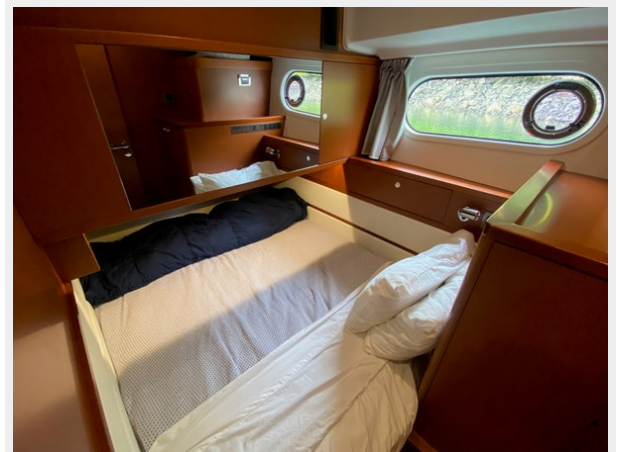
2019 ST 44 - 38