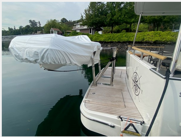
2019 ST 44 - 15