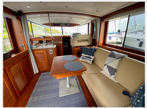
2019 ST 44 - 26