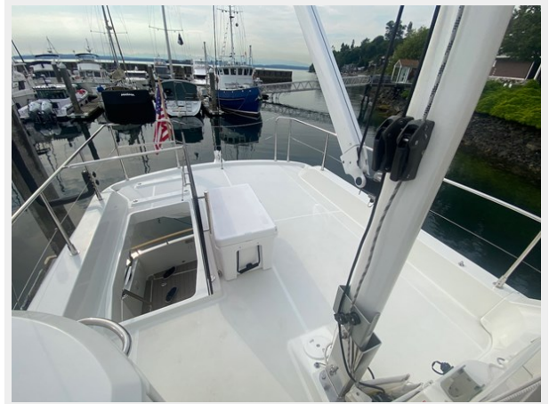
2019 ST 44 - 16