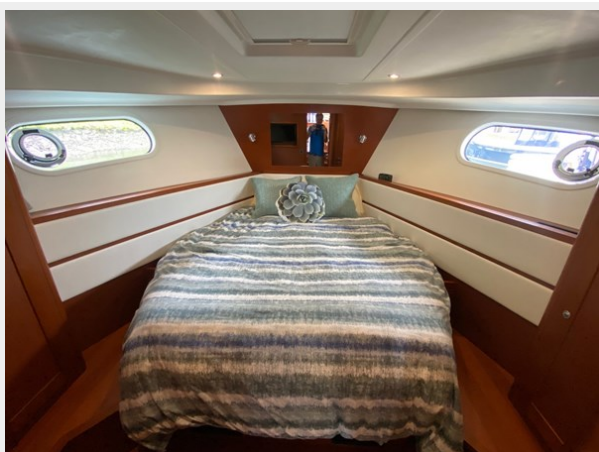
2019 ST 44 - 33