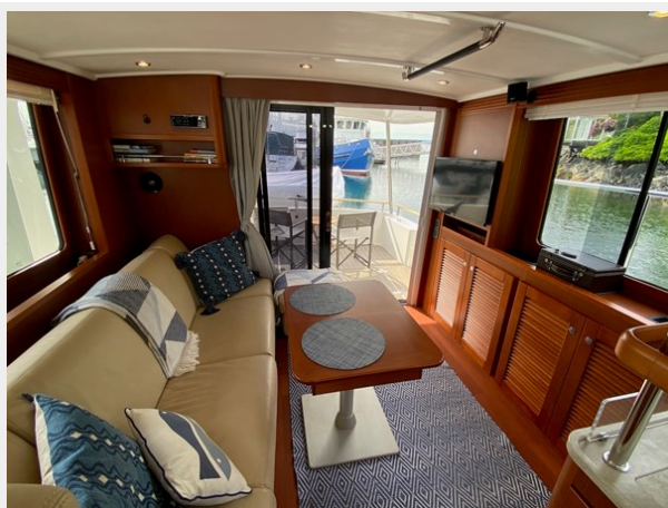
2019 ST 44 - 27