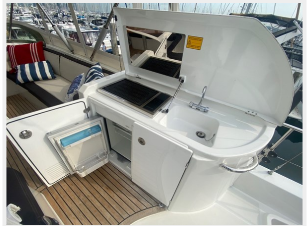
2019 ST 44 - 23