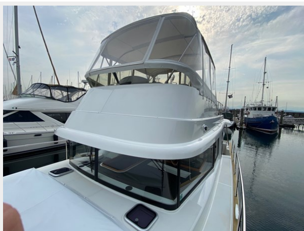
2019 ST 44 - 7