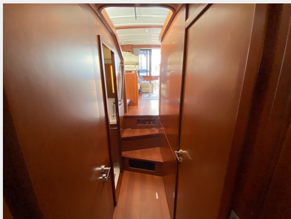
2019 ST 44 - 37