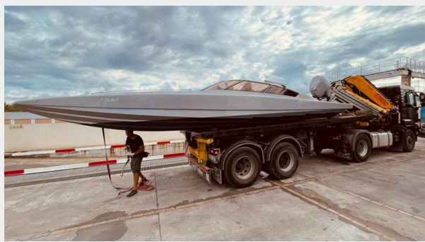
WhatsApp Image 2022-08-25 at 12.13.54 PM (6)