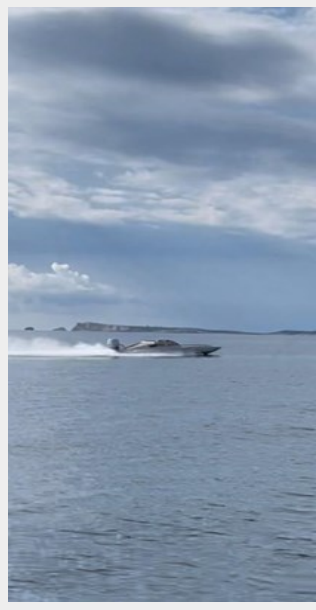
WhatsApp Image 2022-08-25 at 12.13.53 PM (4)