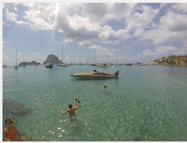
WhatsApp Image 2022-08-25 at 12.13.54 PM (8)