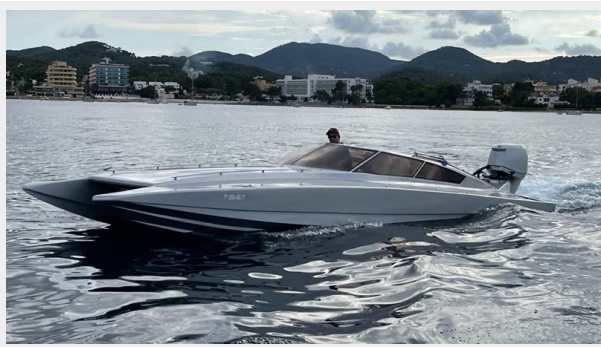
WhatsApp Image 2022-08-25 at 12.13.54 PM