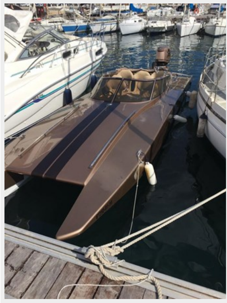
WhatsApp Image 2022-08-25 at 12.13.54 PM (12)