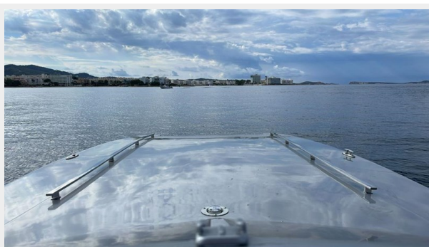
WhatsApp Image 2022-08-25 at 12.13.53 PM (2)