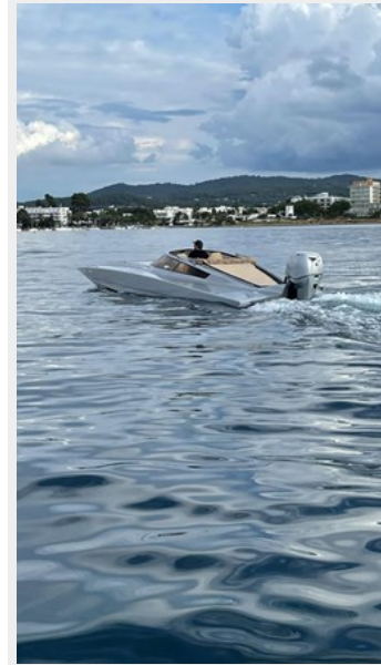
WhatsApp Image 2022-08-25 at 12.13.53 PM (1)