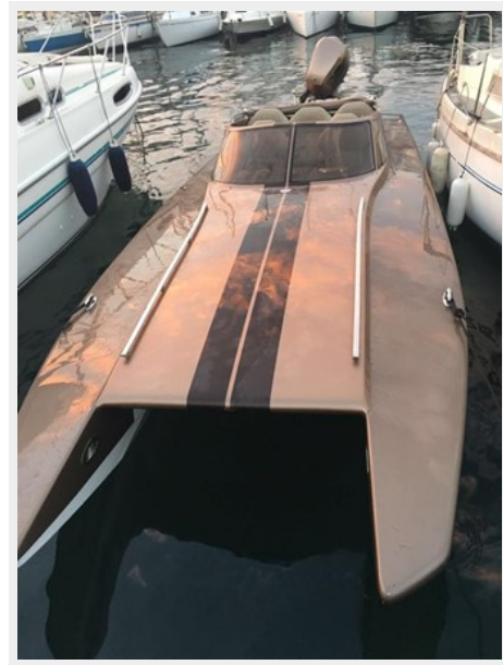
WhatsApp Image 2022-08-25 at 12.13.54 PM (9)