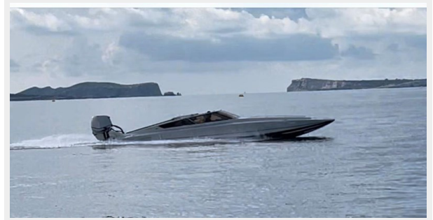
WhatsApp Image 2022-08-25 at 12.13.53 PM