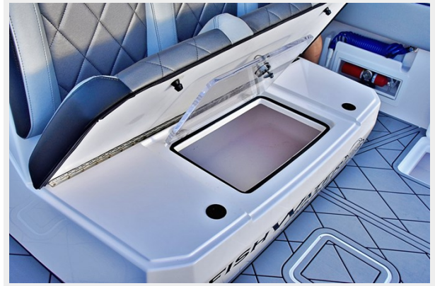
Front console seat