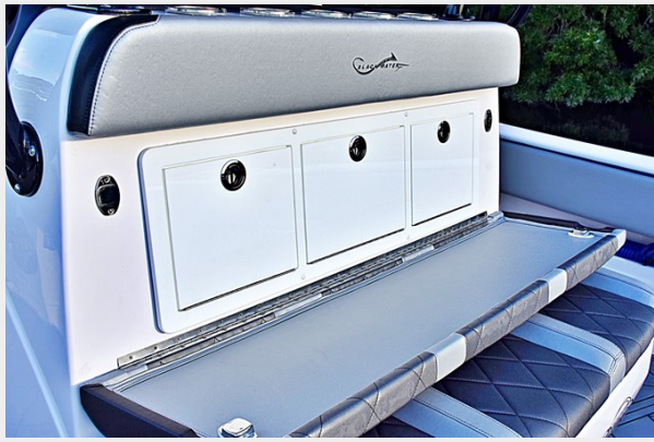
Back Captains Seat