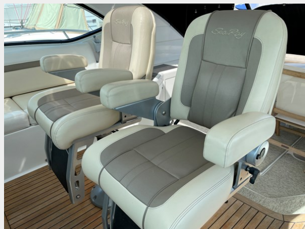
14_2014 54ft Sea Ray Sundancer BRIGG SEA