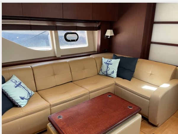
24_2014 54ft Sea Ray Sundancer BRIGG SEA