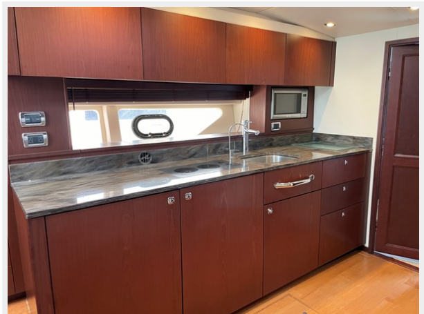
23_2014 54ft Sea Ray Sundancer BRIGG SEA