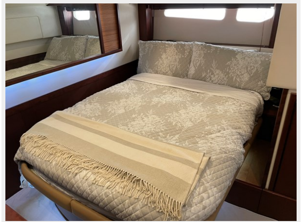
27_2014 54ft Sea Ray Sundancer BRIGG SEA