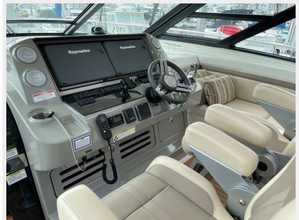
15_2014 54ft Sea Ray Sundancer BRIGG SEA