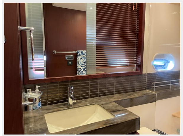
31_2014 54ft Sea Ray Sundancer BRIGG SEA