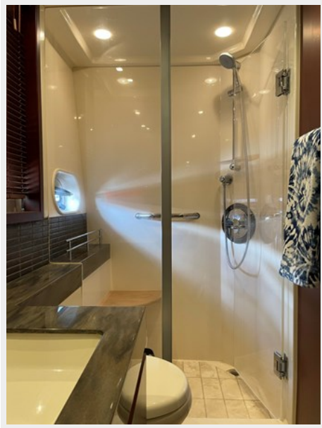
34_2014 54ft Sea Ray Sundancer BRIGG SEA