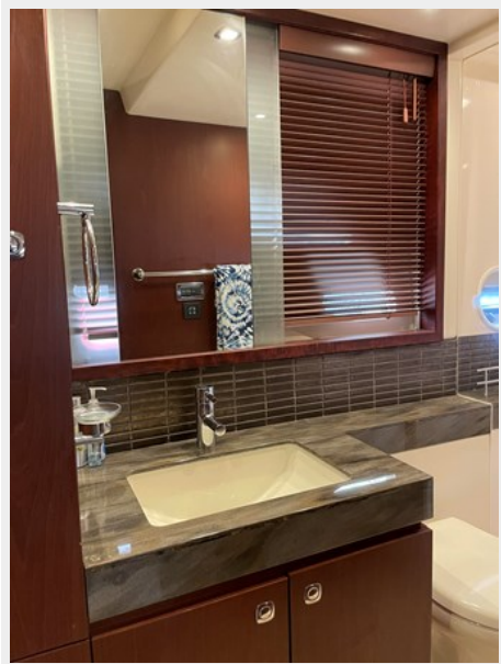
32_2014 54ft Sea Ray Sundancer BRIGG SEA