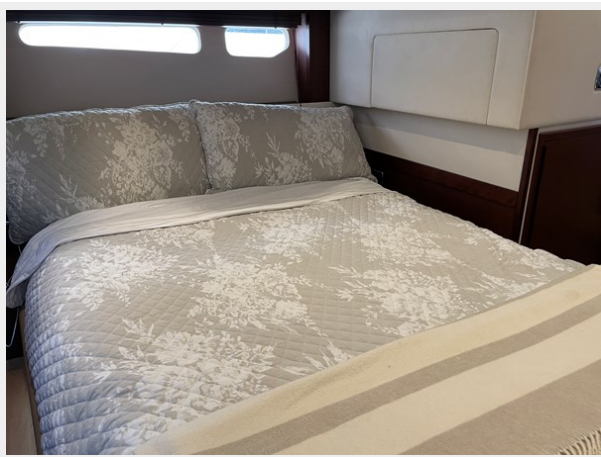
28_2014 54ft Sea Ray Sundancer BRIGG SEA