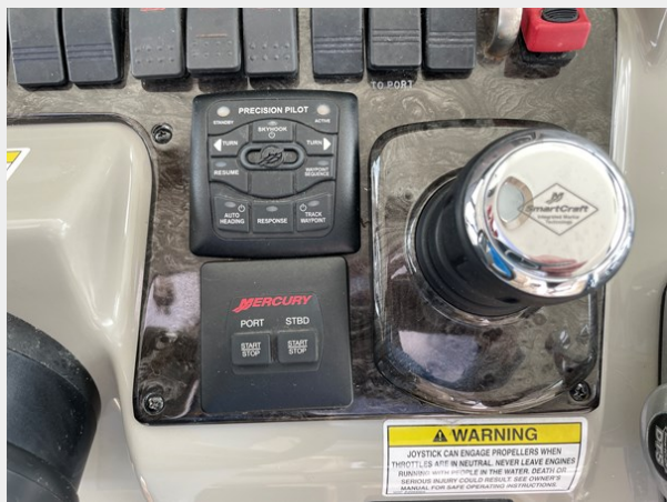
20_2014 54ft Sea Ray Sundancer BRIGG SEA