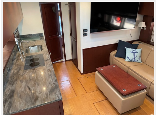
21_2014 54ft Sea Ray Sundancer BRIGG SEA