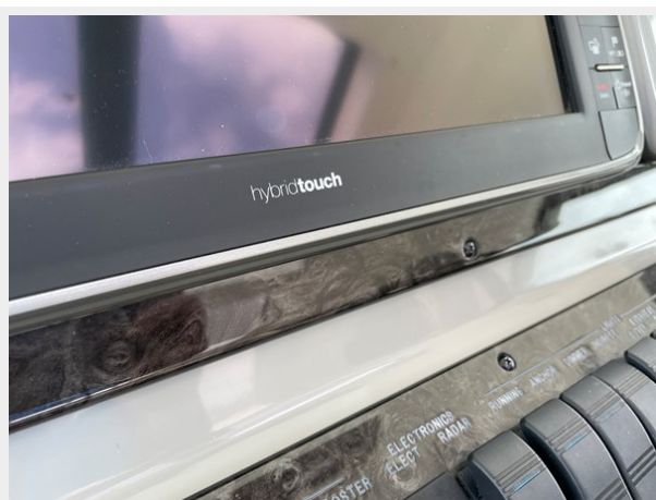
18_2014 54ft Sea Ray Sundancer BRIGG SEA