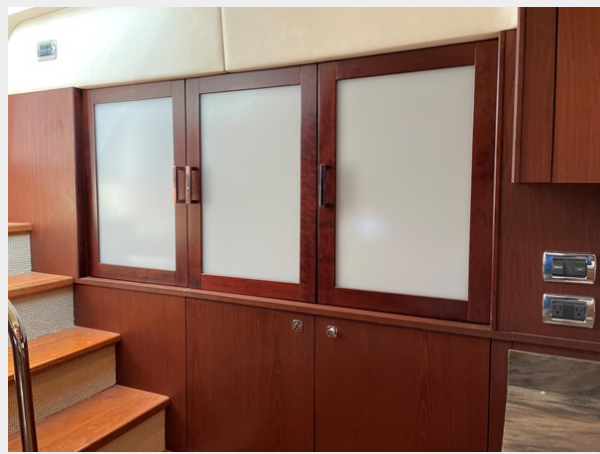
46_2014 54ft Sea Ray Sundancer BRIGG SEA