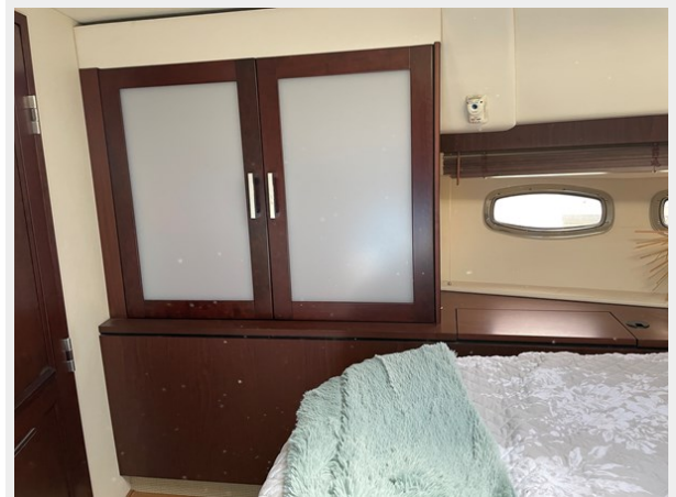
39_2014 54ft Sea Ray Sundancer BRIGG SEA