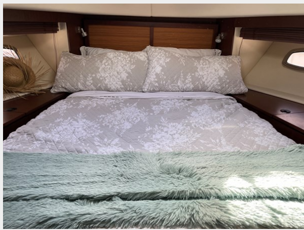
40_2014 54ft Sea Ray Sundancer BRIGG SEA