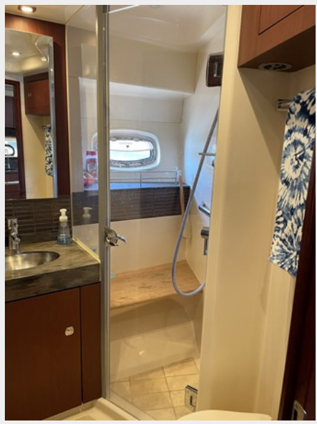
42_2014 54ft Sea Ray Sundancer BRIGG SEA