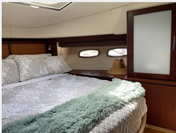
38_2014 54ft Sea Ray Sundancer BRIGG SEA