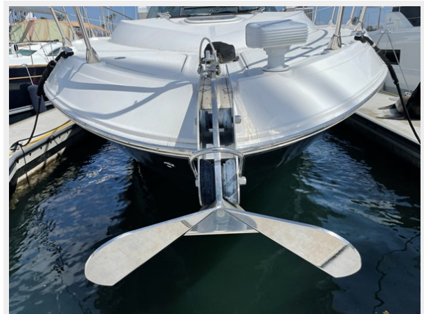
6_2014 54ft Sea Ray Sundancer BRIGG SEA 7_2014 54ft Sea Ray Sundancer BRIGG SEA