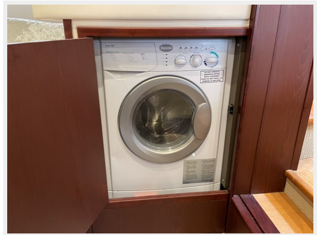
35_2014 54ft Sea Ray Sundancer BRIGG SEA