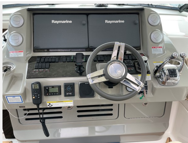
16_2014 54ft Sea Ray Sundancer BRIGG SEA