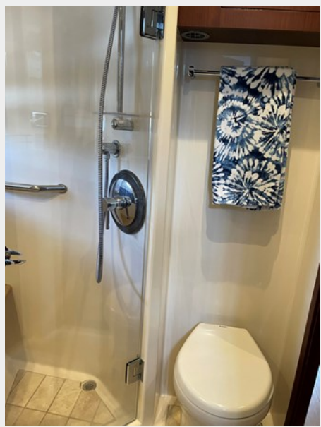
44_2014 54ft Sea Ray Sundancer BRIGG SEA