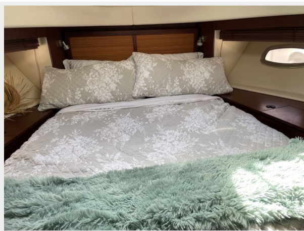
36_2014 54ft Sea Ray Sundancer BRIGG SEA