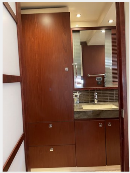
30_2014 54ft Sea Ray Sundancer BRIGG SEA