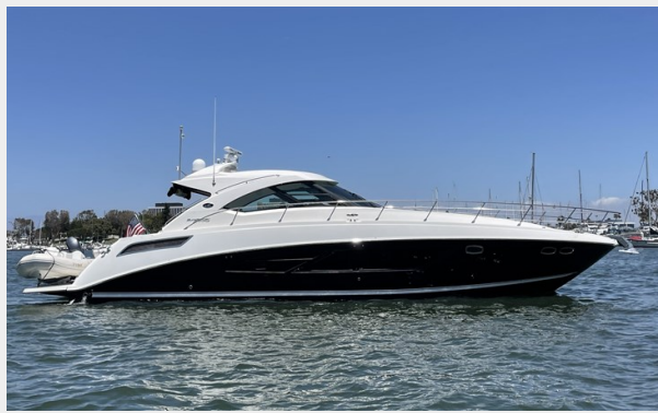
2_2014 54ft Sea Ray Sundancer BRIGG SEA 3_2014 54ft Sea Ray Sundancer BRIGG SEA