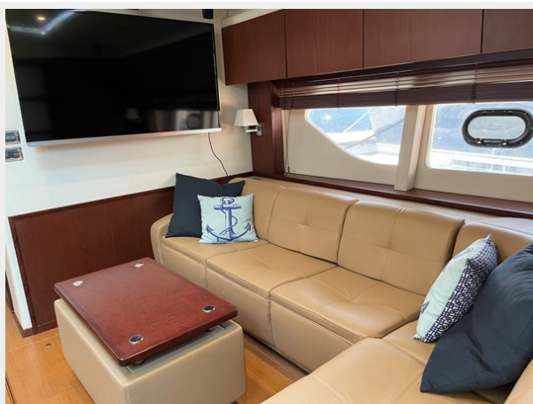
22_2014 54ft Sea Ray Sundancer BRIGG SEA