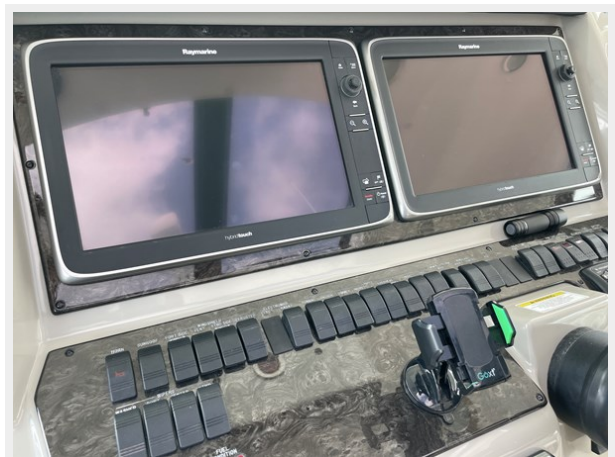
17_2014 54ft Sea Ray Sundancer BRIGG SEA