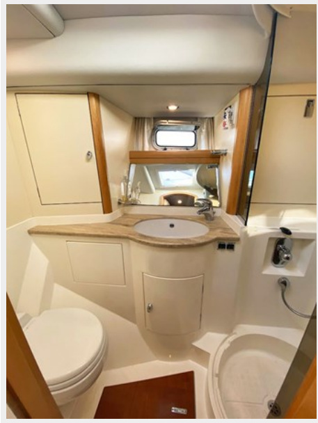
Forward Head and Shower