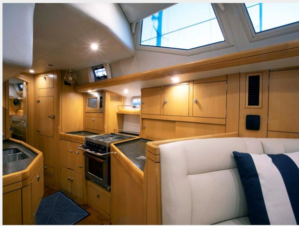
Galley, Looking Aft