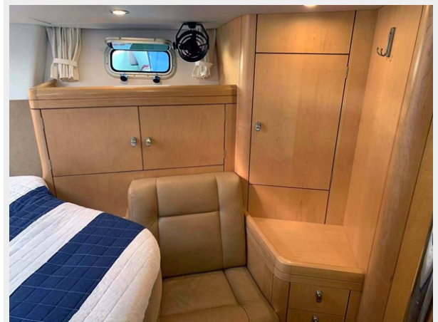
VIP Cabin, Stbd.