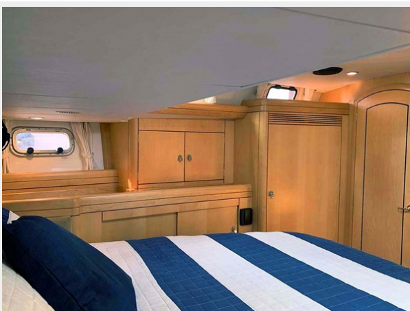
Owner's Cabin, Port