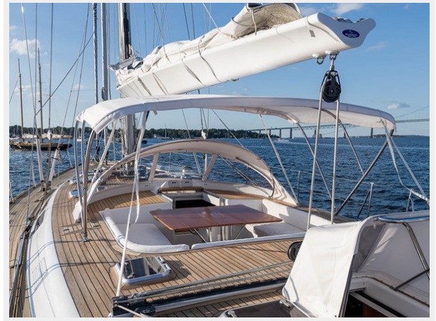
Dodger and Bimini