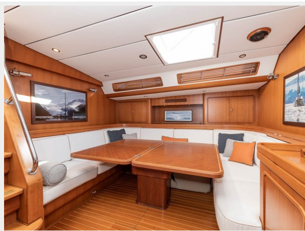
Port Salon Settee