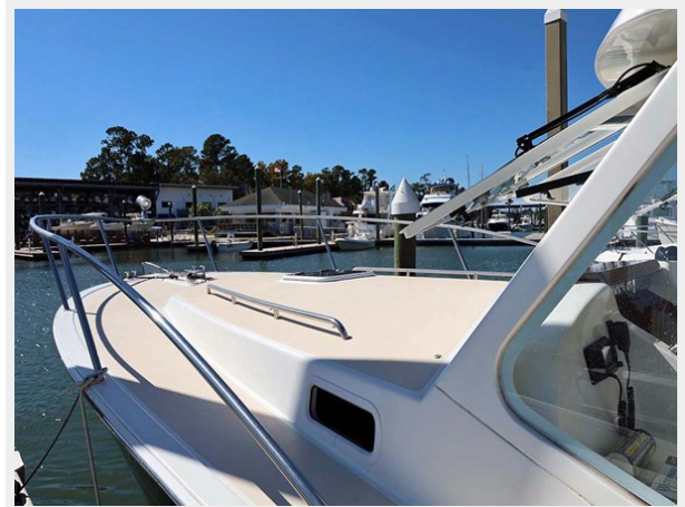
Cabin Trunk and Windshield