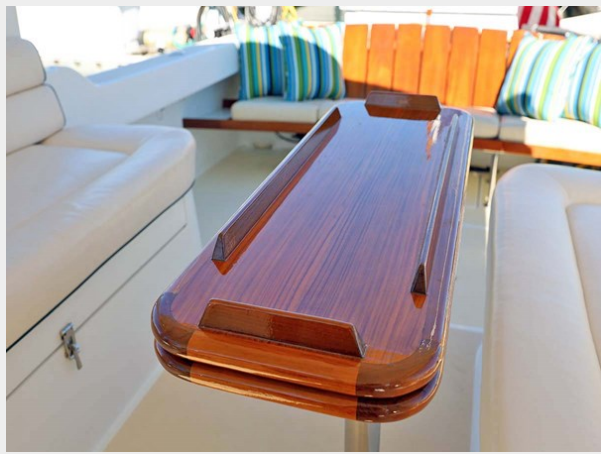
Bridgedeck Table Detail