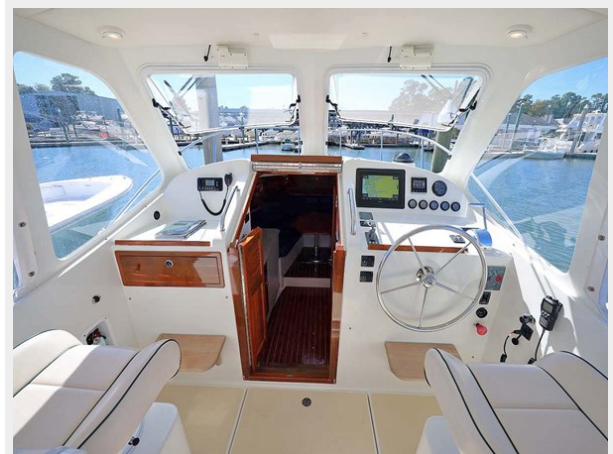
Helm and Nav Pod to Port