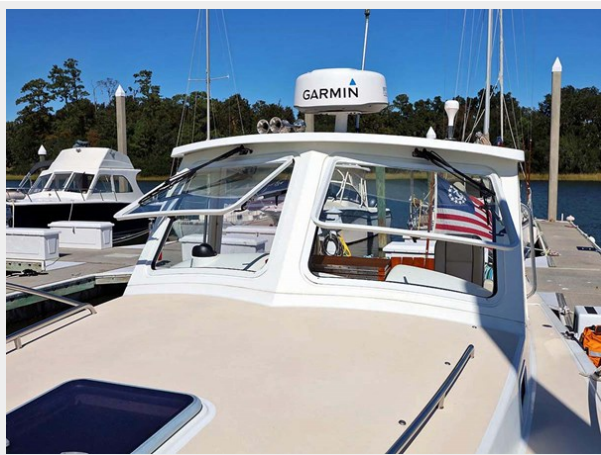
Front Opening Windshield Panels