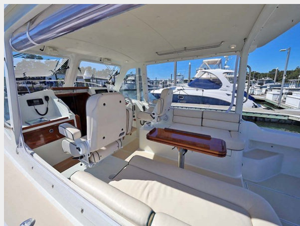
Bridgedeck Looking to Starboard