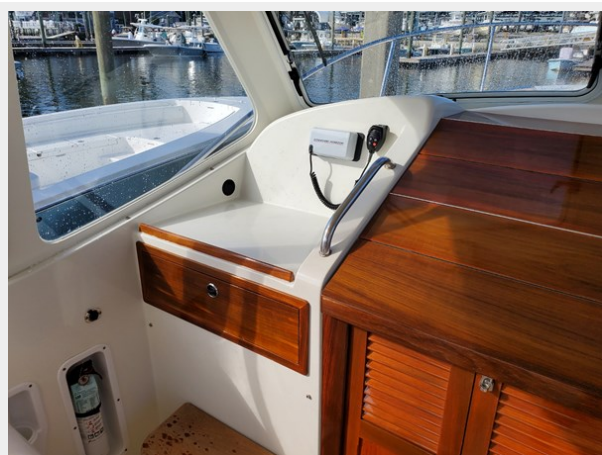
Port Side Dash