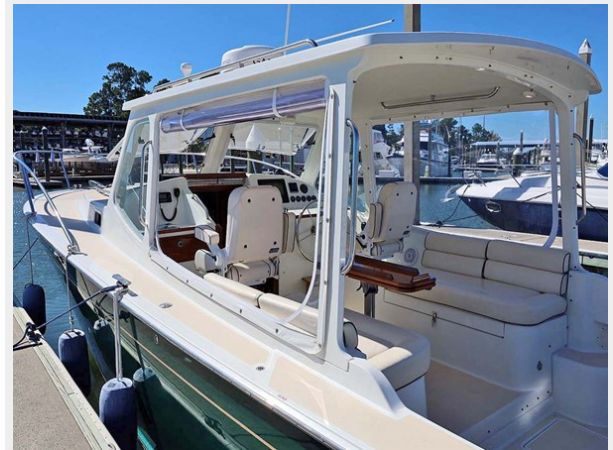
Bridgedeck and Hardtop