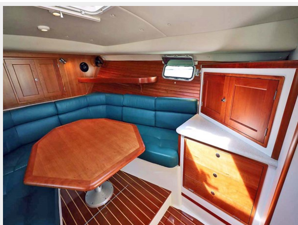
Interior to Starboard