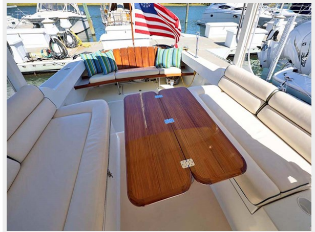
Bridgedeck Table Open