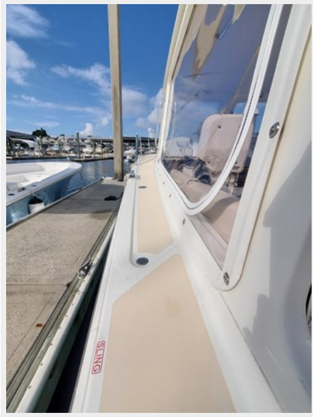
Port Side Deck Detail