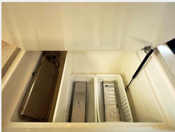
Reefer and Freezer