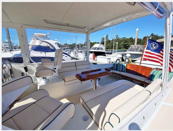
Bridgedeck Aft to Starboard