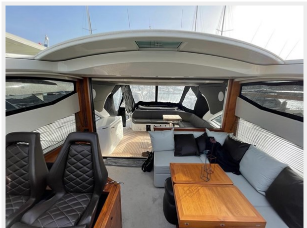
SUNSEEKER PREDATOR 57 4