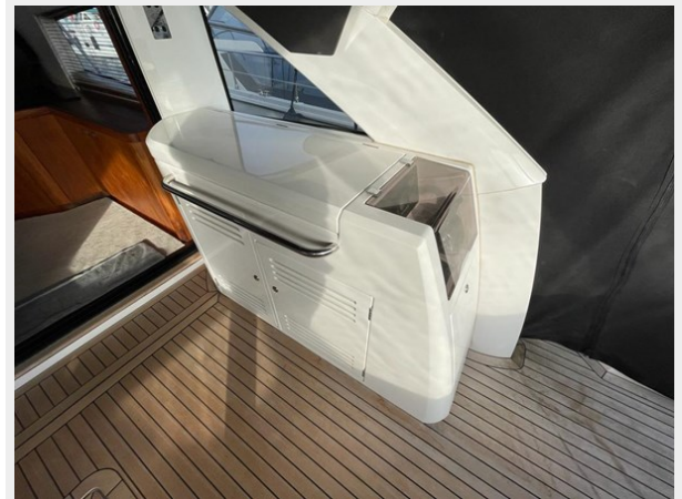
SUNSEEKER PREDATOR 57 10