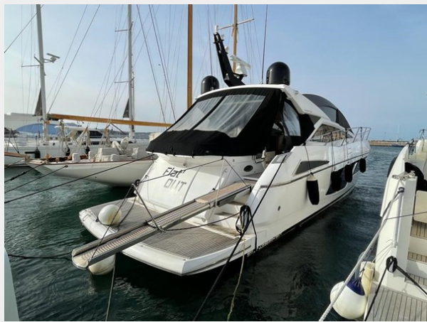
SUNSEEKER PREDATOR 57 1