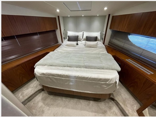
SUNSEEKER PREDATOR 57 13