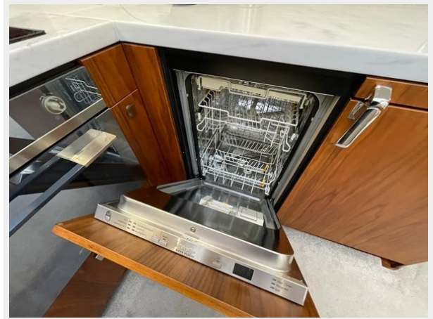
SUNSEEKER PREDATOR 57 8