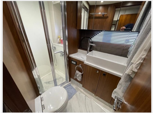
SUNSEEKER PREDATOR 57 14