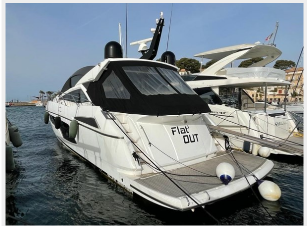
SUNSEEKER PREDATOR 57 2