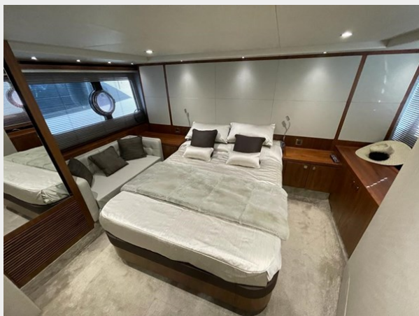
SUNSEEKER PREDATOR 57 15