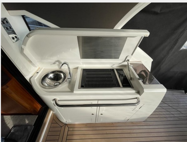
SUNSEEKER PREDATOR 57 11