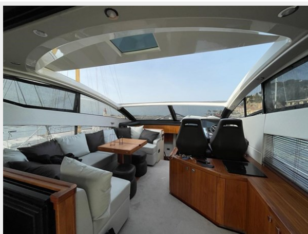
SUNSEEKER PREDATOR 57 5