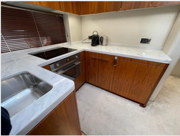
SUNSEEKER PREDATOR 57 7