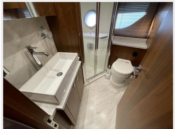
SUNSEEKER PREDATOR 57 16