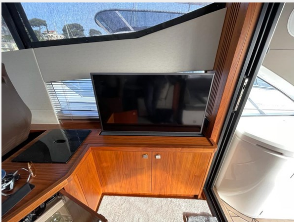
SUNSEEKER PREDATOR 57 9