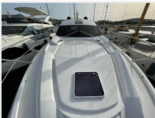
SUNSEEKER PREDATOR 57 3