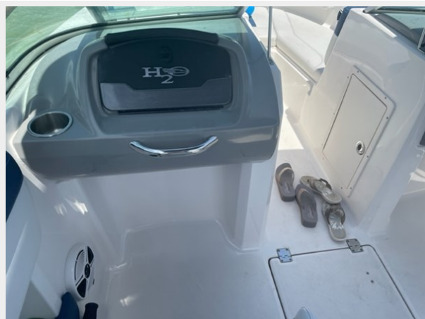
06-PORT SIDE CONSOLE