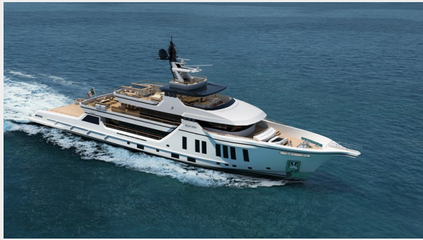
54mt Motor Yacht Explorer Project Bow Sprit (1)