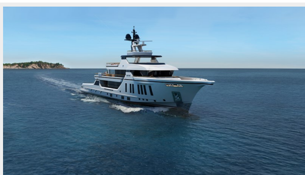
54mt Motor Yacht Explorer Project Bow Sprit (5)