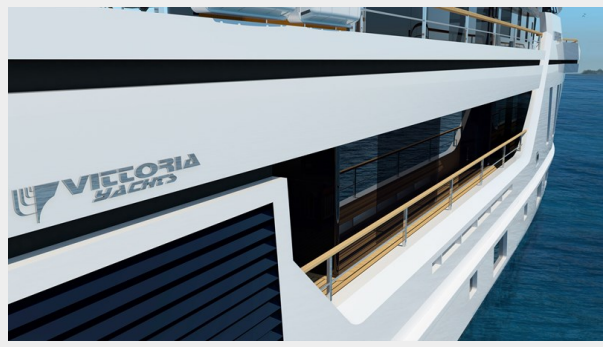
54mt Motor Yacht Explorer Project Bow Sprit (13)