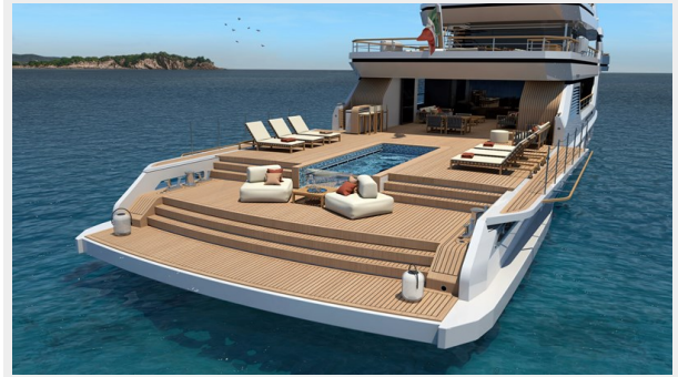
54mt Motor Yacht Explorer Project Bow Sprit (2)