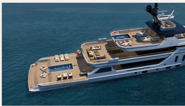
54mt Motor Yacht Explorer Project Bow Sprit (11)