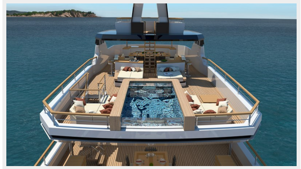
54mt Motor Yacht Explorer Project Bow Sprit (8)