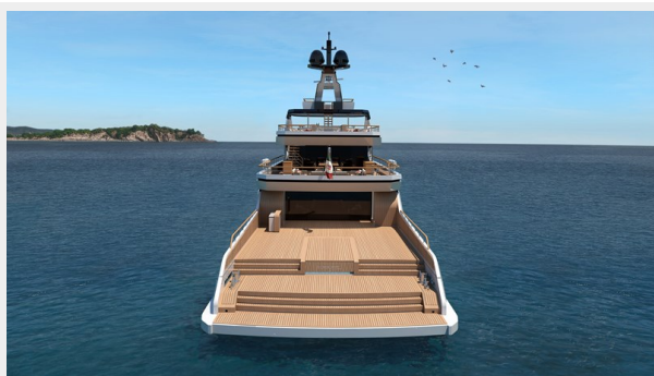
54mt Motor Yacht Explorer Project Bow Sprit (3)