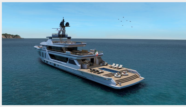
54mt Motor Yacht Explorer Project Bow Sprit (7)