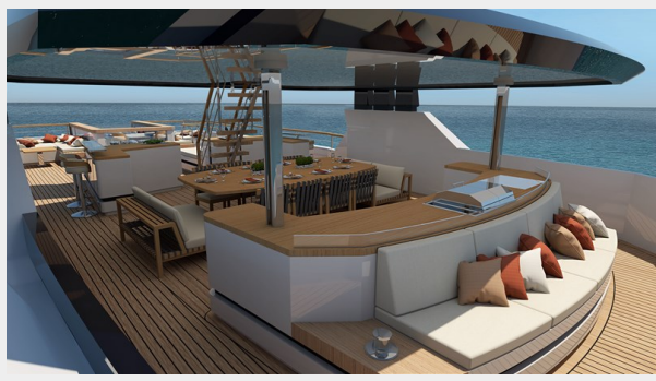
54mt Motor Yacht Explorer Project Bow Sprit (9)