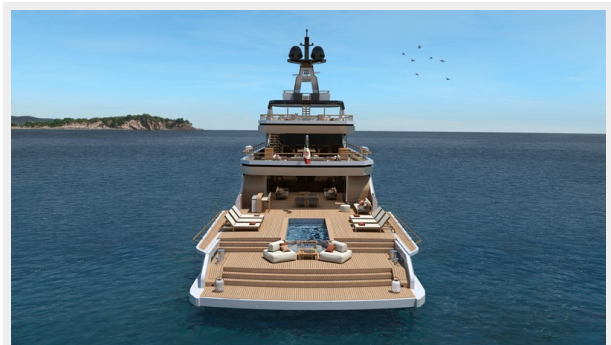
54mt Motor Yacht Explorer Project Bow Sprit (4)